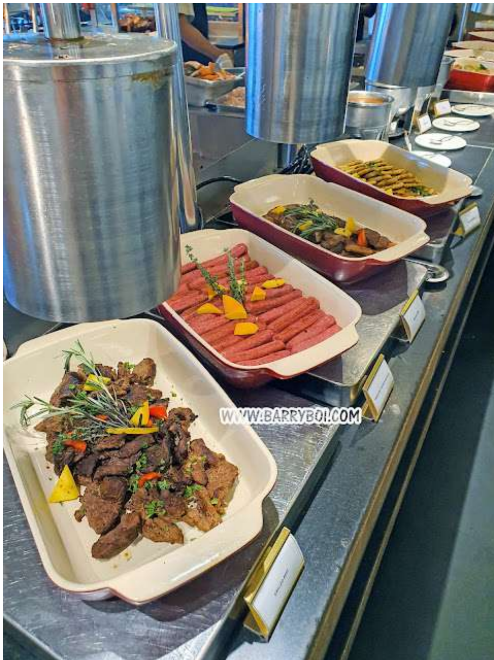
Sotong Buncit In Chef Special Sambal