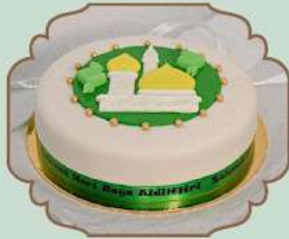
Green Velvet Cake 1kg