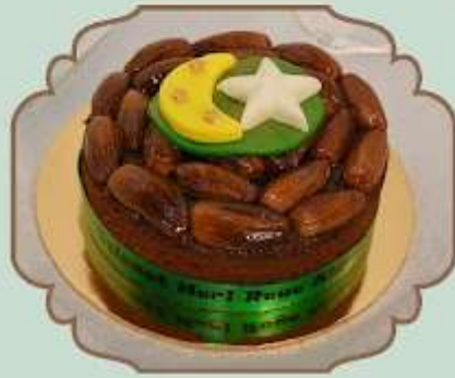
Dates Cake 500g

Available from 22nd March till 23rd April 2023