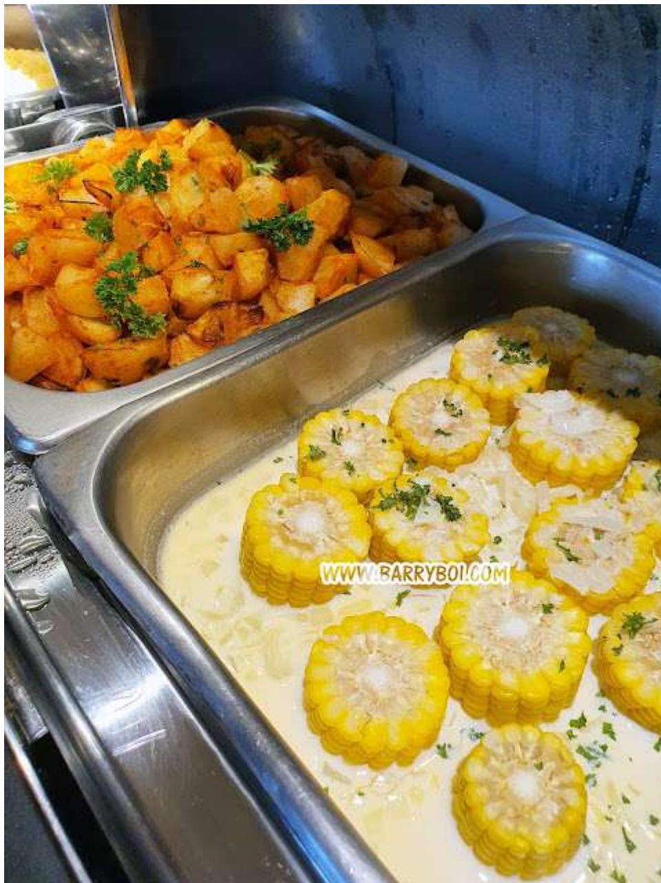
The grill sizzles with lots of juicy succulent seafood and meat variations.