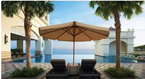
Victory Annexe Swir

The Hotel's food and beverage outlets - Palm Court, Java Tree, Sarkies and Planters Lounge have a celebrated reputation for serving an extensive menu ranging from Penang's heritage dishes to a traditional English afternoon tea whilst Farquhar's Bar is the place to be for time-honoured bar staples. For larger formal celebrations, the E&O's stately Grand Ballroom honour the era of debutante's balls and black-tie dinner dances.