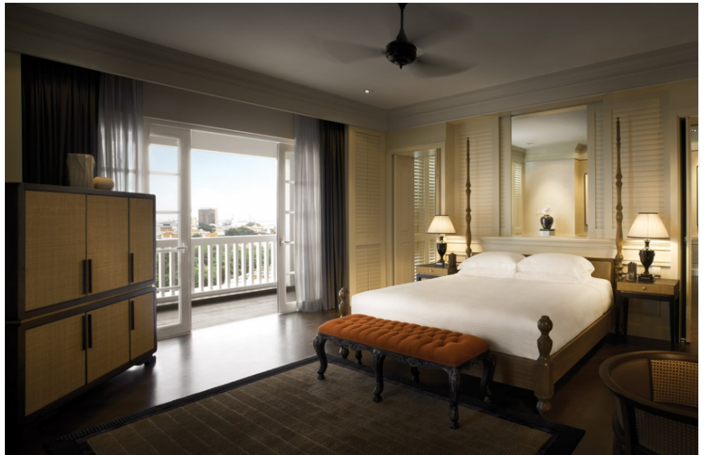
Victory Annexe Corner Suite - Bedroom

Within the Victory Annexe retail arcade nestled the E&O Gallery where many stories of guests have been documented. This specially curated museum relates the story of Penang's social and cultural milestones as seen through the eyes of the E&O and its patrons.