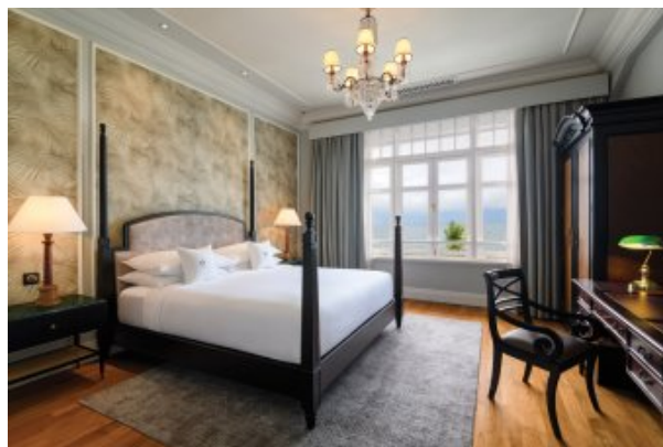
Straits Suite Bedroom