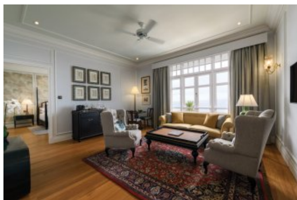
Straits Suite Living Room

Guests of the Heritage Wing are also entitled to exclusive privileges such as access to The Cornwallis - a private lounge offering complimentary evening canapes and cocktails, the Heritage Wing pool as well as premium selected beverages that will be replenished daily.