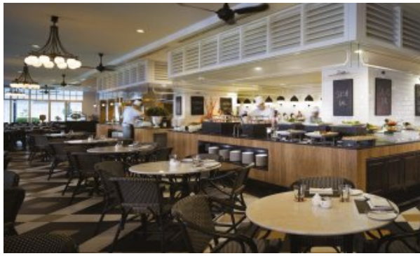
Victory Annexe Sark