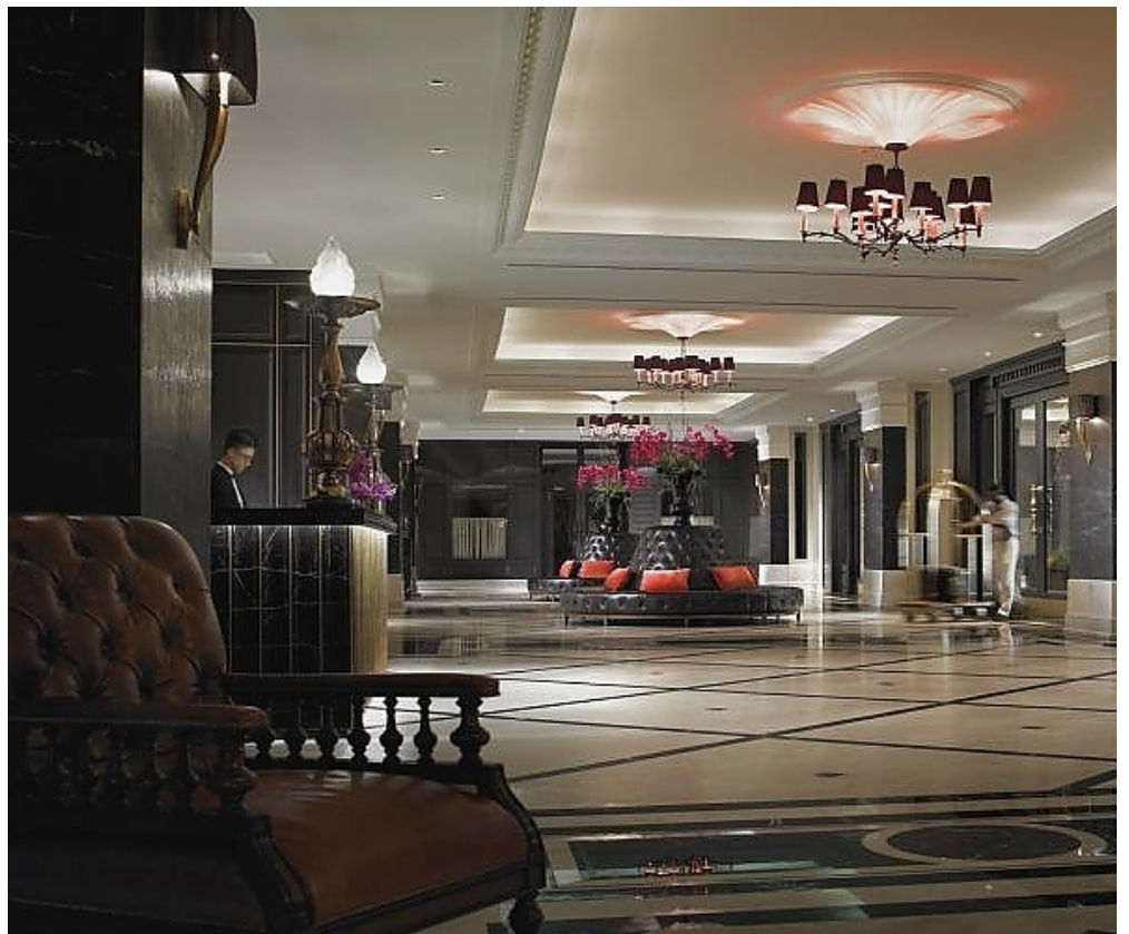
Victory Annexe Lobby

As one of the few historical hotels around the globe, the management has placed great emphasis to preserve elements of the hotel's 137-year old history such as the iconic Java tree, the manual lift, the dome and cannons.