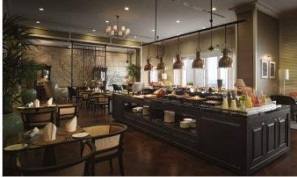
Victory Annexe Planters Lounge Buffet Area

The Hotel's food and beverage outlets - Palm Court, Java Tree, Sarkies and Planters Lounge have a celebrated reputation for serving an extensive menu ranging from Penang's heritage dishes to a traditional English afternoon tea whilst Farquhar's Bar is the place to be for time-honoured bar staples. For larger formal celebrations, the E&O's stately Grand Ballroom honour the era of debutante's balls and black-tie dinner dances.