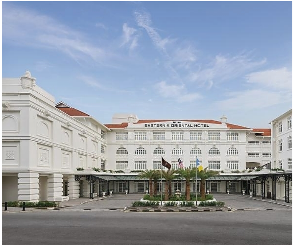
Heritage Wing Front Facade

Established by the famed Sarkies brothers in 1885, the Eastern & Oriental Hotel is the only seafront hotel in the George Town UNESCO World Heritage Site. Over its 137-year history, the E&O Hotel has played host to the world's most celebrated artists, writers and heads of state.