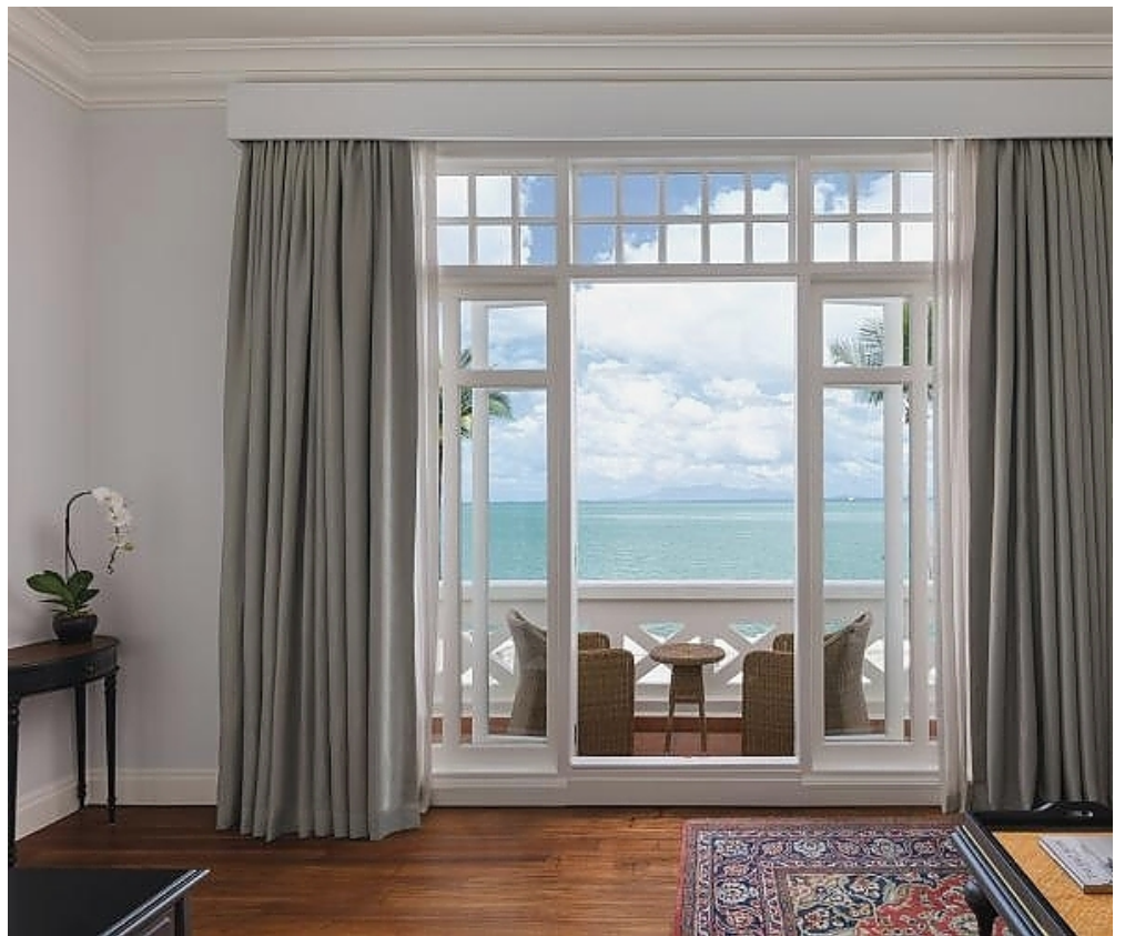
Premier Suite Balcony