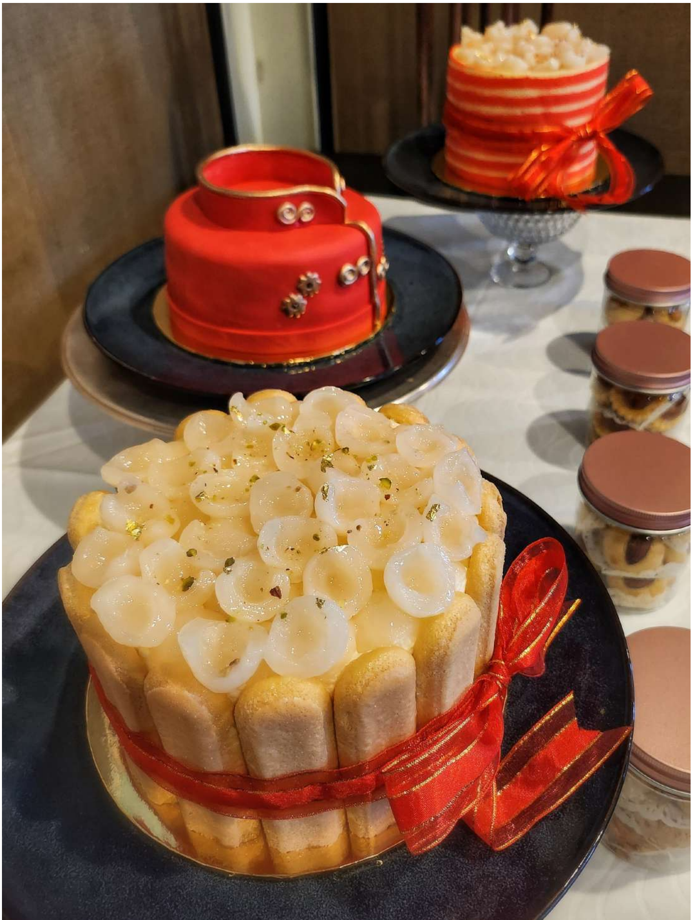
Longan Cake & Mandarin Orange Butter Cake