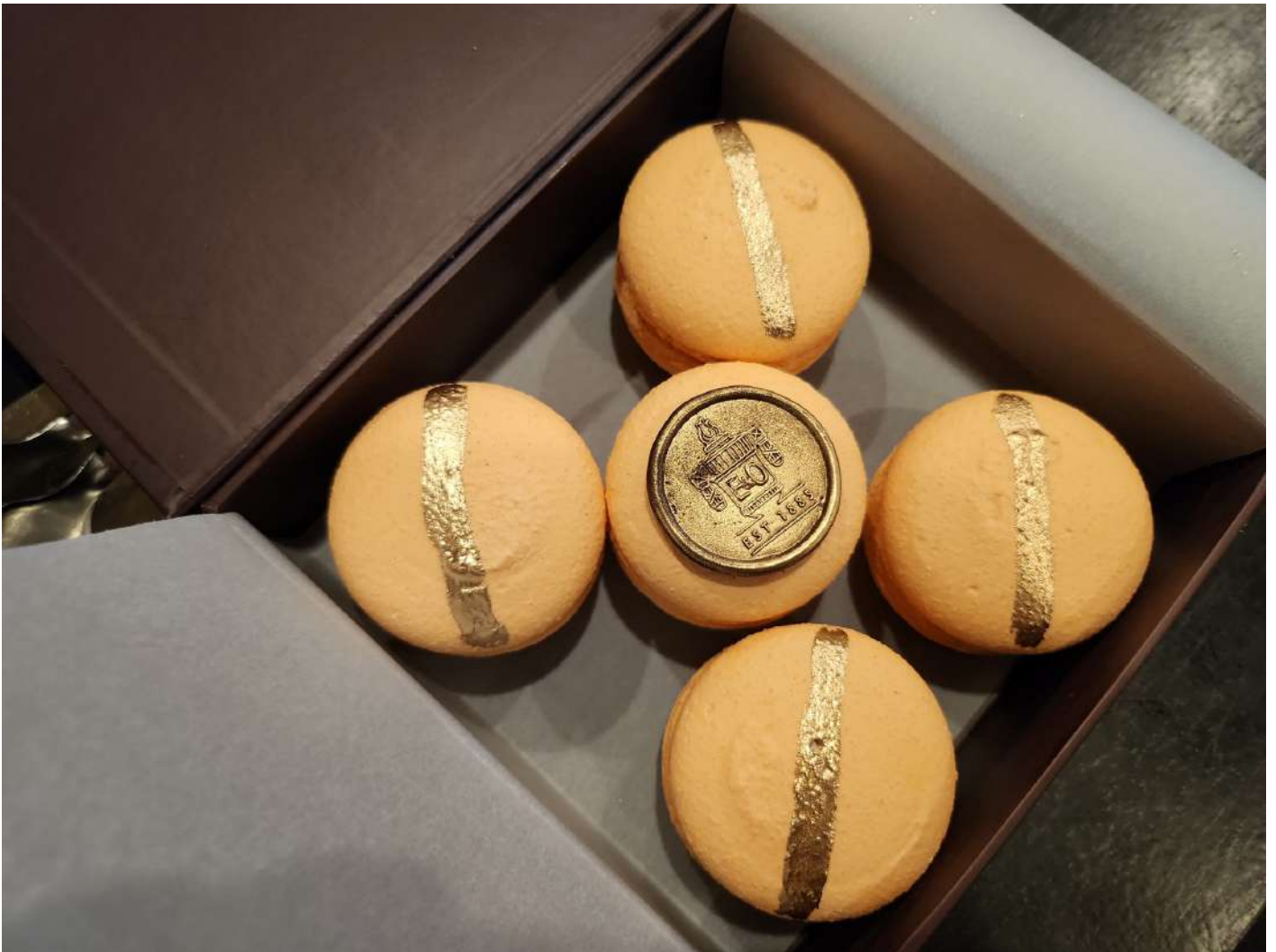
Mandarin Orange Macaroon