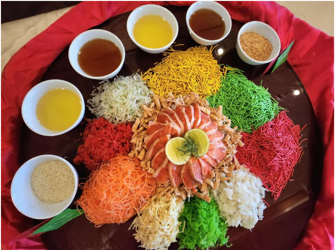
Fresh Salmon Sashimi Yee Sang

All these goodies are available for takeaway starting from 6th January till 5th February 2023. The kitchen requires three days' notice.