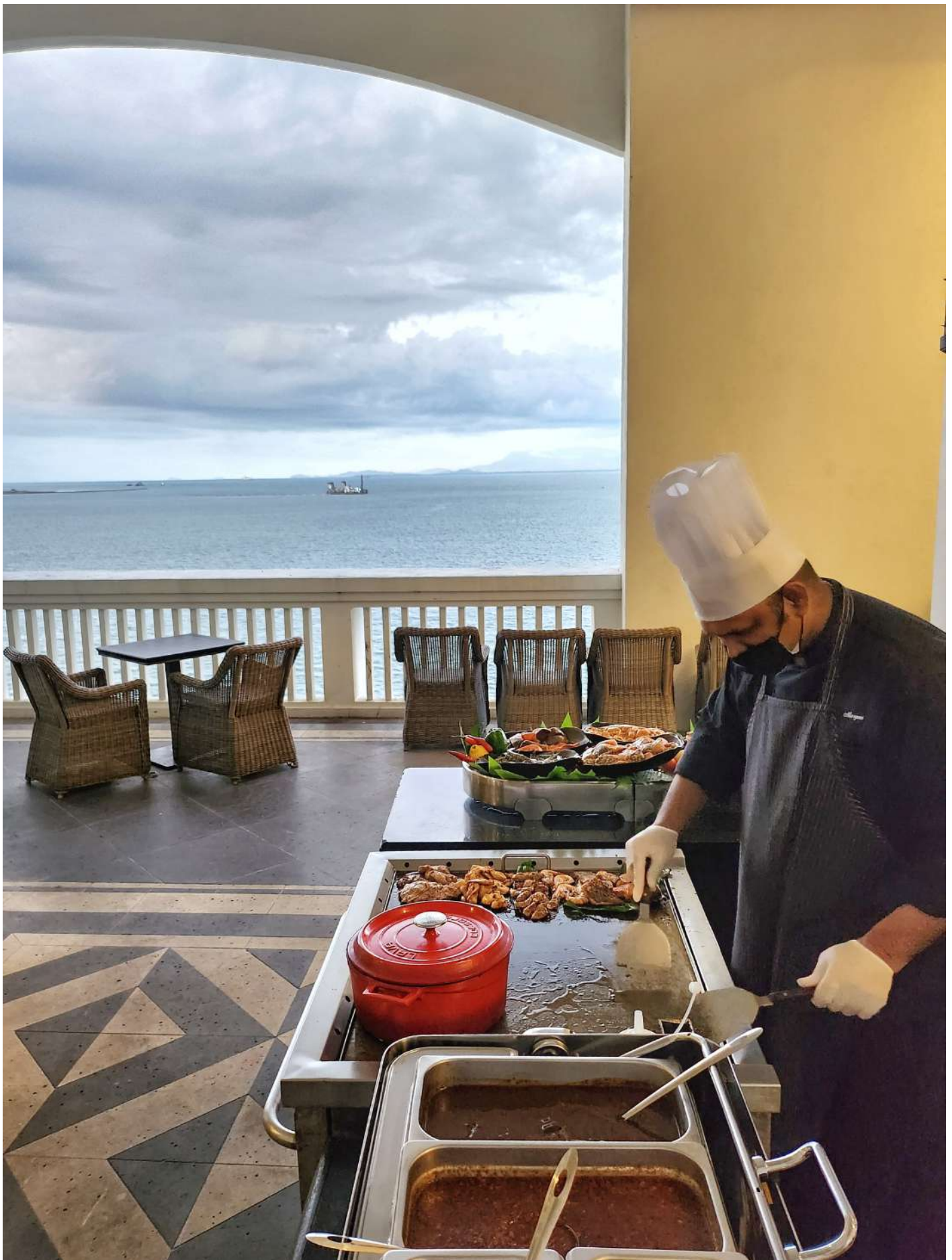
Getting the best table with direct view