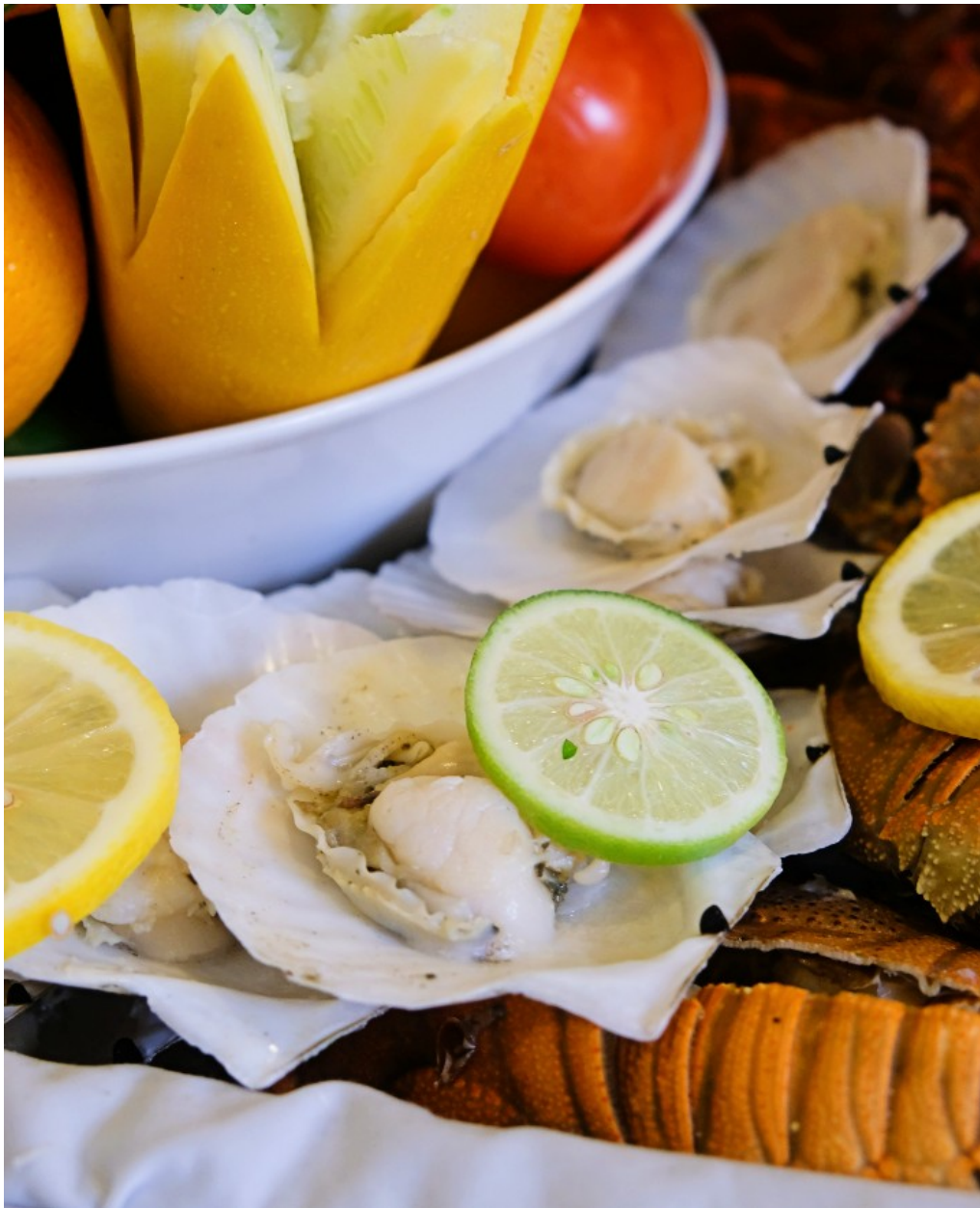
Chilled seafood platter – scallops