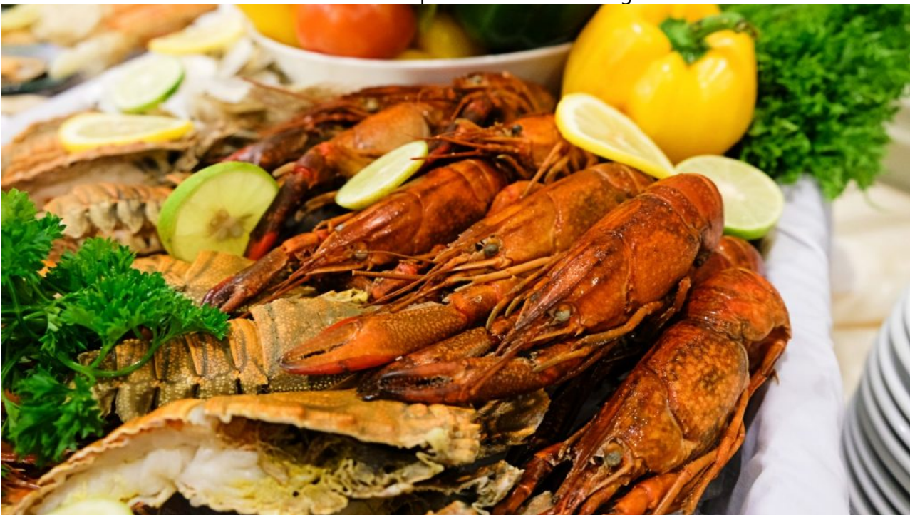
Chilled seafood platter – crayfish