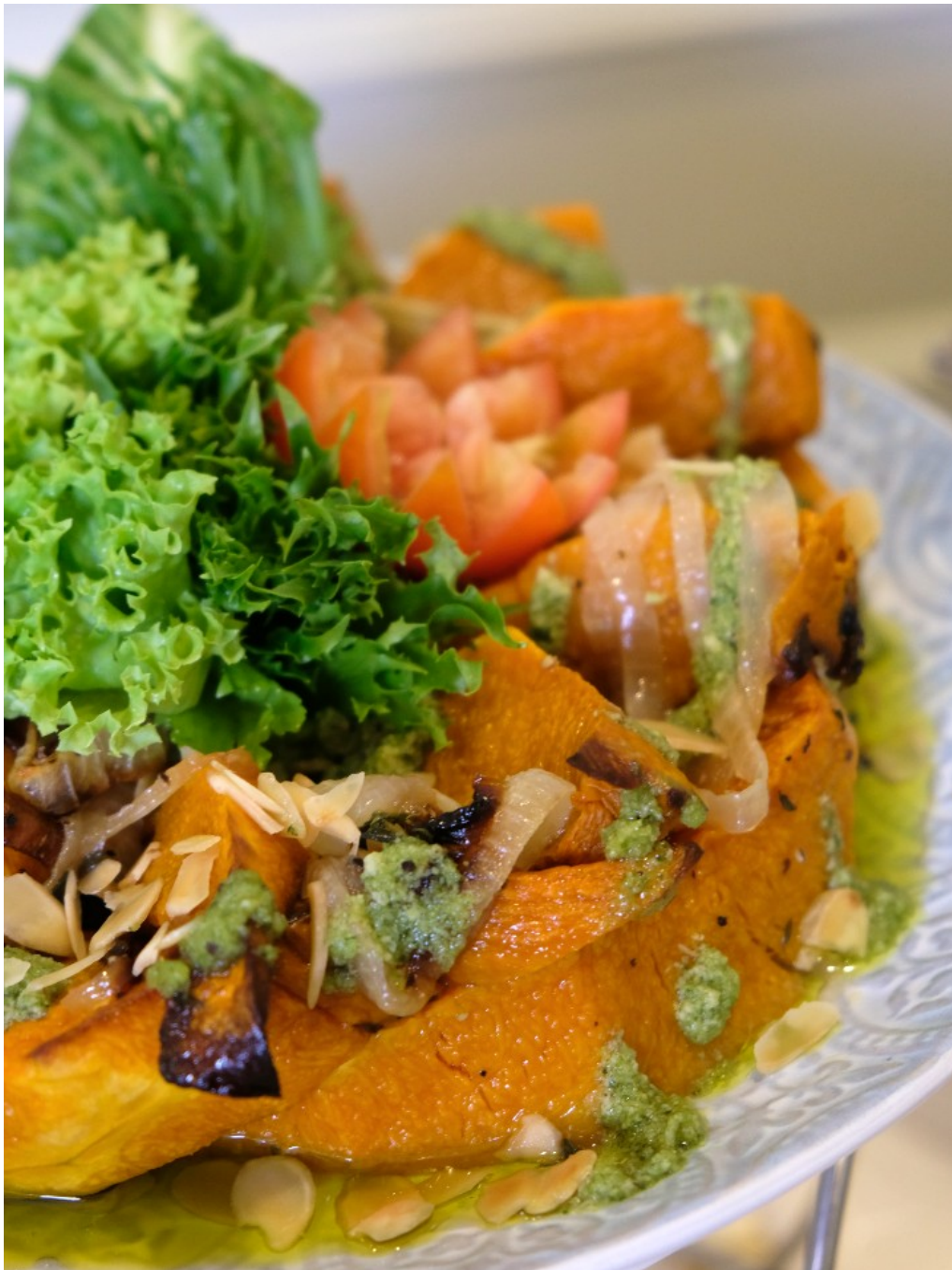
Roasted pumpkin & charred onion with pesto dressing