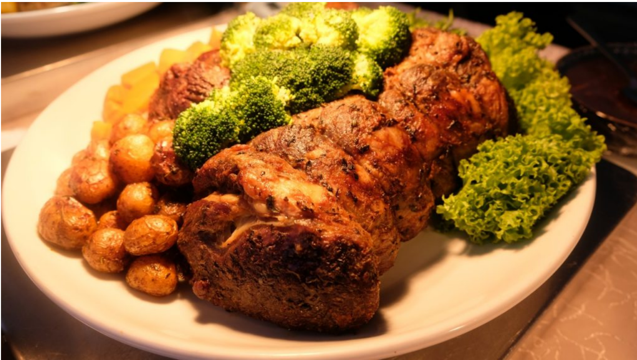
Roasted prime beef