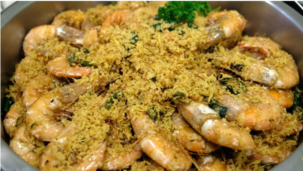
Wok fried prawns with butter and cereal