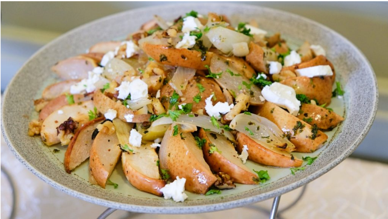
Pear Salad with walnut