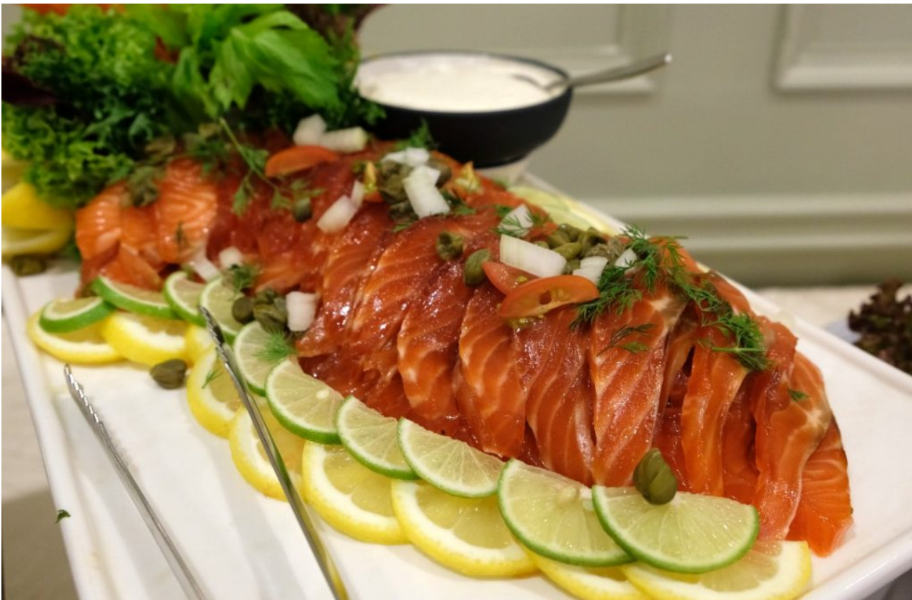
Salmon Gravlax Platter