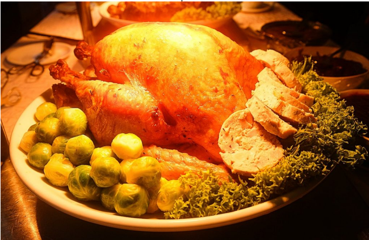
Festive turkey and condiments (which is also available for take-away)