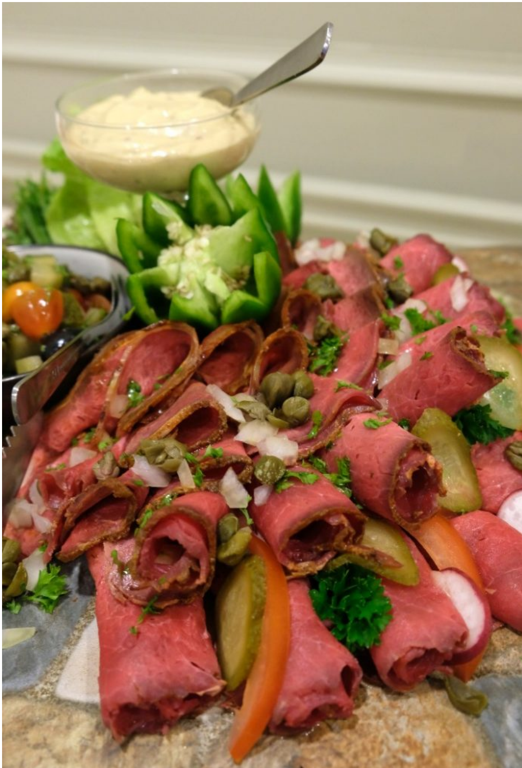
Cold Platter – Beef with vegetable pickles, grain mustard & honey sauce