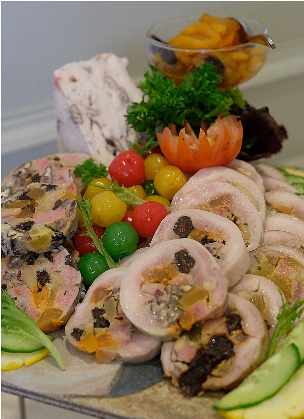
Chicken galantine with apricot chutney