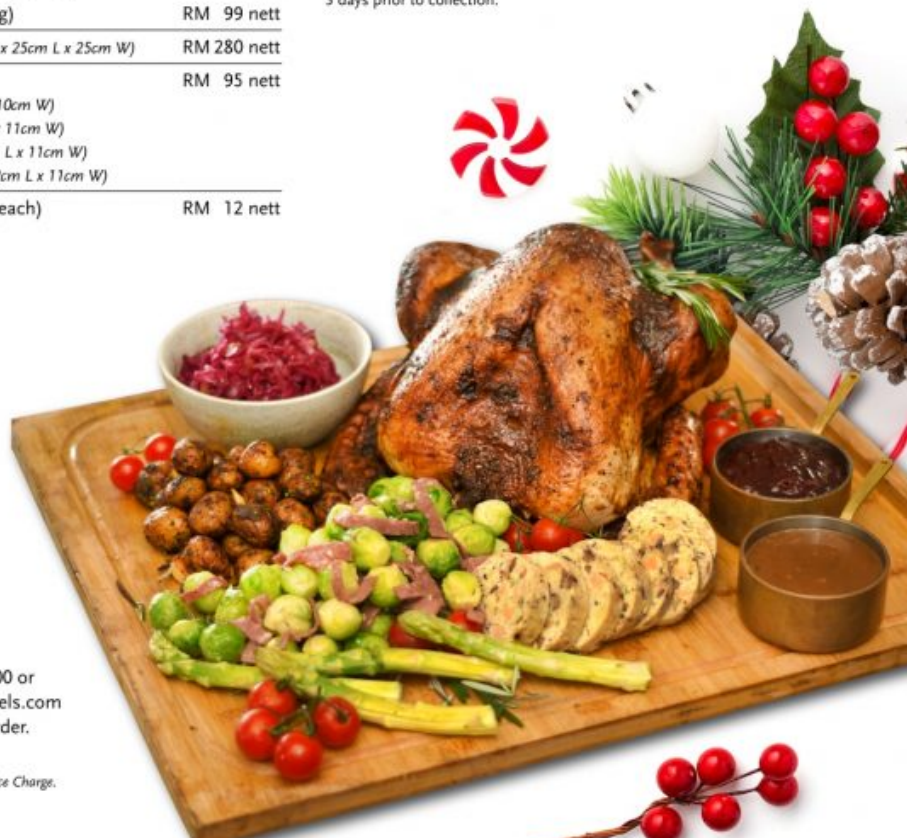
Festive takeaway menu

All nett prices are inclusive of 10% Service Charge.