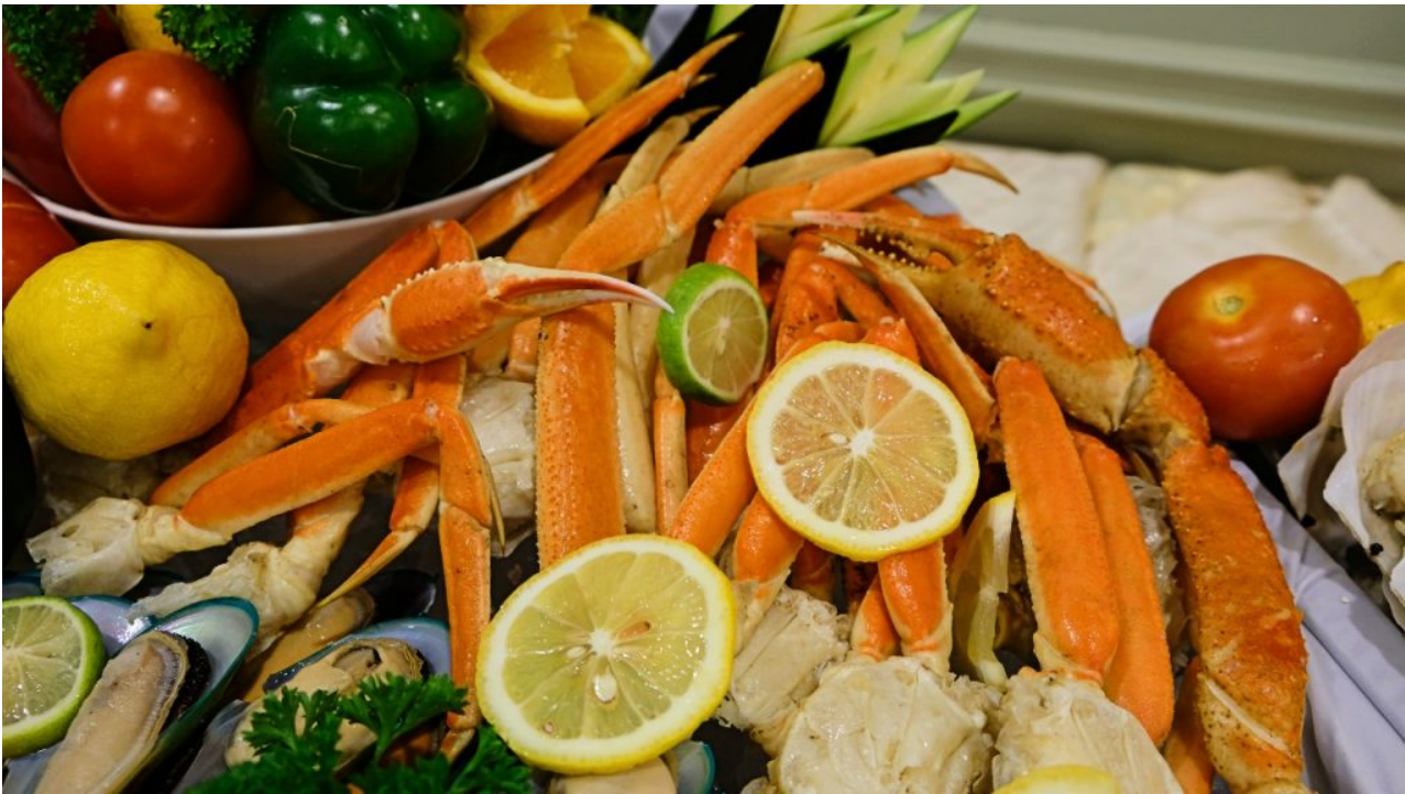
Chilled seafood platter – Snow crab legs