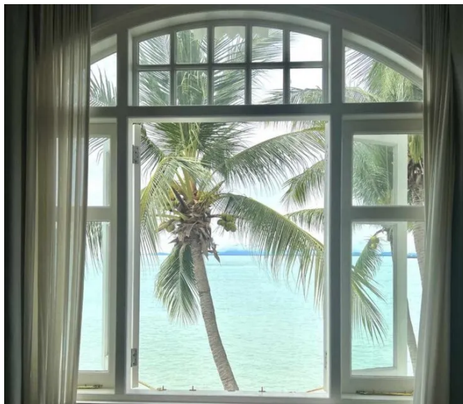
The window of my E&O suite

My suite included the minibar and a bottle of wine and snacks, replenished daily. There is also cocktail and canapé hour daily from 6pm to 7pm.