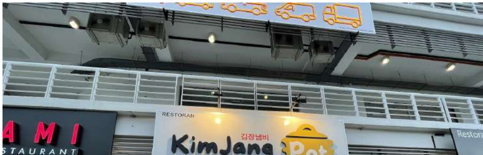
KimJang Pot | 김장냄비 @ Elit Avenue, Bayan Baru, Penang