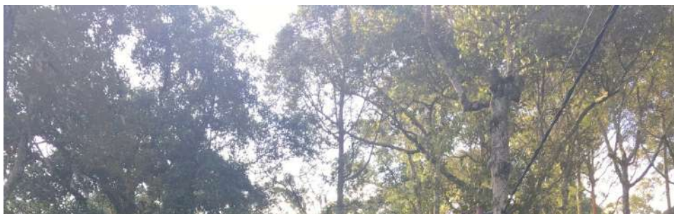
Hiking Huo Guo Shan | 328 Rainbow Stairways @ Bukit Mertajam, Penang