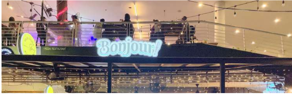
Bonjour @ Karpal Singh Drive, Jelutong, Penang