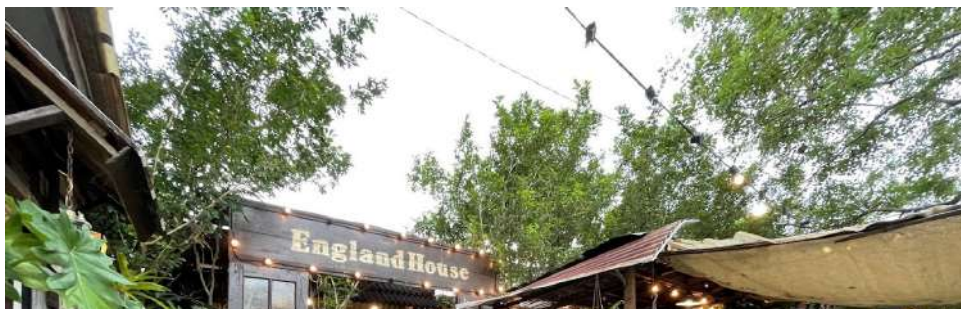
England House | The Coffee Cottage @ Taman Belatuk, Nibong Tebal, Penang

By : Chha Chao Xuan Restaurant | 潮軒 which is located somewhere alone Lebu Melayu is a classic looking restaurant that bring you back to the olden days feel. Chao Xuan Restaurant 's menu is packed with traditional Teo Chew delights and snacks.