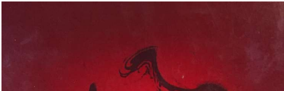
Chao Xuan Restaurant | 潮軒 @ Lebu Melayu, Georgetown, Penang