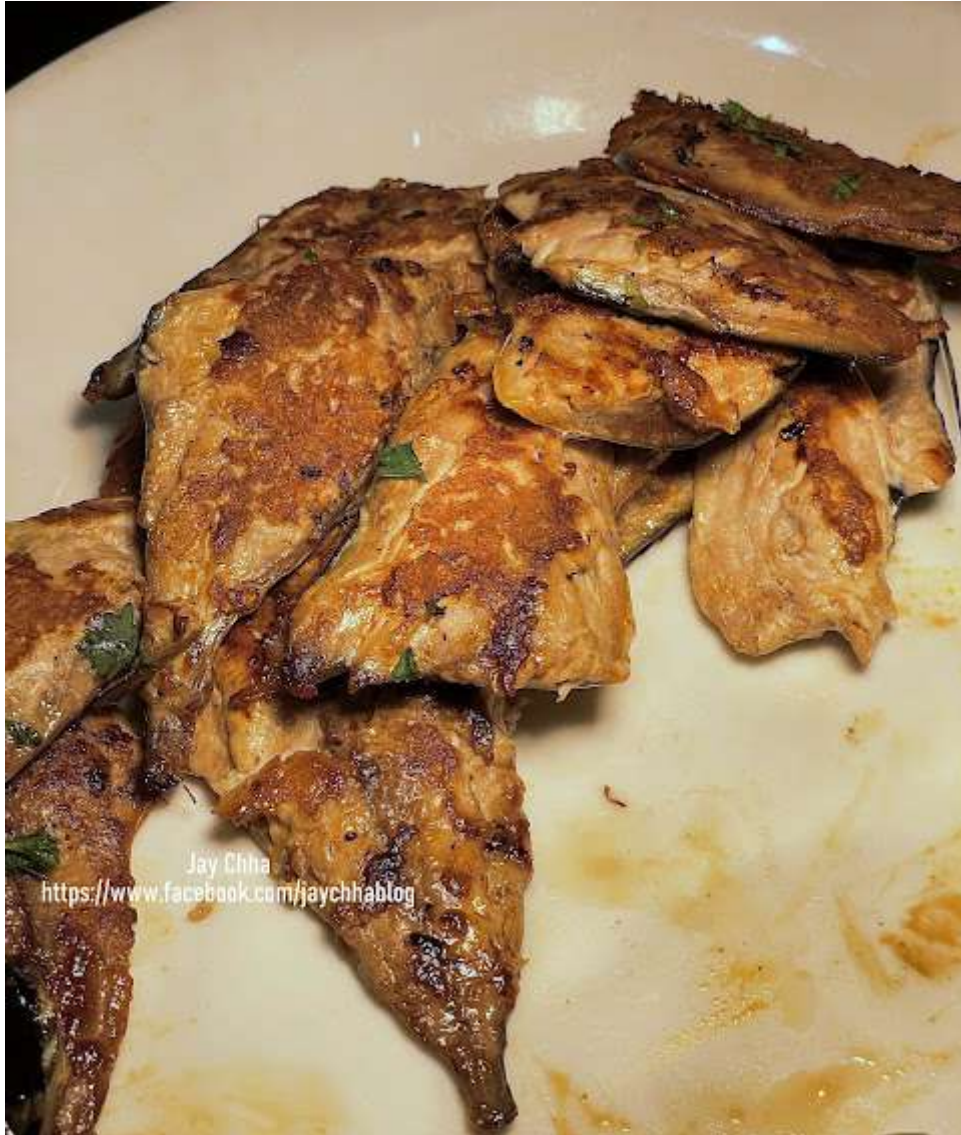
Grilled Saba Fish

Email : imjaychha@gmail.com | Like : Facebook / jaychhablog | Follow : Instagram / jaychha