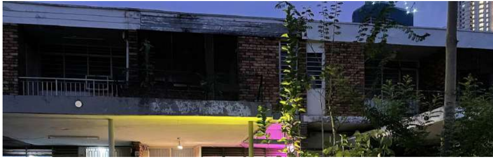
Syarikat @ Medan Lim Cheng Teik, Georgetown, Penang