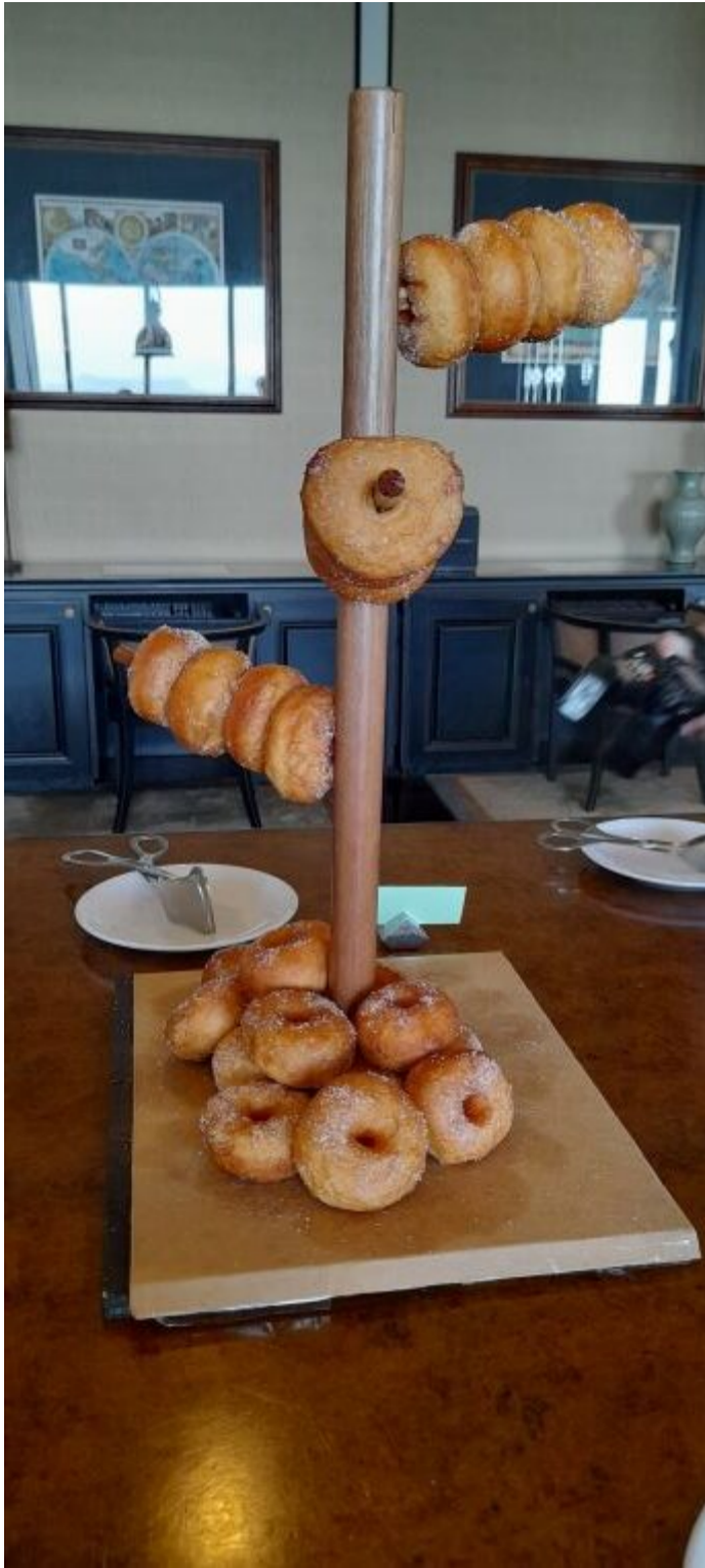
Donuts on offer too