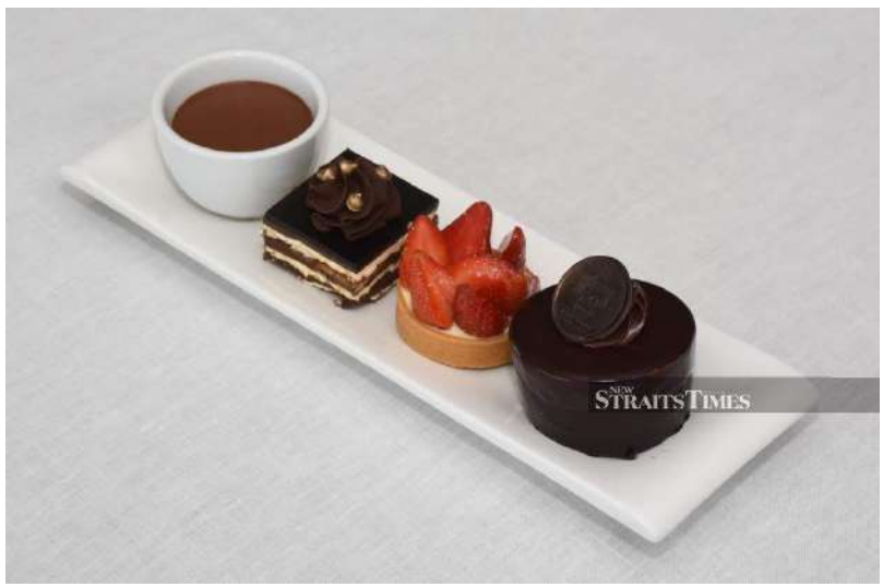
Lunch comes to a fitting end after enjoying the sweet dessert cake selection.

A bath with premium toiletries and a nap embraced by luxuriant linen are in order to rejuvenate and prepare for an evening filled with excitement at various close by places of interest.