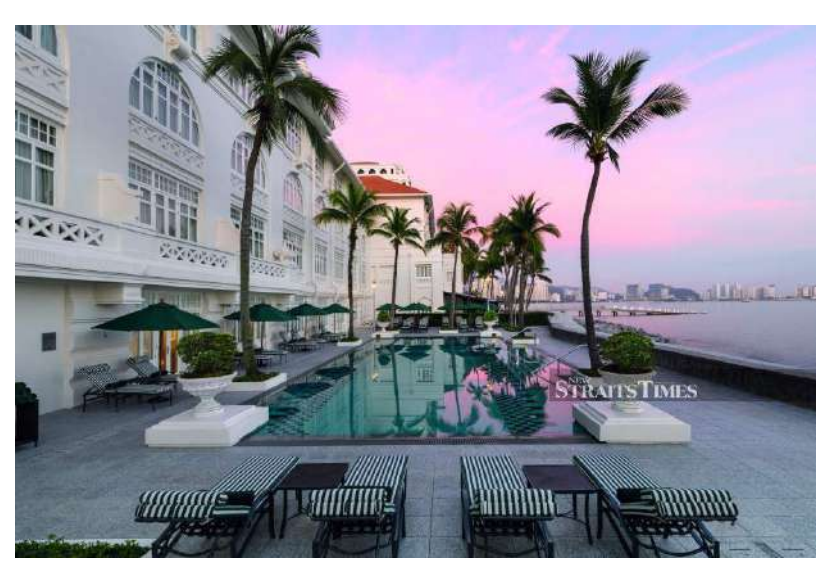
The E&O is the only one among all George Town hotels that boasts of a seafront.

At the same time, stunning views of the azure Andaman Sea nearby bring to mind the fact that the E&O is the only one among all George Town hotels that boasts of a seafront.