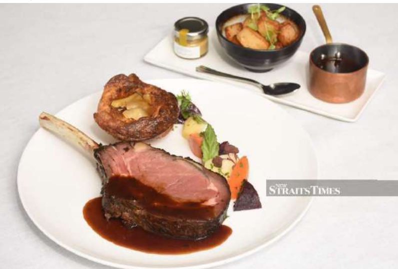
The bone-in beef prime rib comes with Yorkshire pudding, vegetables, roasted potatoes and onion gravy.

Served exclusively at the adjacent Palm Court dining outlet, the tantalising choices bear close resemblance to traditional English tavern food.