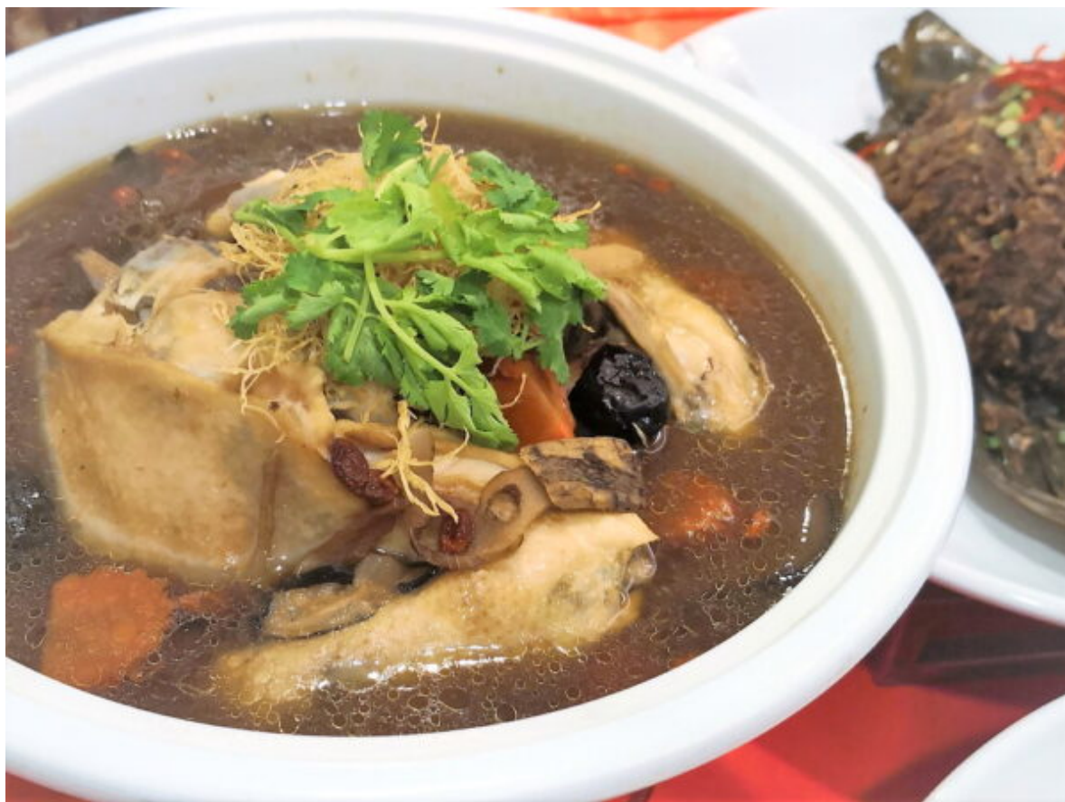
Herbal Chicken with Ginseng & Fried Rice in Lotus Leaf