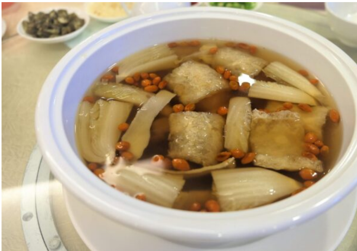
Double Boiled Sea Treasure Herbal Soup