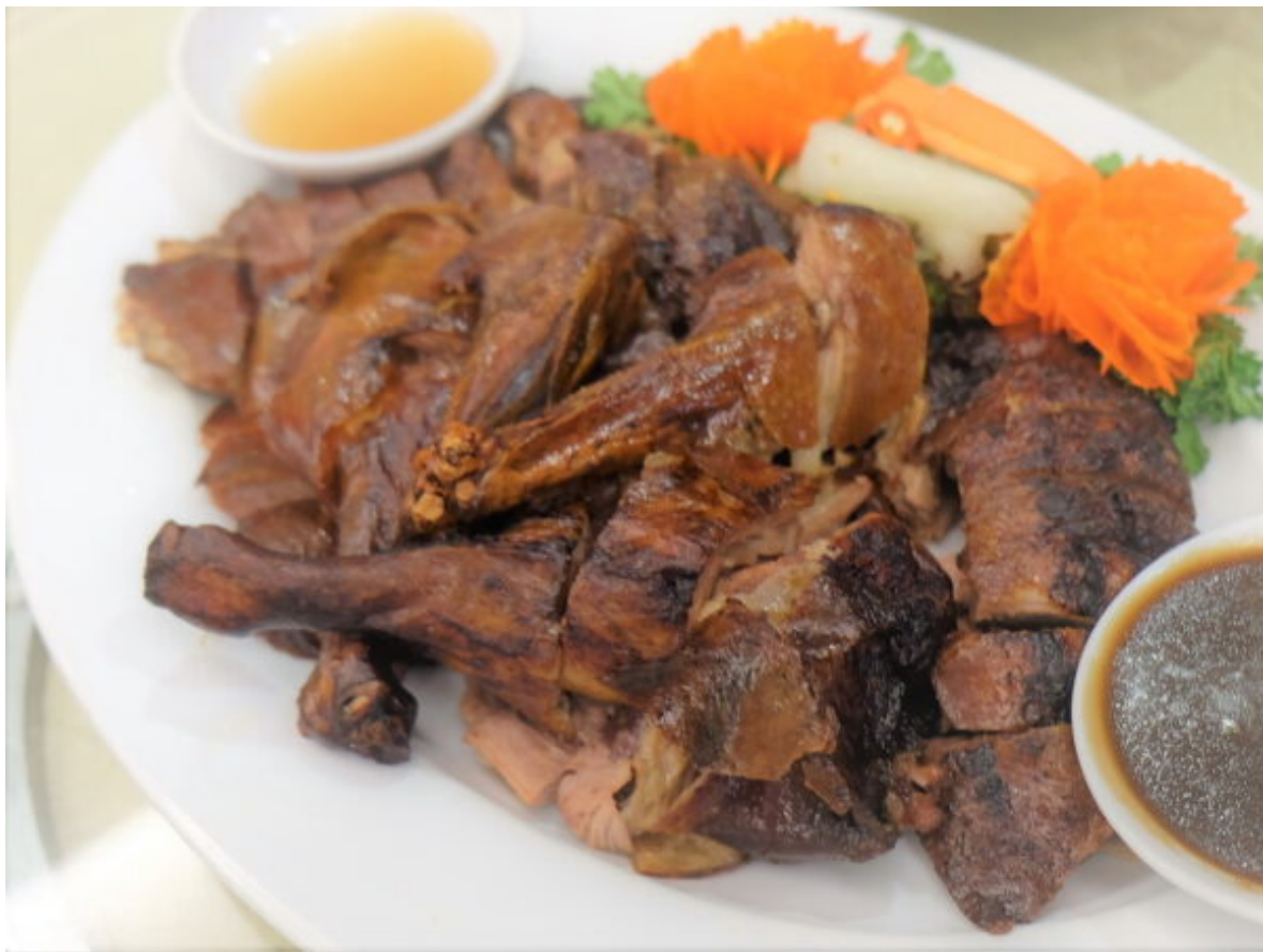
E&O Signature Roasted Duck