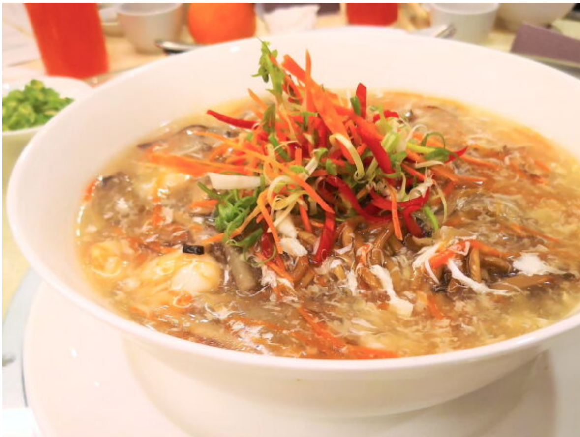
“Hong Kong” Style Ee Fu Noodles

In addition, there is a special festive takeaway menu for you to enjoy at your own pace. The range of savory and sweet delicacies is available at the Victory Annexe Lobby from 15th January to 15th February 2022 (11am to 10pm).