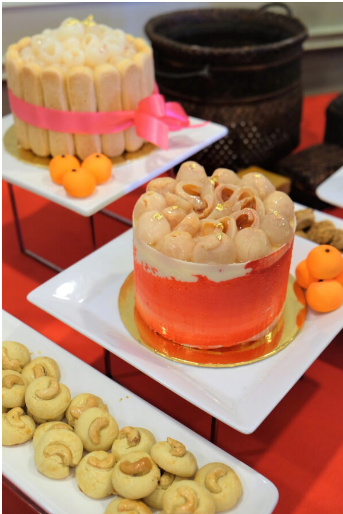
Lovely array of cookies and cakes