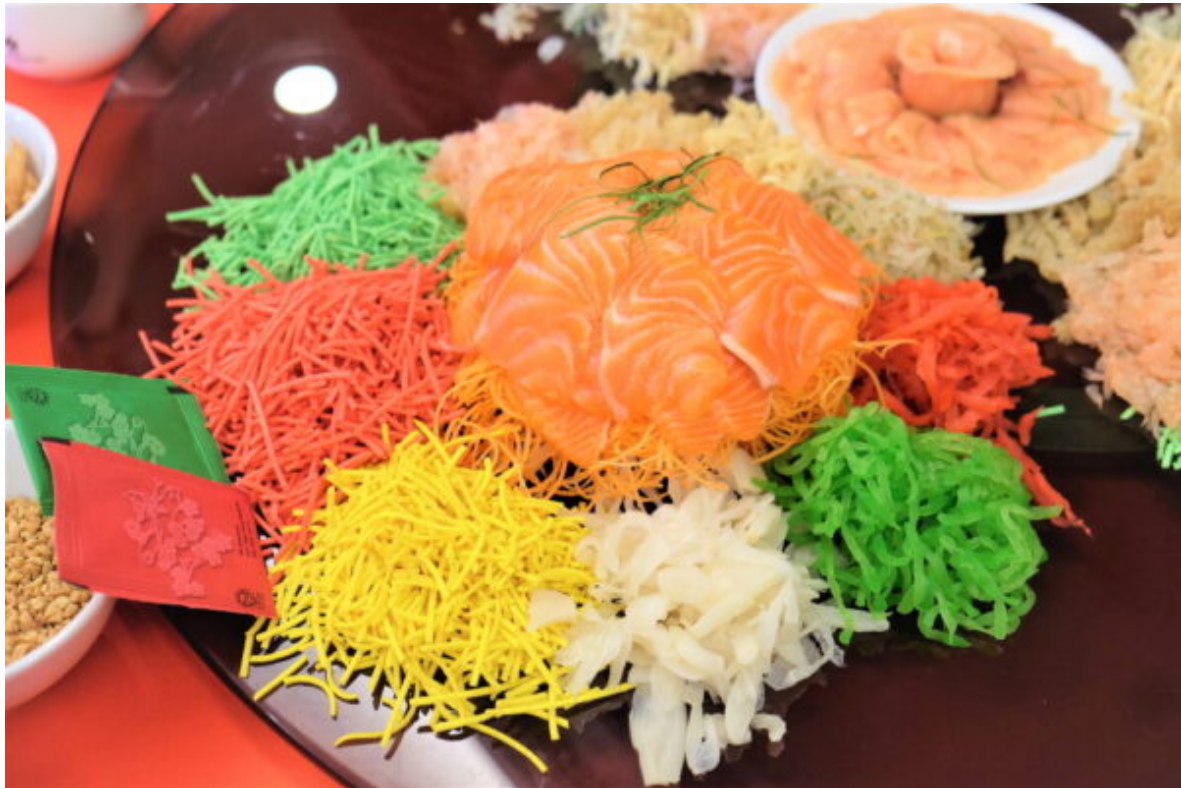
Prosperity Yee Sang

For dessert, there is the Cendol Cake. Topped with sweet red beans, the cake is swirled with brown sugar syrup and coconut cream. This is definitely a break away from the typical traditional dessert that you will get at the Chinese banquet menu.