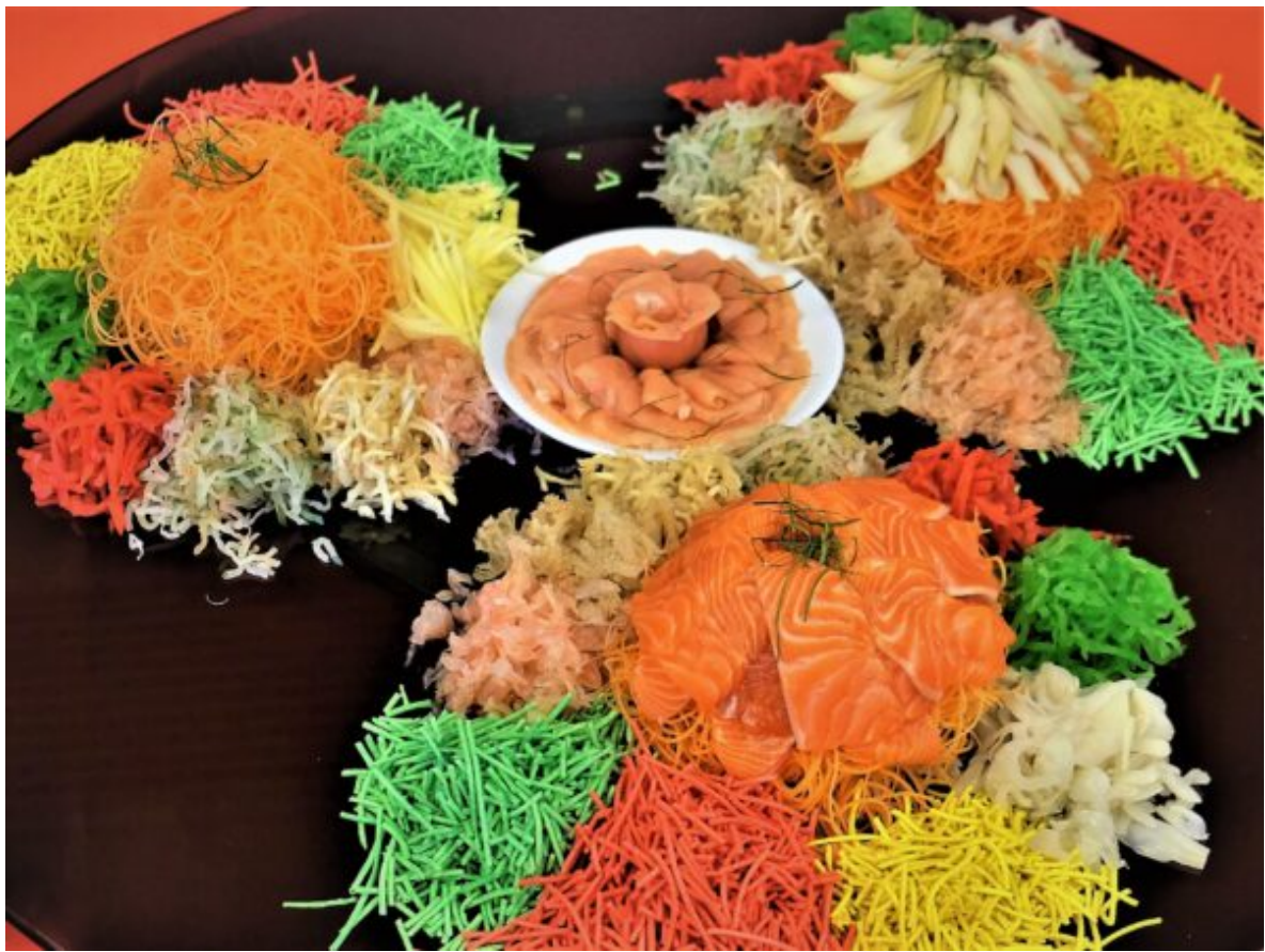
Variations of Yee Sang