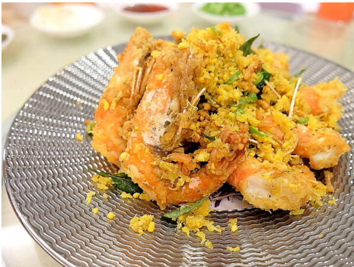
Golden Fried King Prawns