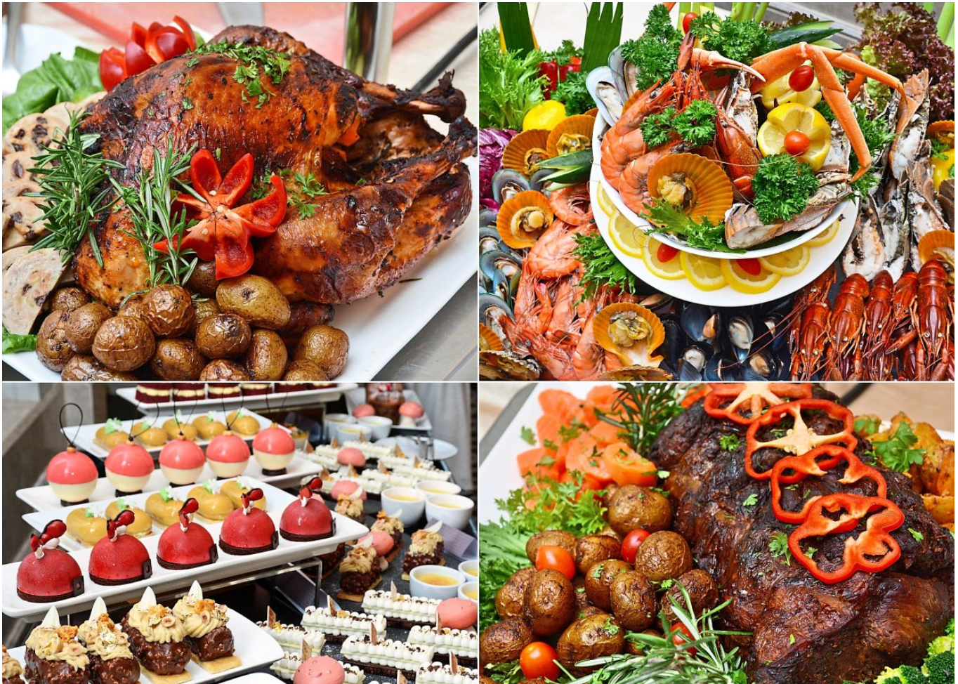
Sarkies' festive buffets will have crowd favourites like (clockwise from top left) Roasted Turkey, seafood on ice, Oven Baked Beef Striploin and an irresistible array of holiday sweets.

BUFFETS are back at the Eastern and Oriental (E&O) Hotel in Penang – just in time for Christmas and the New Year!