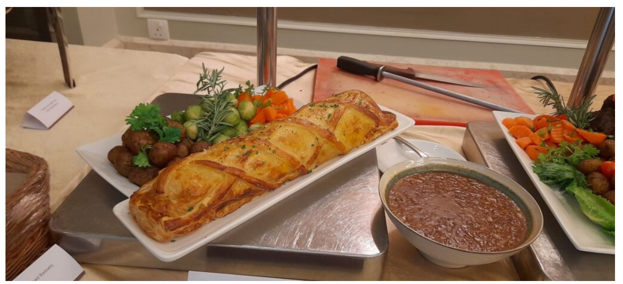
Java Tree Beef Wellington

Seasonal favourites from the iconic Eastern & Oriental Hotel range from the Java Tree Beef Wellington, Roast Turkey, Oven Roasted Lamb Leg and the works which are on the dine-in and takeaway spread for this Christmas.