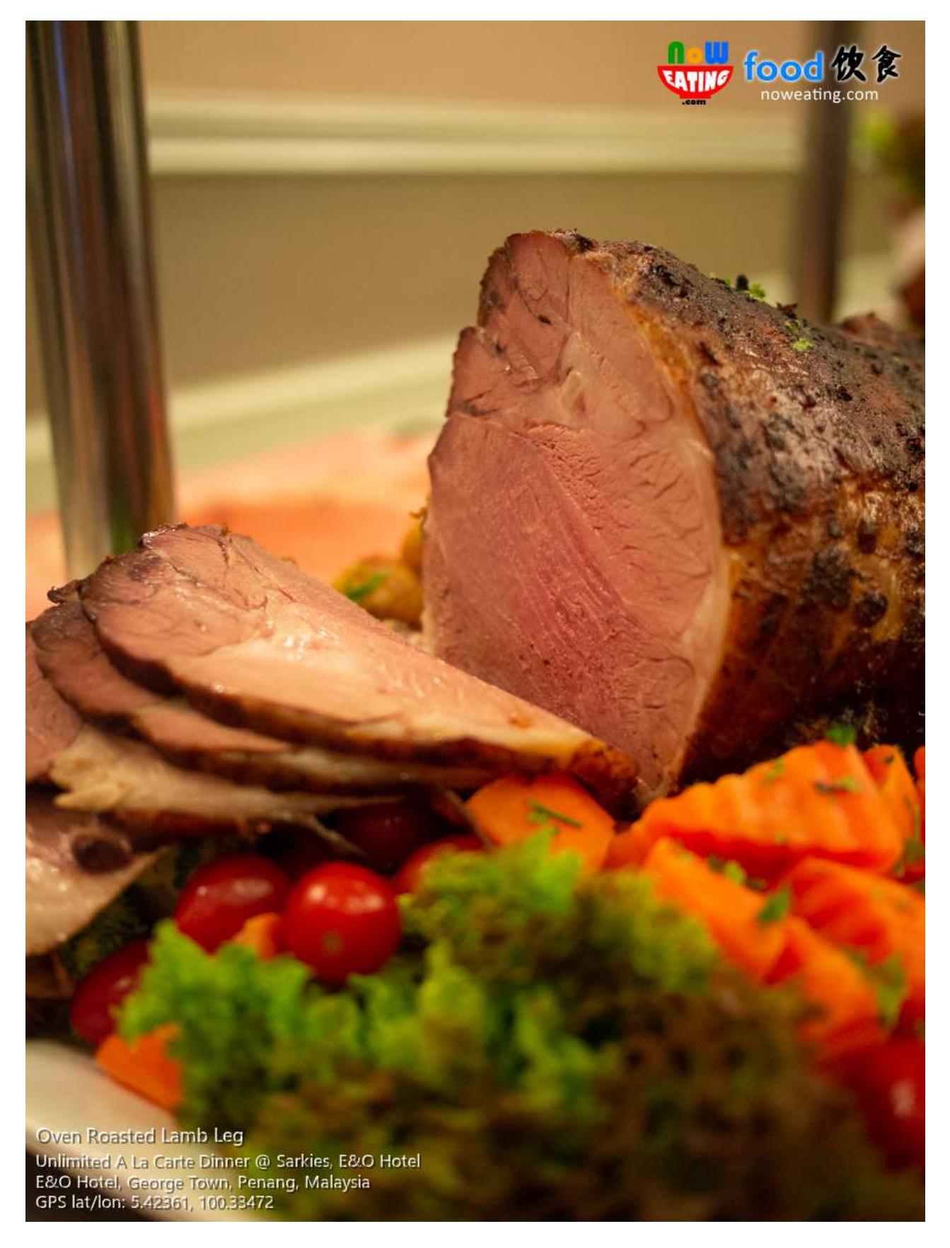
All in all, the Unlimited A La Carte Dinner met our expectation, if not exceeding.