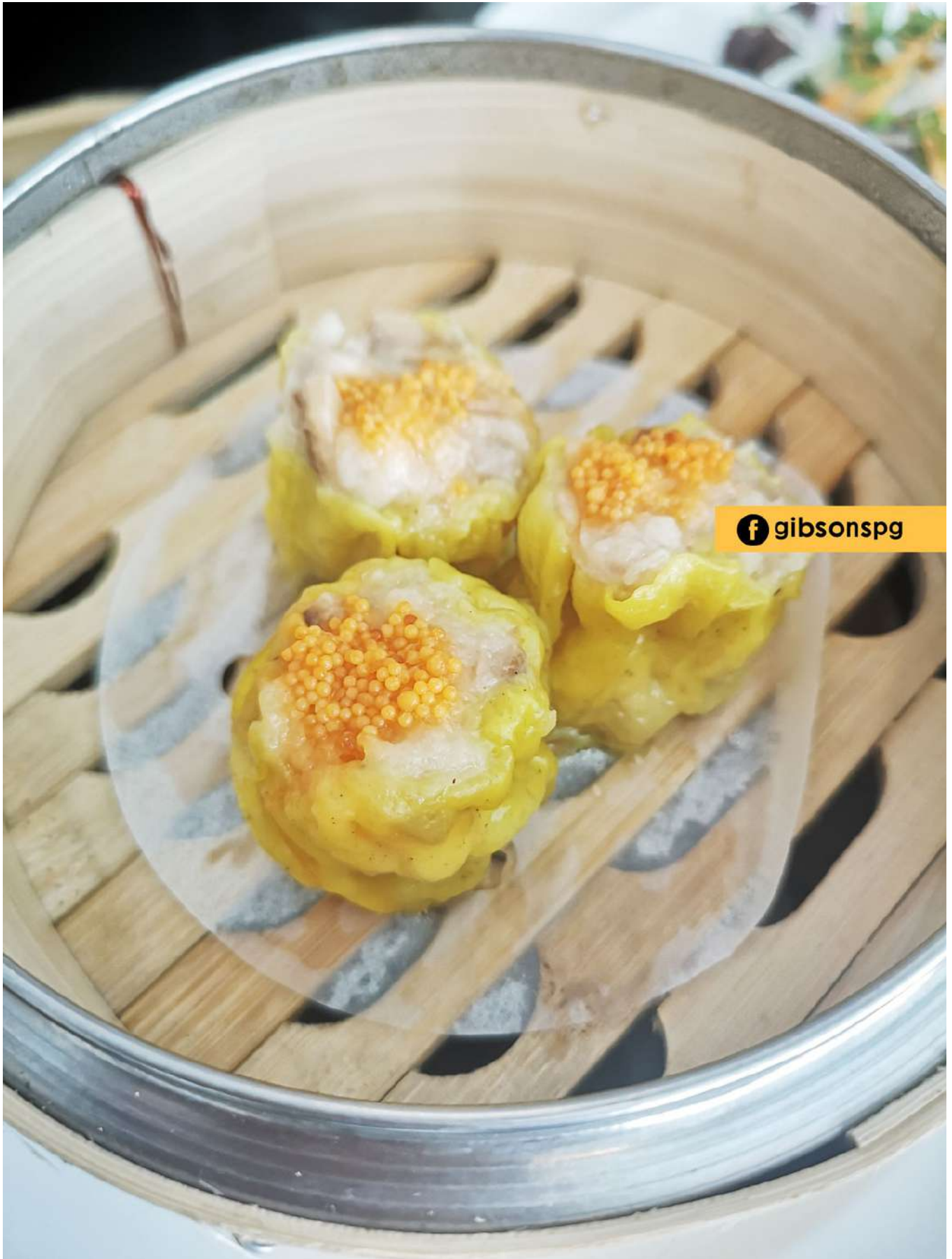
Steam Rice Roll With Chicken Mushroom