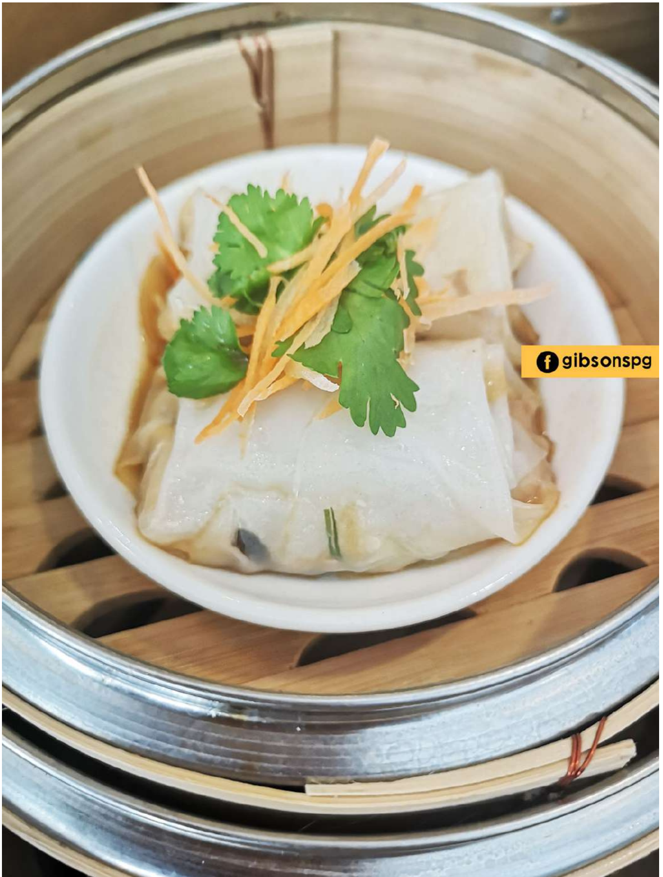
Steam Bun With Bbq Chicken