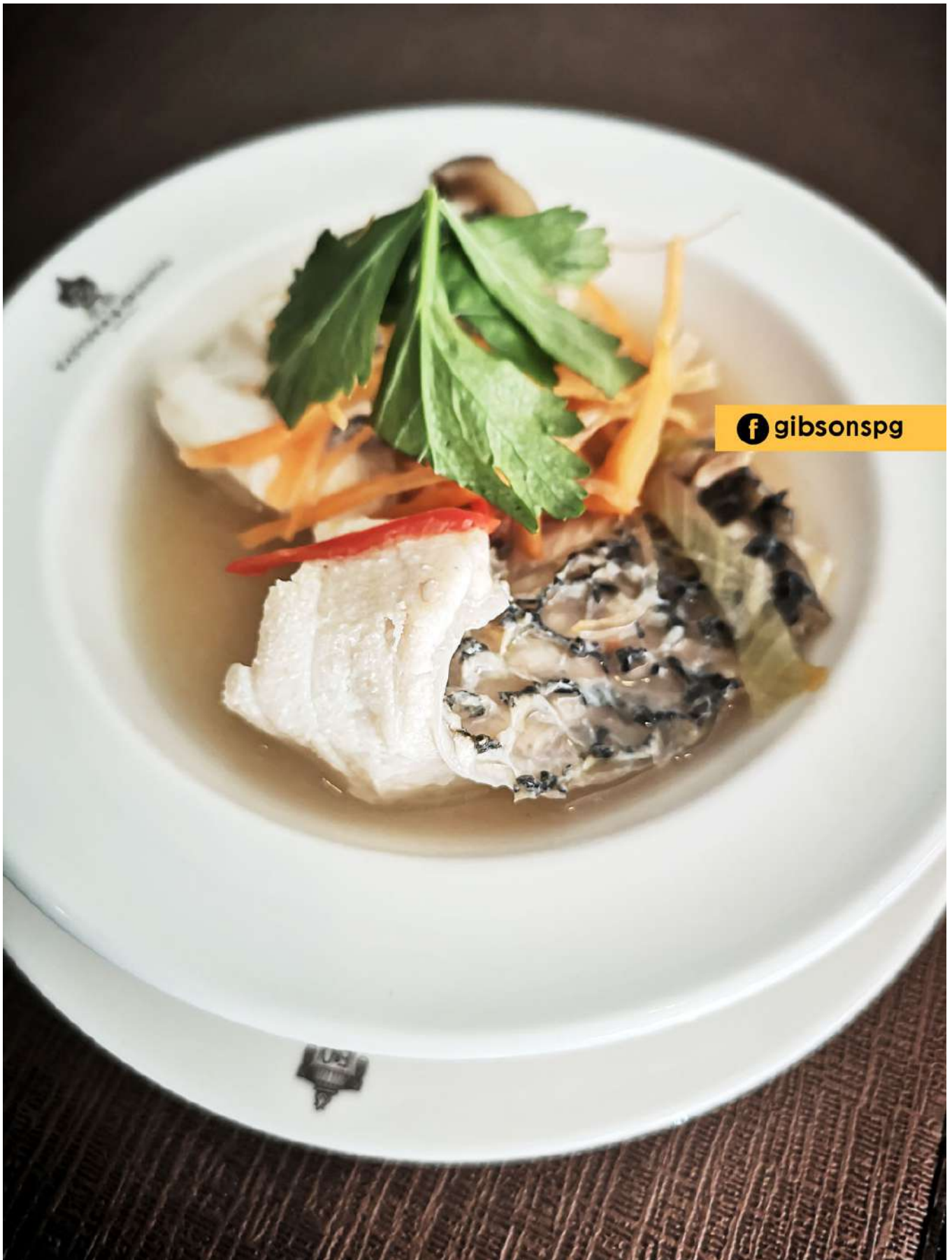
Steam Prawn Dumpling With Coriander