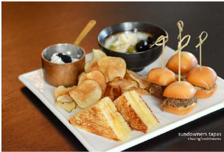
Four tapas is served and the list consist of Peranakan Slides, Potato & Caviar, Olive & Cheese and Gruyere Cheese Sandwich .