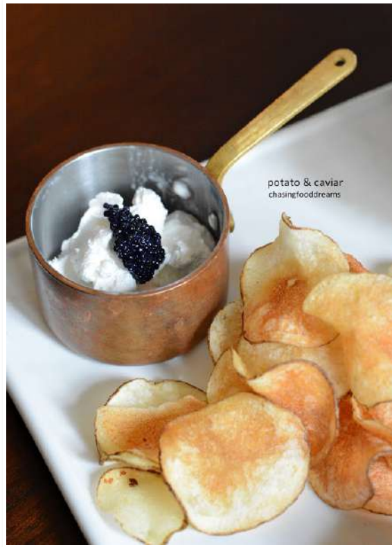
Talk about elevating Potato & Caviar ... these golden crisps are paired with sour cream and glorious tiny pearls of caviar.