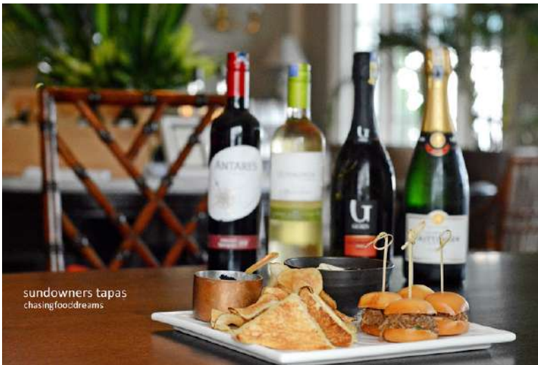
sundowners tapas chasingfooddreams

Available daily from 4pm to 7pm, make your way to Palm Court which is located on the lobby level of the Heritage Wing of E&O Hotel for this promotion. Choose from a selection of red or white wines, Prosecco or Taittinger Brut Reserve champagne to go with the tapas to unwind for the day.