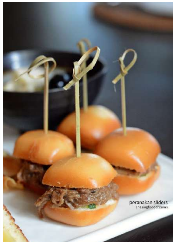
The Peranakan Slides had us at Hello! Delectable braised duck meat sandwiched with crispy mantau buns, each bite a flavourful temptation at its best.