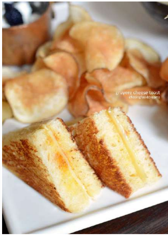
Dainty toasties of Gruyere Cheese Sandwich prove classic goes a long way as always!