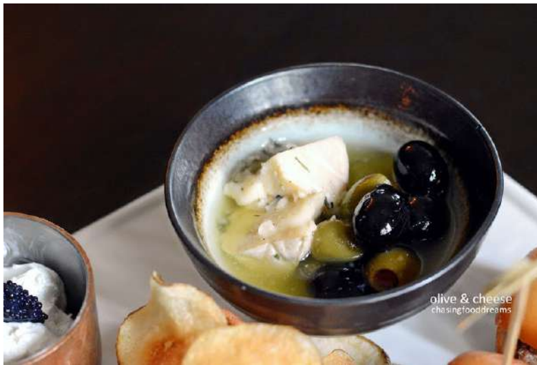
Salty and umami notes from Olives & Cheese are quite perfect with your choice of wines, Prosecco or Champagne any time...