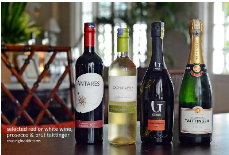
selected red or white wine, prosecco & brut taittinger chasingfooddreams

Available daily from 4pm to 7pm, make your way to Palm Court which is located on the lobby level of the Heritage Wing of E&O Hotel for this promotion. Choose from a selection of red or white wines, Prosecco or Taittinger Brut Reserve champagne to go with the tapas to unwind for the day.