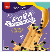
Wall's Special Edition Tealive Boba...