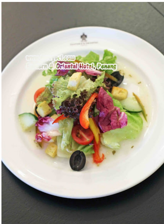
Cheese Platter that is beautifully plated.