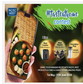
Taste At Home #TasteAtHome