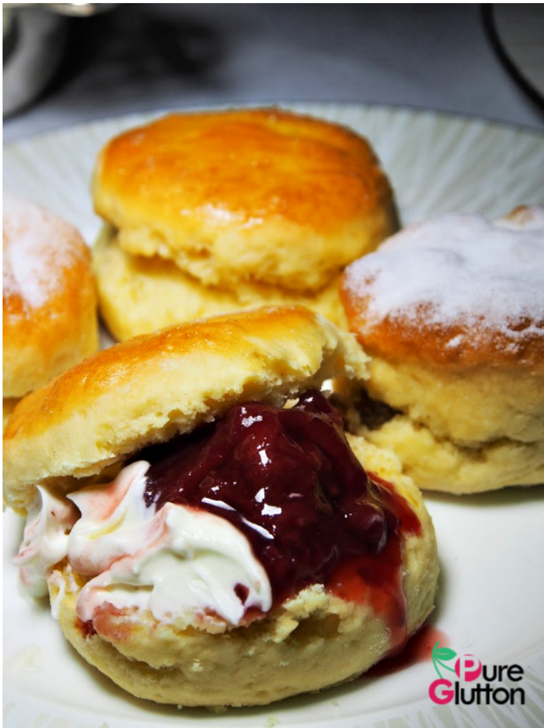
Freshly baked scones with cream & strawberry jam!

With the opening of Palm Court, guests can drop by for a whole new level of culinary experience featuring both classic and heritage flavours, for which the E&O is famed for. And the GOOD NEWS now is that Palm Court has re-opened recently during this MCO period for dine-in and takeaway from 12.00noon till 10.00pm daily.