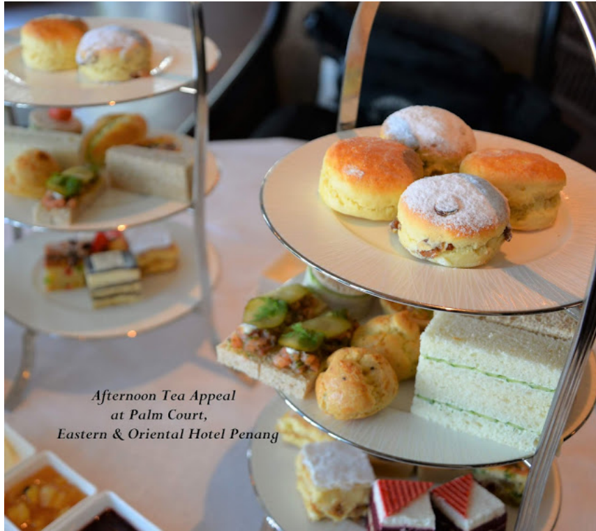
Afternoon Tea Appeal at Palm Court, Eastern & Oriental Hotel Penang