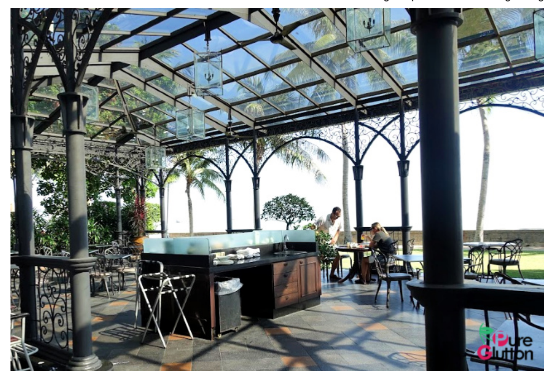
Al fresco dining facing the sea

We also enjoyed superb dining at Java Tree , Palm Court and some lovely cocktails at Farquhar's Bar – more on this later.