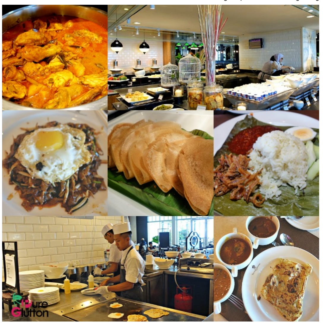
Some of the delightful offerings at Sarkies' Buffet Breakfast!