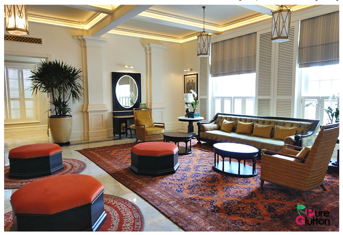
Elegant seating at the main foyer