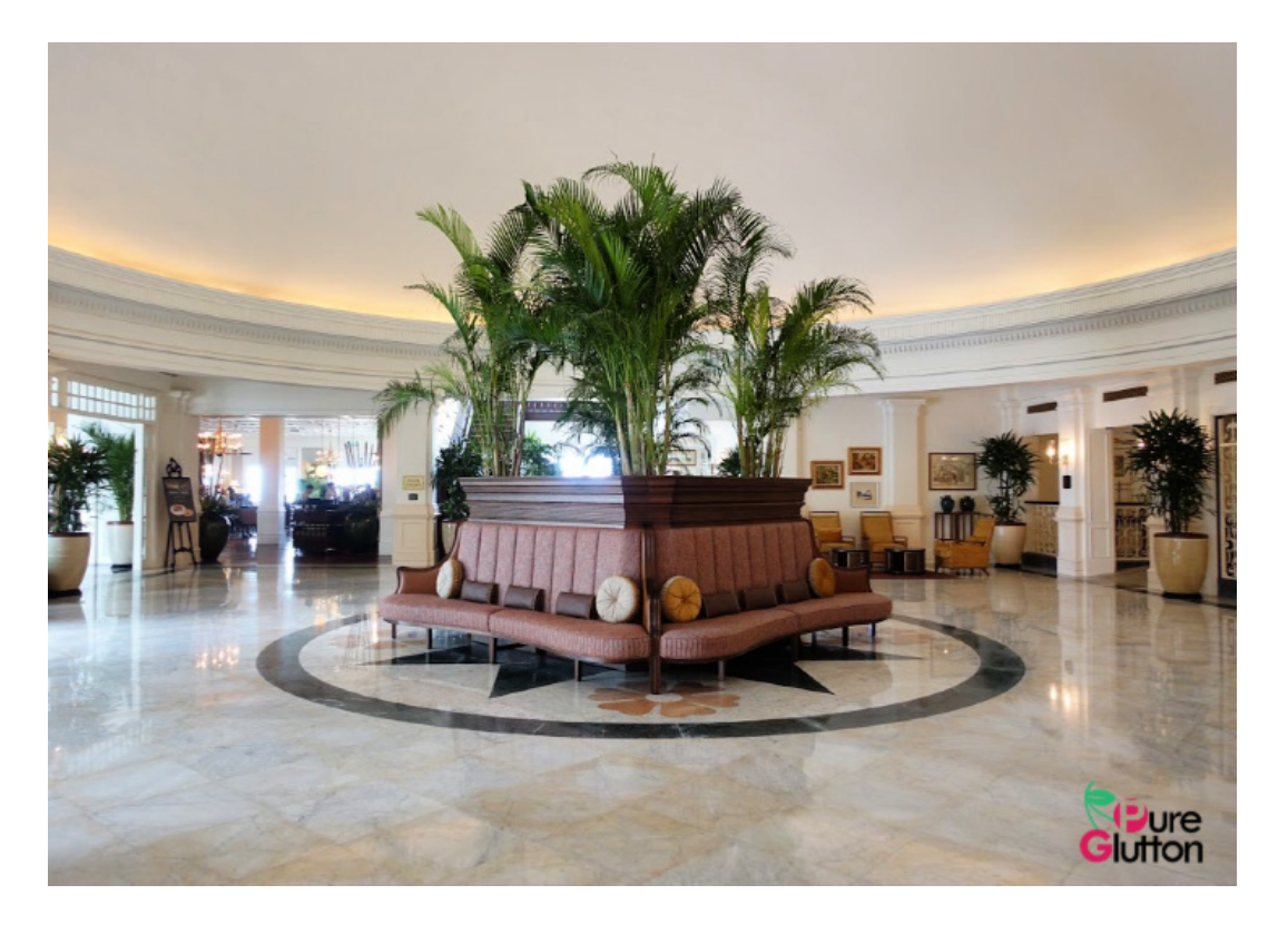
Main foyer at The Heritage Wing

In 2013, we checked out the gorgeous Victory Annexe of the E&O when it was opened after a massive renovation. Then 6 years later, in late December 2019, the E&O re-opened its Heritage Wing after an extensive refurbishment exercise that started in March 2019. So, recently we drove up north to experience the all-suite refurbished Heritage Wing.