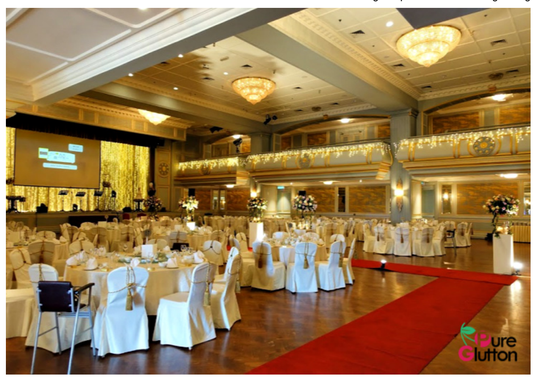
The Grand Ballroom

Located conveniently near food eateries, shopping and the entertainment belts of downtown Georgetown, financial district of Beach Street and surrounding cultural quarters, The E&O Hotel is positioned as an exclusive 100 all-suite Grand Hotel, with strong historical links and traditions that none can rival. This Grande Dame is the ultimate abode of timeless beauty and splendour.