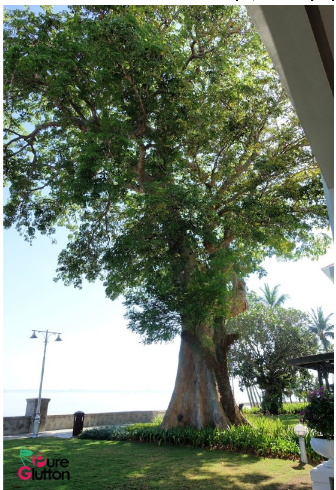
The grand old Java Tree

Throughout our stay at the E&O, we enjoyed exclusive privileges such as access to The Cornwallis – a private lounge offering breakfast and complimentary evening canapes and cocktails. Guests can order hot breakfast dishes from a menu besides helping themselves to a buffet spread of other regular breakfast items.