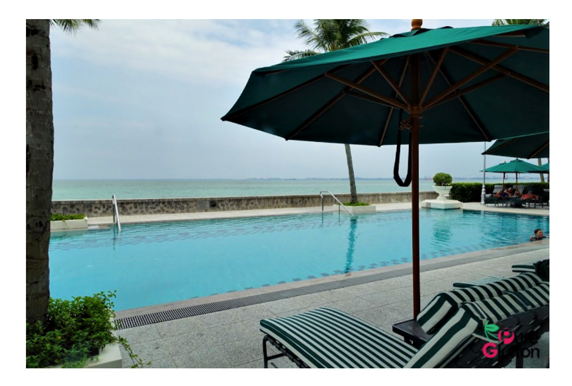
Take a dip in the swimming pool!

Renowned for its timeless hospitality, the Heritage Wing now provides a more personalised experience with pre-arrival services, in-suite check-in and round-the-clock butler service.