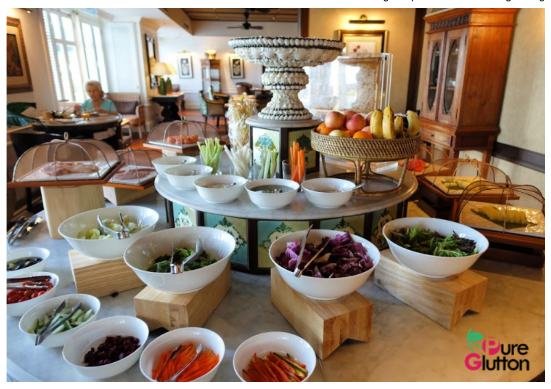
Breakfast at The Cornwallis