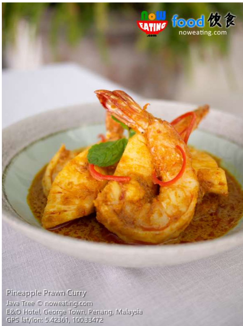
Pineapple Prawn Curry Java Tree E&O Hotel, George Town, Penang, Malaysia GPS lat/lon: 5.42361, 100.33472