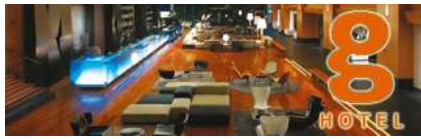
Tree Bar 2016 New Conference Room Gravity Rooftop Bar