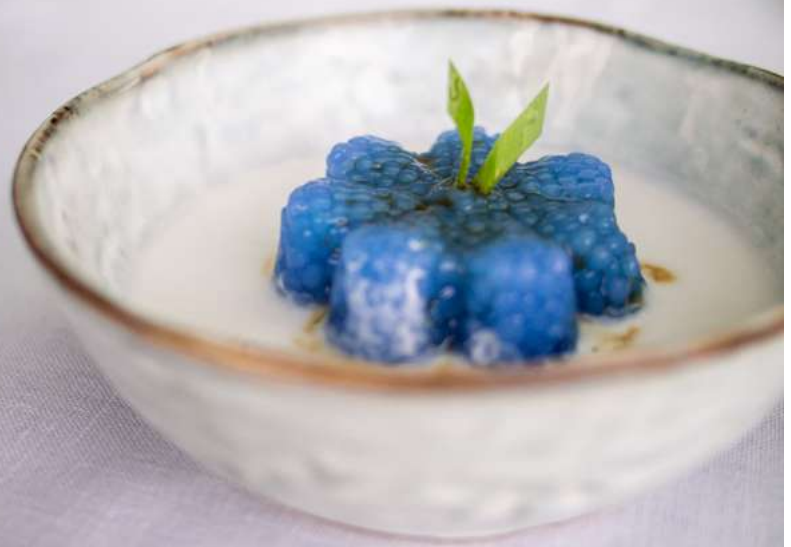
Sago Gula Melaka Java Tree E&O Hotel, George Town, Penang, Malaysia GPS lat/lon: 5.42361, 100.33472

For the dessert, enjoy Sago Gula Melaka (RM28) made of Sago Pearls in Coconut Milk and Palm Sugar Syrup.