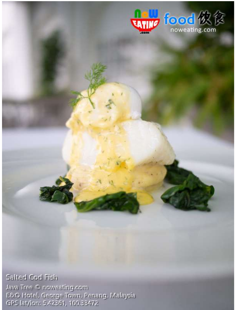
Salted Cod Fish