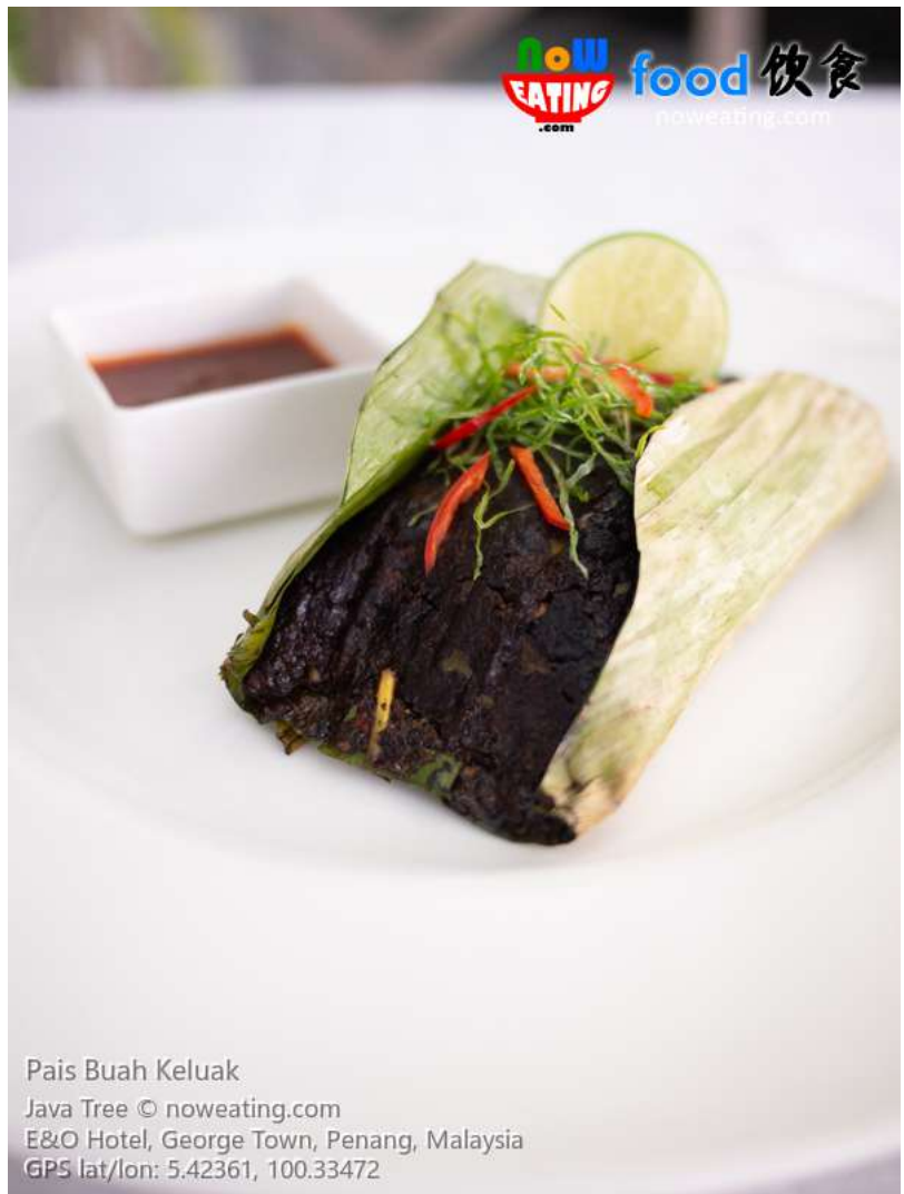
Pais Buah Keluak Java Tree E&O Hotel, George Town, Penang, Malaysia GPS lat/lon: 5.42361, 100.33472

Pais Buah Keluak (RM65) – Grilled Snapper, Asian Truffle, Nyonya Spices