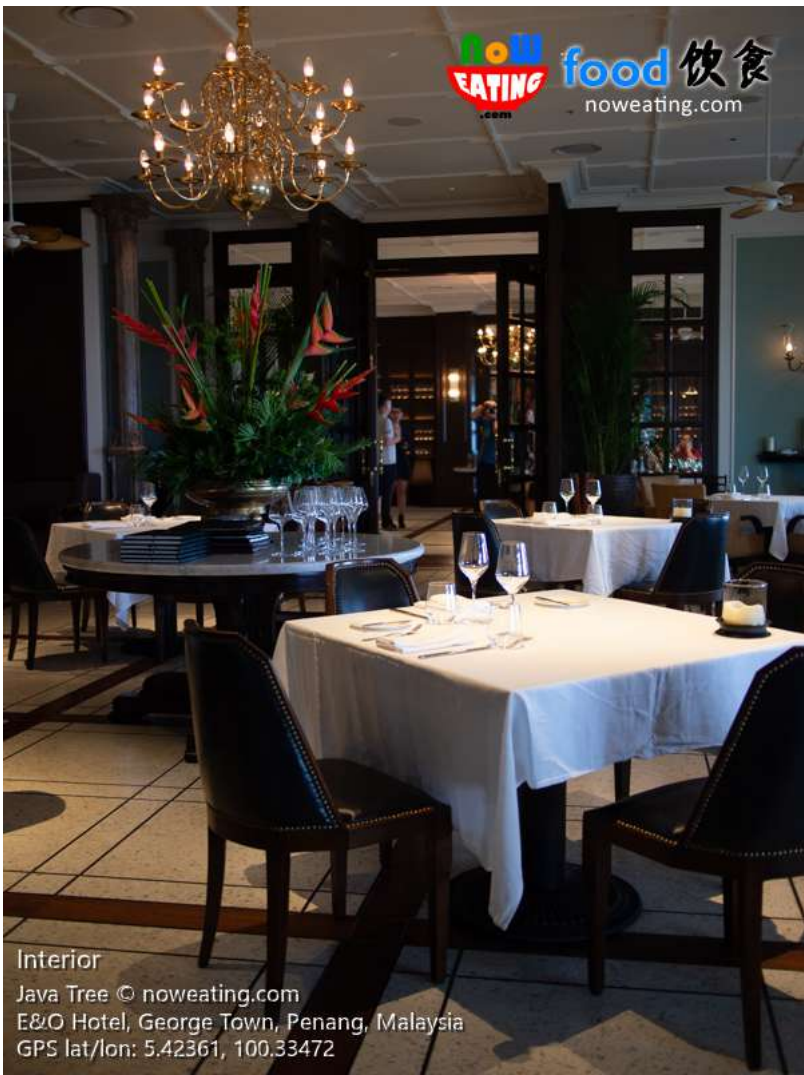
Interior Java Tree E&O Hotel, George Town, Penang, Malaysia GPS lat/lon: 5.42361, 100.33472

Three new dining outlets, namely Java Tree , Palm Court and Farquhar's Bar are introduced in conjunction with the reopening of the hotel's refreshed Heritage Wing last December. With the introduction of these new outlets, guests can expect a new whole level of culinary experience as the E&O celebrates both classic and heritage flavours. While Palm Court is offering a la carte menu featuring assorted Indian and Malay inspired dishes, Chinese noodles and casual international favourites, Java Tree, on another hand, will be serving an assortment of Straits Nyonya recipes and classic European dishes.