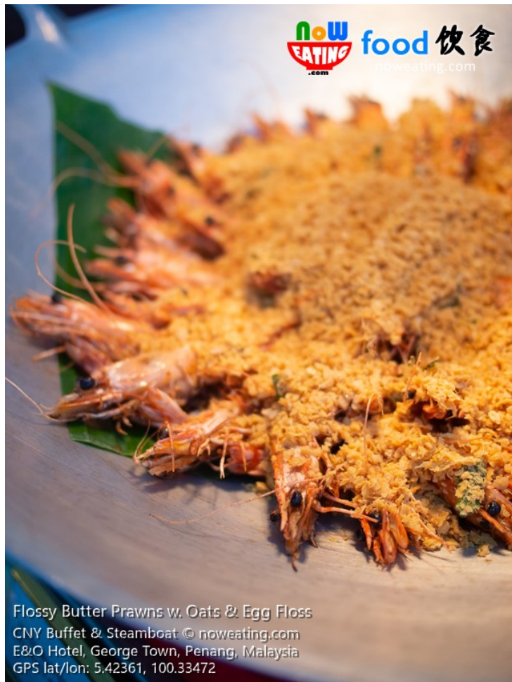
Butter Prawns with Oats and Egg Floss