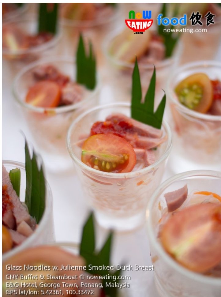
Glass Noodles w. Julienne Smoked Duck Breast CNY Buffet & Steamboat E&O Hotel, George Town, Penang, Malaysia GPS lat/lon: 5.42361, 100.33472

First, let's focus on CNY buffet dinner. Some highlights you will find are: