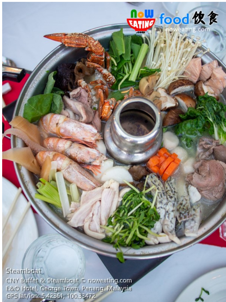
Steamboat CNY Buffet & Steamboat E&O Hotel, George Town, Penang, Malaysia GPS lat/lon: 5.42361, 100.33472