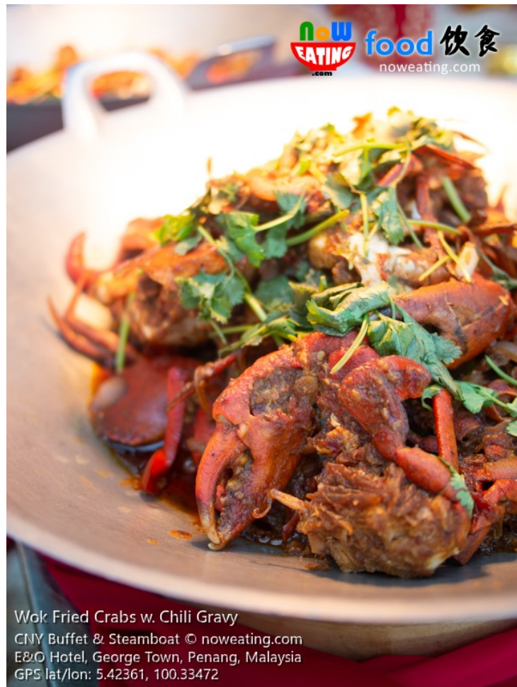
Wok Fried Crabs w. Chili Gravy CNY Buffet & Steamboat E&O Hotel, George Town, Penang, Malaysia GPS lat/lon: 5.42361, 100.33472