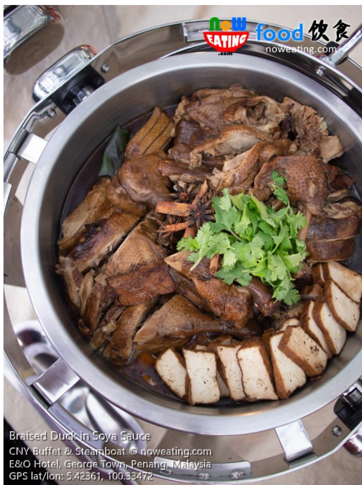
Braised Duck in Soya Sauce CNY Buffet & Steamboat E&O Hotel, George Town, Penang, Malaysia GPS lat/lon: 5.42361, 100.33472