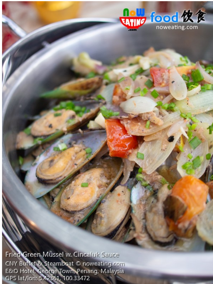
Fried Green Mussel with Cincaluk Sauce