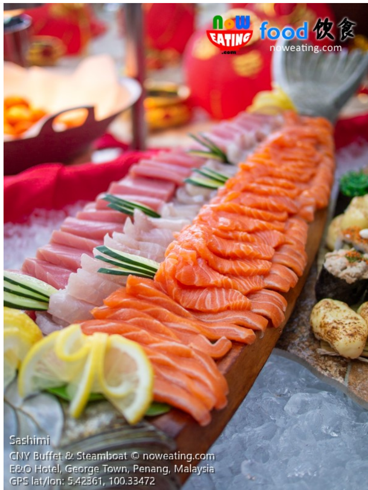
Sushi and Sashimi Counter with selection of Sushi Rolls, California Rolls, Norwegian Salmon, Tuna and White Fish Sashimi