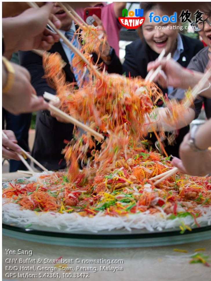
Yee Sang CNY Buffet & Steamboat E&O Hotel, George Town, Penang, Malaysia GPS lat/lon: 5.42861, 100.33472

Special for Chinese New Year, each table will be given a Prosperity Salmon Yee Sang to begin with.