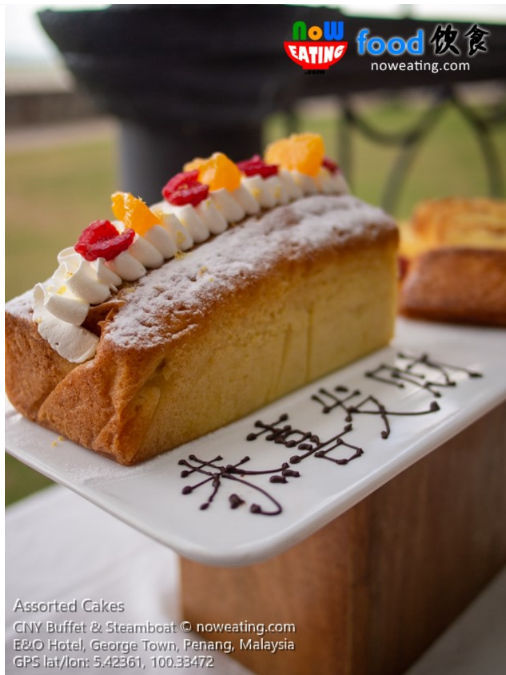
Assorted Cakes CNY Buffet & Steamboat E&O Hotel, George Town, Penang, Malaysia GPS lat/lon: 5.42361, 100.33472

Not to be missed are mouthwatering desserts . In general, one will find more than hundred dishes on the buffet spreads, from appetizer to main course to desserts.