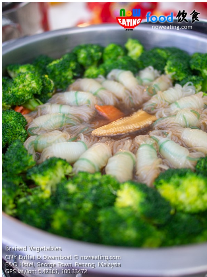
Braised Vegetables, Japanese Yam Roll and Kui Fei Abalone (V)