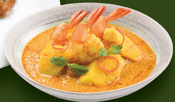
REFINED STRAITS NYONYA

For reservation, please contact +604 222 2151 / +016 419 8923 or email fbcentral.resv@eohotels.com or scan "QR CODE" to book.