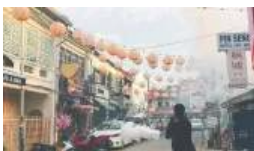
We Travelled to Penang When Covid Hasn't Left The Scene July 13, 2020 In "Malaysia"