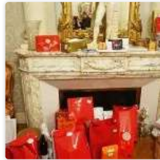
A French Christmas Eve Dinner

This is the first post about Malaysia. And among the many places I have written about thus far, this is a place both geographically and sentimentally closest to Home. Malacca/Melaka [...]