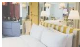
S Hotel, Taipei March 28, 2020 In "Life"