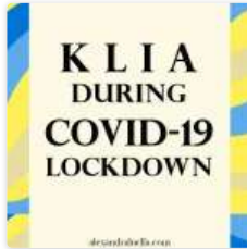
Kuala Lumpur International Airport (KLIA) during Coronavirus Lockdown

It's a shame that after 6 years of blogging, I realise I don't write enough about my own country. It's not that I have loved it any less since moving to London (speaking of which, there [...]