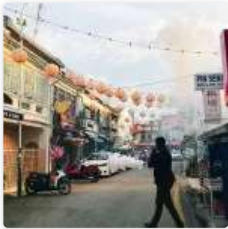
We Travelled to Penang When Covid Hasn't Left The Scene

It's a shame that after 6 years of blogging, I realise I don't write enough about my own country. It's not that I have loved it any less since moving to London (speaking of which, there [...]