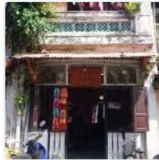
Digging into the Jonker's Heritage in Malaysia

As Malaysia goes into a period of lockdown from 18th March to 14th April, I will be publishing a new post on this blog everyday to keep all my friends back home company. This post is part [...]