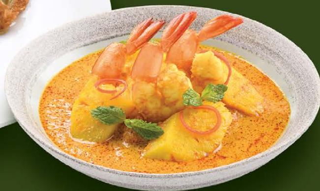
REFINED STRAITS NYONYA

For reservation, please contact +604 222 2151 / +016 419 8923 or email fbcentral.resv@eohotels.com Booking is also available through Tableapp.com