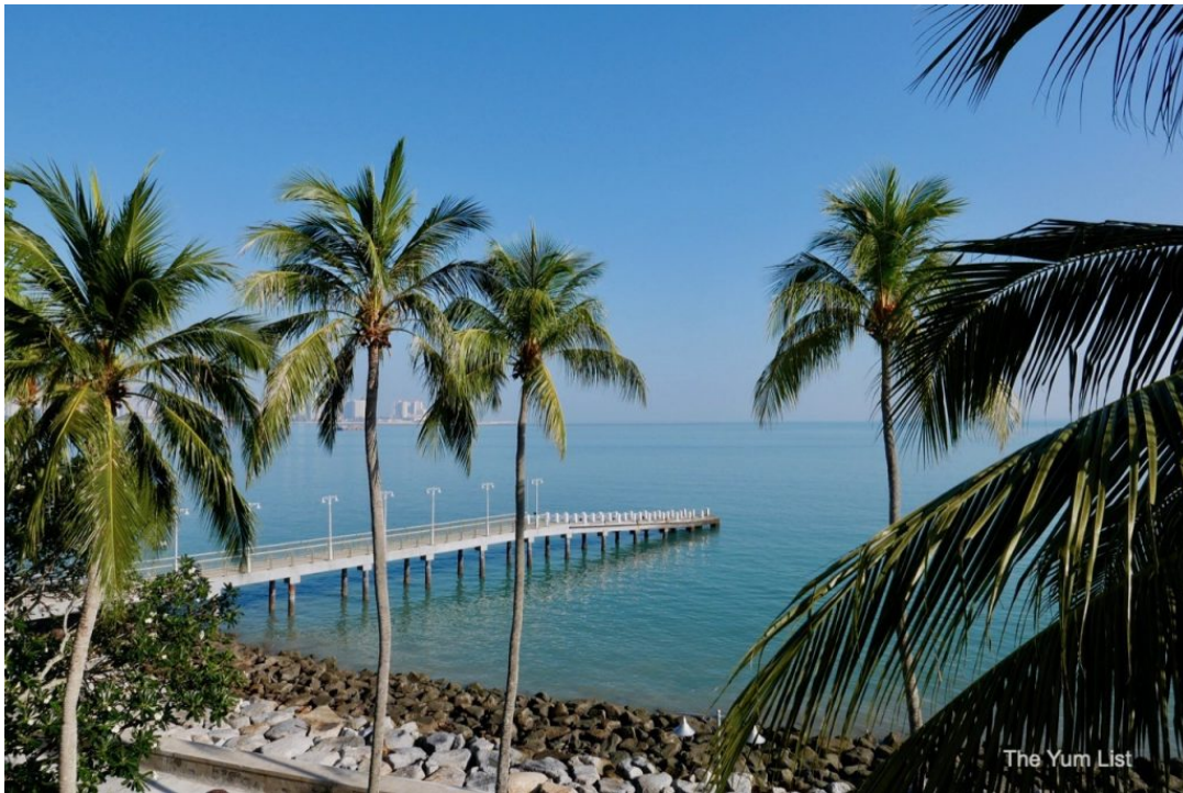
View from the Deluxe Suite - Eastern & Oriental Hotel Penang