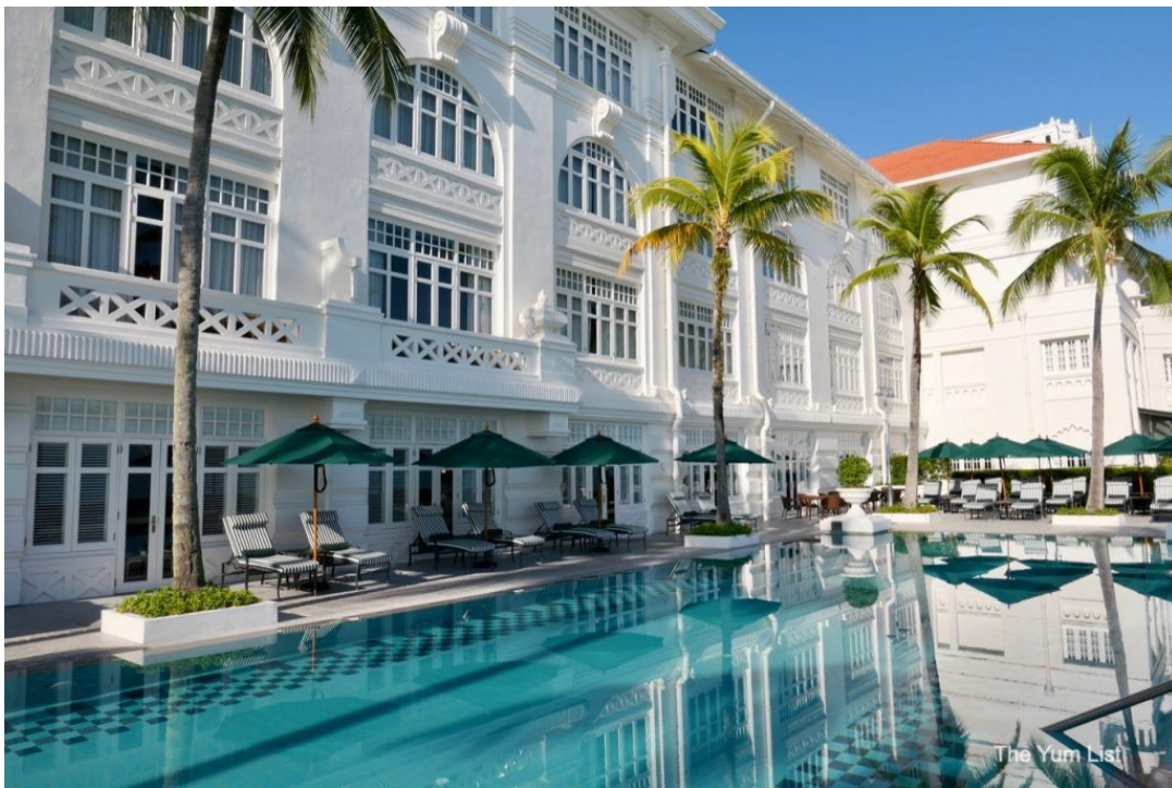
Heritage Wing Pool - Eastern & Oriental Hotel Penang