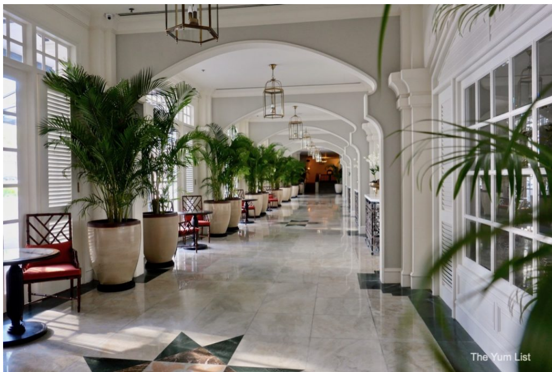
Heritage Wing Hallway