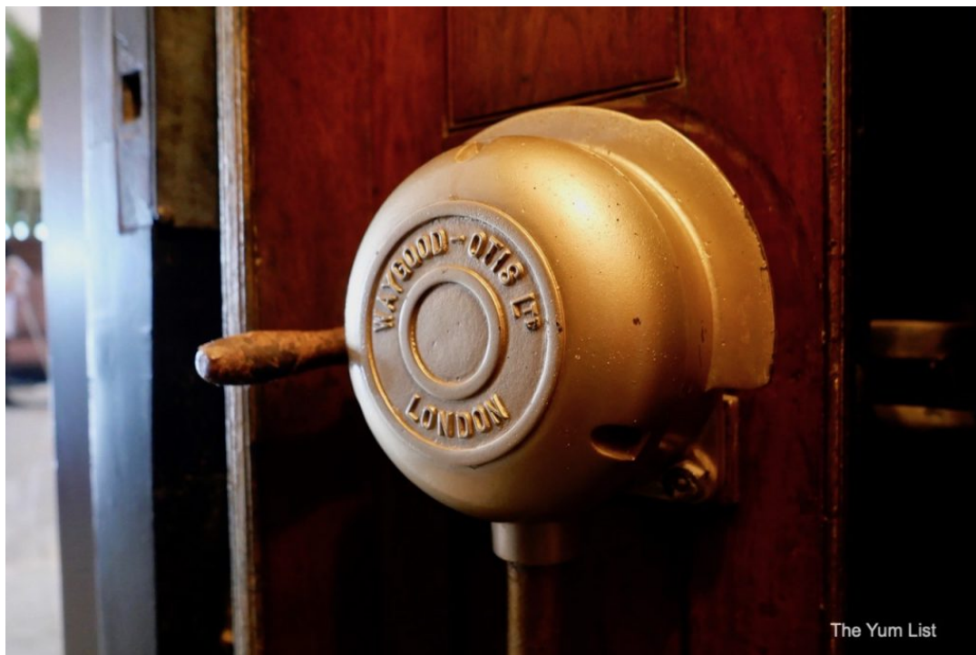
Electric Waygood-Otis Passenger Lift

Enter and consider the Echo Dome, a fabulous cupola where sound bounces between the dome and the Carrera marble floor, making even whispers audible to all who stand underneath. Gaze left and find the grand staircase. Look directly ahead and discover one of Malaysia's earliest passenger lifts and Electric Waygood-Otis, of only 30 creations that still exist worldwide. Head to the seawall and find the infamous java tree, the oldest and largest specimen on the island, alongside cannons, formerly part of the Fort Cornwallis structure built in the 18th century.