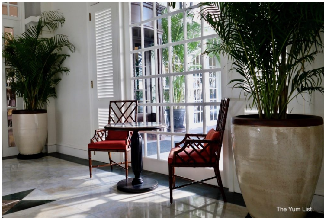
Table for Afternoon Tea