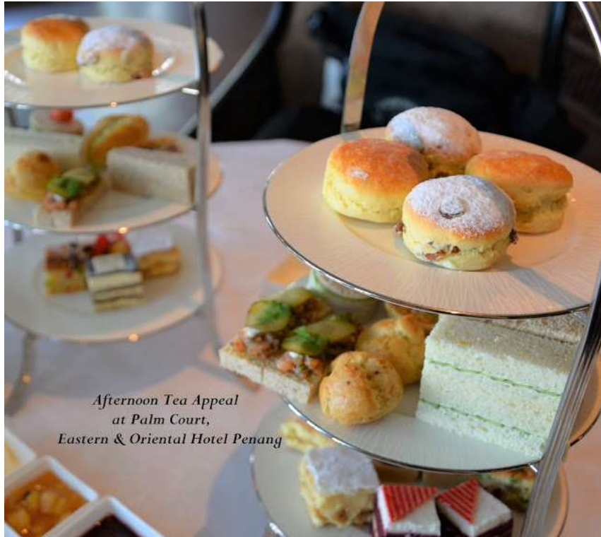
Afternoon Tea Appeal at Palm Court, Eastern & Oriental Hotel Penang