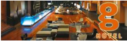
Tree Bar 2016