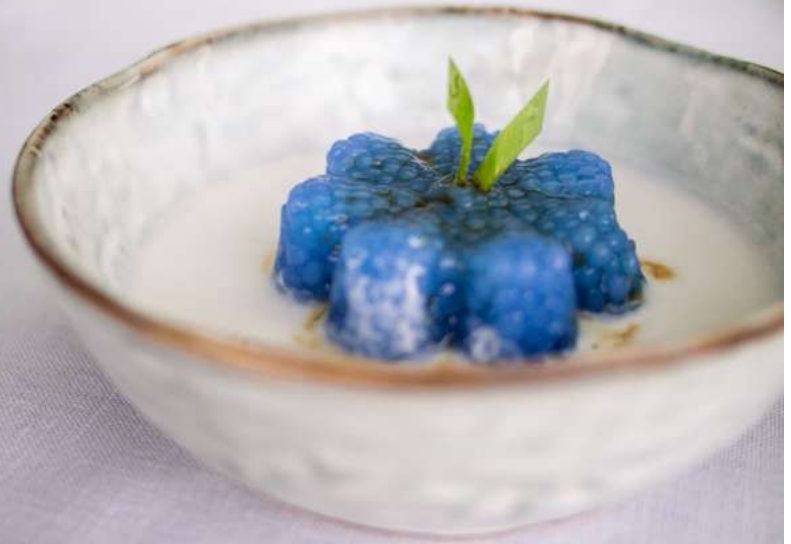
Sago Gula Melaka Java Tree E&O Hotel, George Town, Penang, Malaysia GPS lat/lon: 5.42361, 100.33472