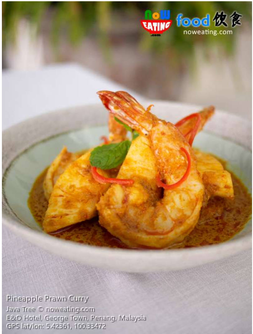
Pineapple Prawn Curry