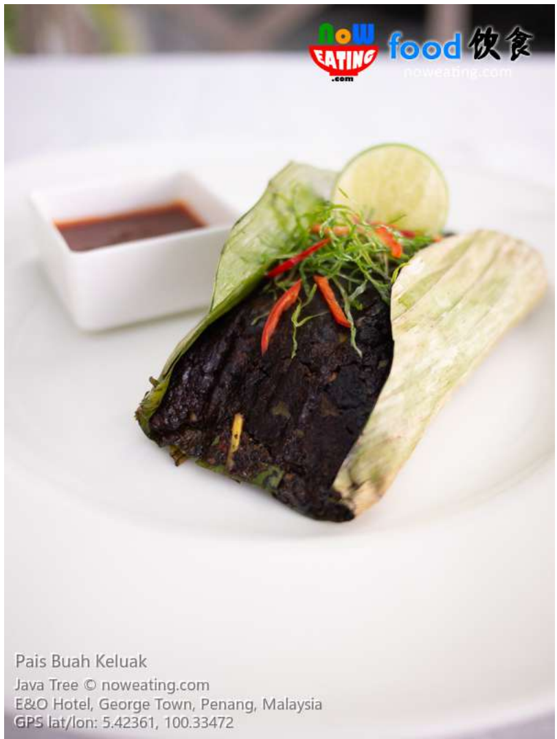
Pais Buah Keluak