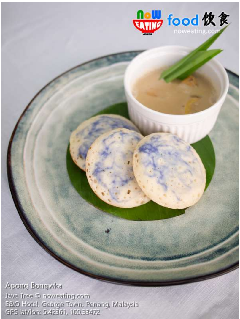
Apong Bongkwa Java Tree E&O Hotel, George Town, Penang, Malaysia GPS lat/lon: 5.42361, 100.33472