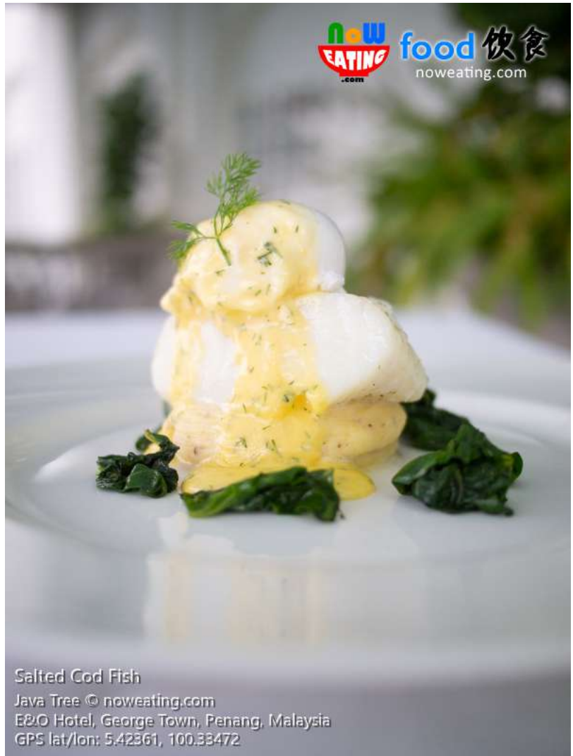
Salted Cod Fish Java Tree E&O Hotel, George Town, Penang, Malaysia GPS lat/lon: 5.42361, 100.33472

← Salted Cod Fish (RM125) - Poached in Milk, Whole Grain Mustard Mash, Baby Spinach, Poached Egg, Hollandaise Sauce.