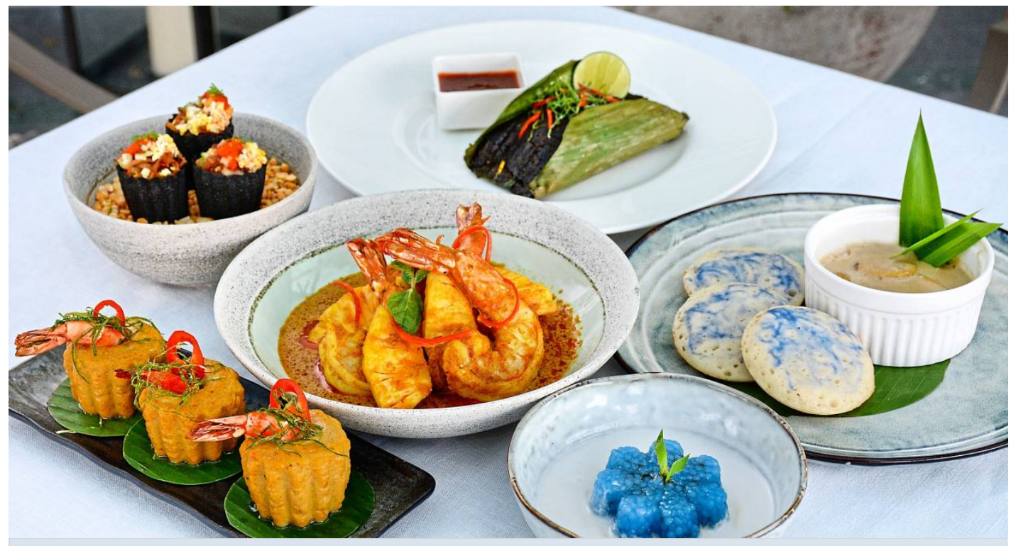
Among the Straits Nyonya dishes are (clockwise from lower left) Otak Otak, Blackened Top Hats, Pais Buah Keluak, Apom Bongwka, Sago Gula Melaka and Pineapple Prawn Curry.

STRAITS Nyonya recipes and European classics dovetail at Java Tree, an elegant new restaurant at the iconic Eastern and Oriental (E&O) Hotel in Penang.