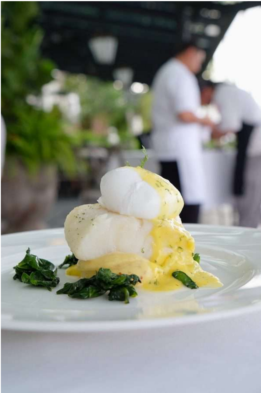
Salted Cod Fillet RM125

The Beef Wellington offers a premium cut of beef tenderloin wrapped in puff pastry and served with baby vegetables and neutral jus while the Beef Bourguignon has a recipe showcasing tenderness of slow-braised beef in red wine.