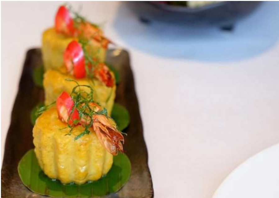
Appetizer – Otak Otak RM30 local mackerel, coconut cream, tumeric, kaffir lime