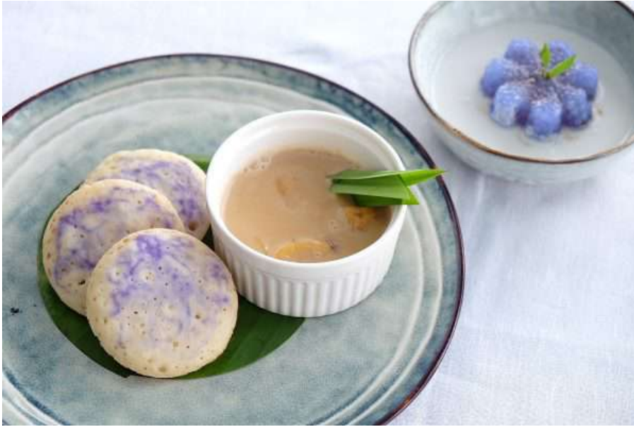
Apom Bongwka RM28 & Sago Gula Melaka RM28

From the savory dishes, move on to the Straits Nyonya sweetened delights. There are just two – one is the Sago Gula Melaka (sago pearls with coconut cream and palm treacle) and the other the Apom Bongwka (mini rice pancakes) accompanied by pengat pisang (warm coconut and banana sauce).