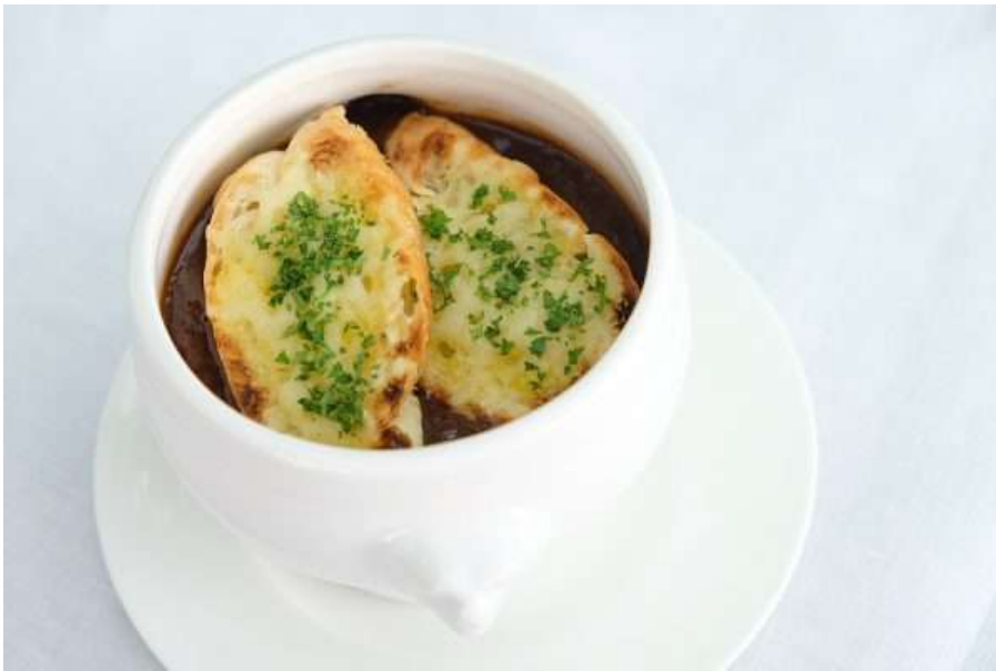
French Onion Soup RM30

On the other hand, the Salted Cod Fillet poached in milk is served with Hollandaise sauce, poached egg, baby spinach, and whole-grain mustard mash.