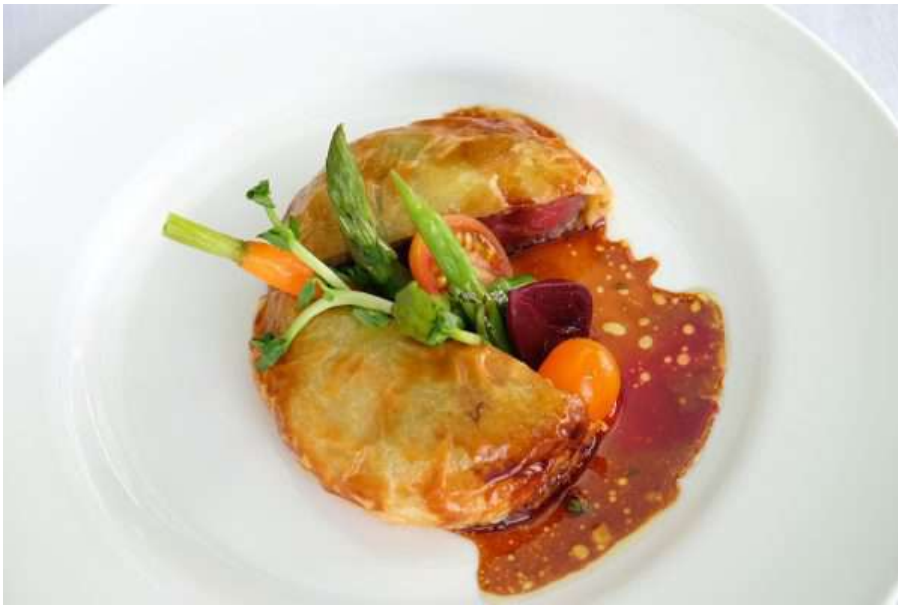
Beef Wellington RM85