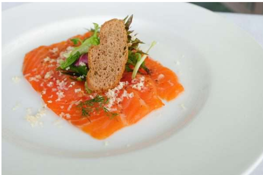
Homemade Gravlax RM40