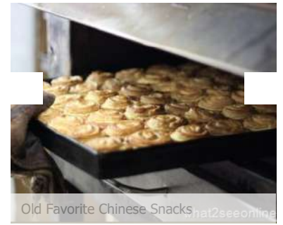
Old Favorite Chinese Snacks hat2seeonline

On the other hand, the Salted Cod Fillet poached in milk is served with Hollandaise sauce, poached egg, baby spinach, and whole-grain mustard mash.