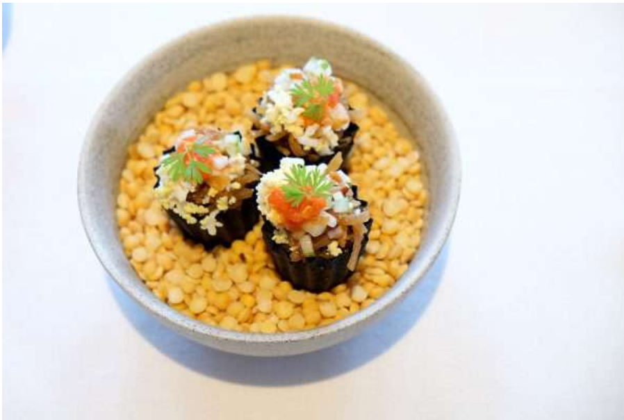
Appetizer – Blackened Top Hats RM15 pastry shell, jicama, carrot, cuttlefish, shredded egg, salmon roe