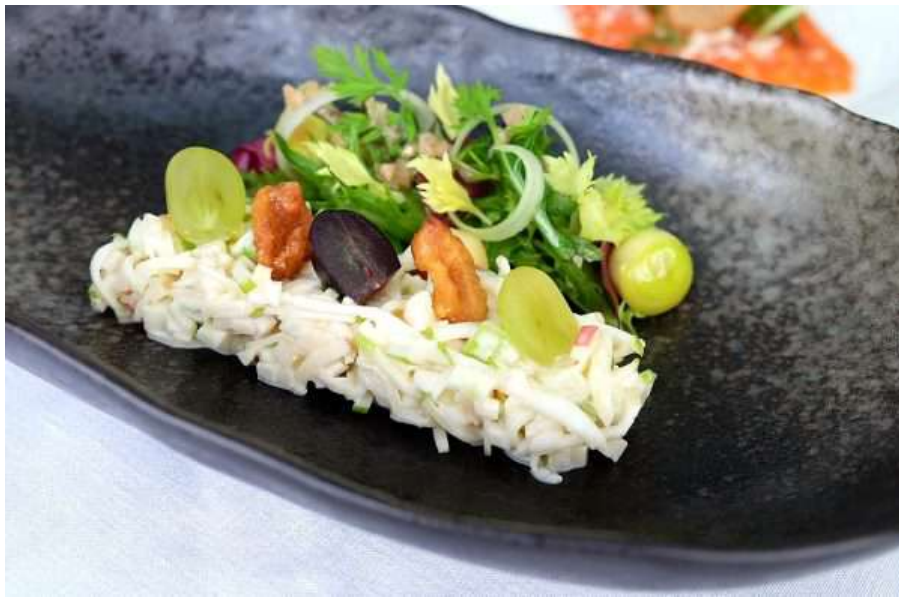
Waldorf Salad RM25

The Waldorf Salad is a healthy appetizer that strikes a balance between the sweet and sour notes of fruits (apple & grapes) with the added texture of nuts.