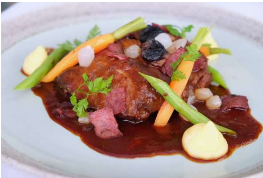
Beef Bourguignon RM85