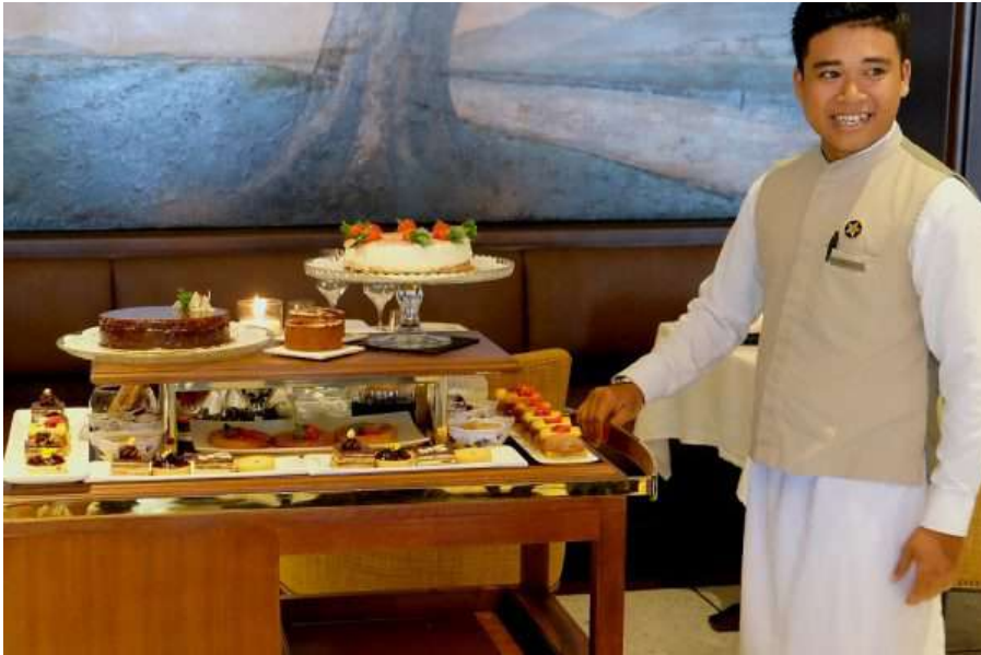
Desserts served from the dessert trolley