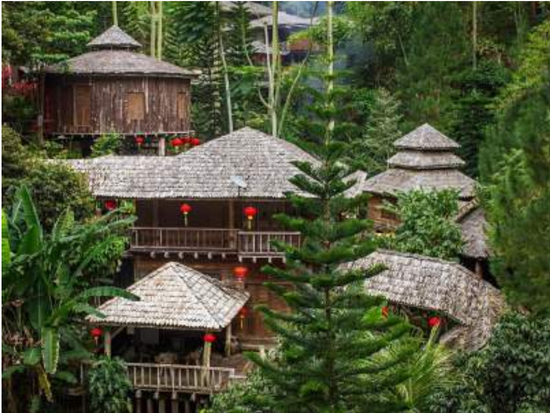
Fig Tree Hill Resort ($$$$)

A full-on hideaway from the hustle and bustle of the real world. There are six luxurious two-bedroom villas, built on top of a tropical hill. Each one is thoughtfully designed to look like a traditional wooden Malaysian home. They look traditional but have all the modern amenities you could want, including robes, slippers, outdoor rain showers, and bathtubs. There is a large mountain-water fed pool.