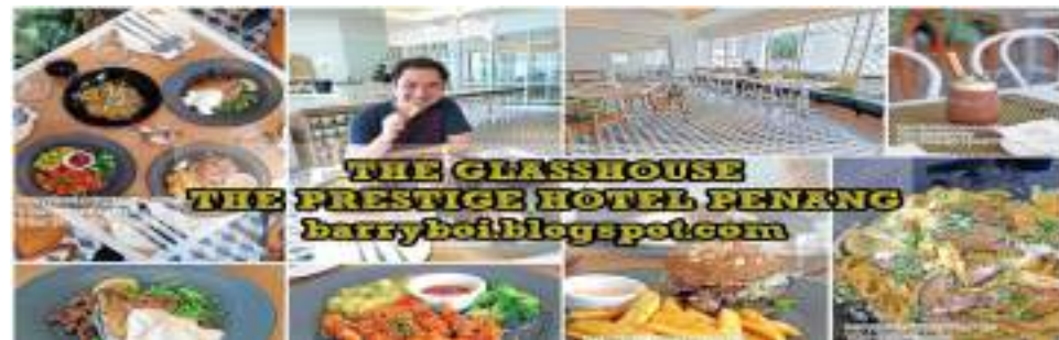
Delicious Semi Buffet Lunch at The Prestige Hotel Penang