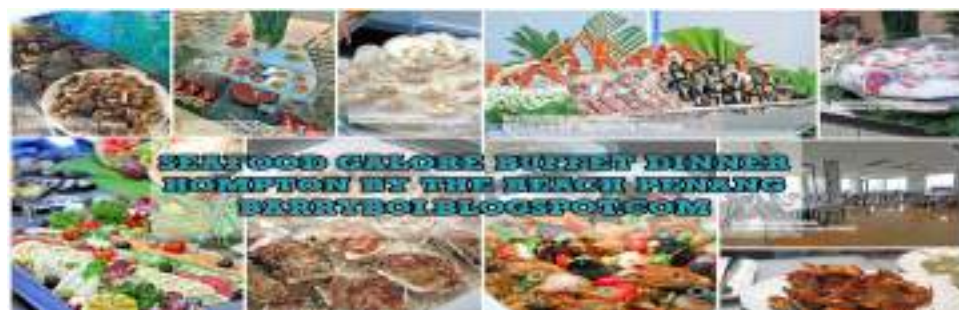
Seafood Galore Buffet Dinner at Hompton By The Beach Penang