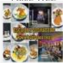
Escobar Signature @ Le Embassy Hote...