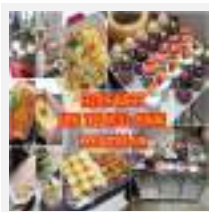
Festive Buffet at Olive Tree