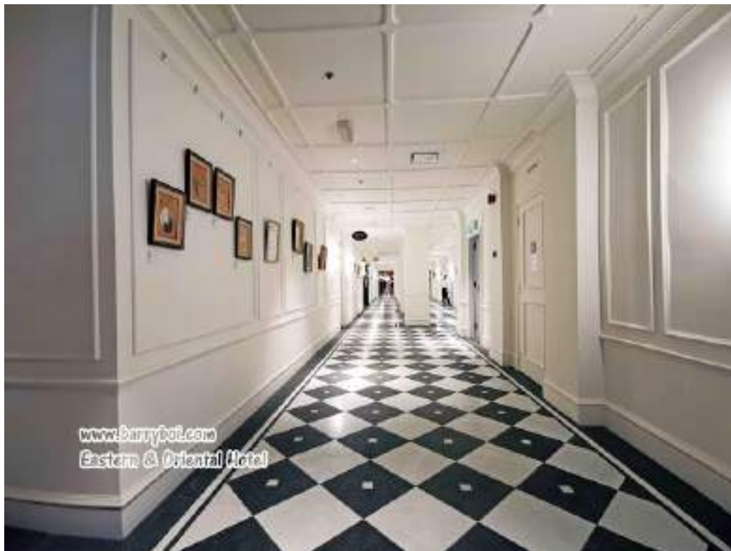
Newly Refurbished Suites