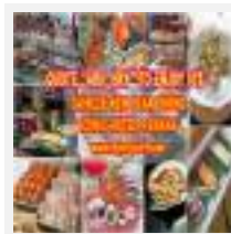
Chinese New Year Dining at Iconic H...