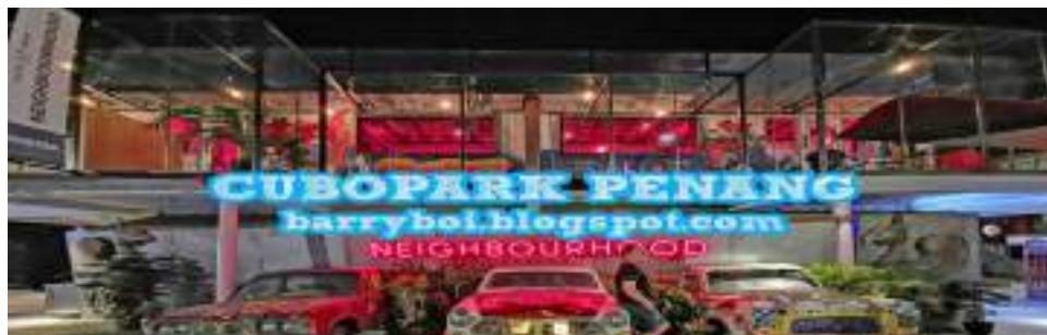
CUBOPARK @Chusan Penang