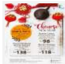
Chinese New Year Dining at Eastin H...