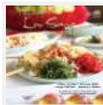
Chinese New Year Dining at Ixora Ho...