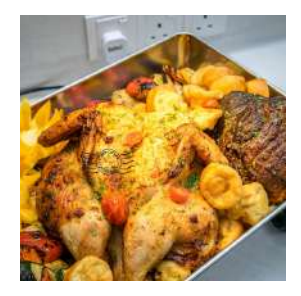
Saturday Dinner and Sunday Lunch Hot Roast Buffet @ The Glasshouse, The Prestige Hotel