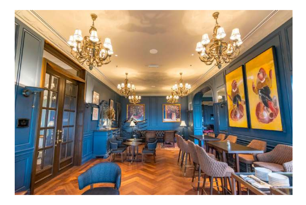
Farquhar's Bar mainly serves bar staples and classic cocktails with a view of Penang island's waterfront. We loved the leather sofa and stool that gave the bar a classic Gentleman design.

Looking closely, Farquhar's Bar offers the slight view of scenes in Kingsman the movie.