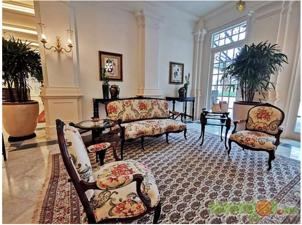
Heritage Wing Suites