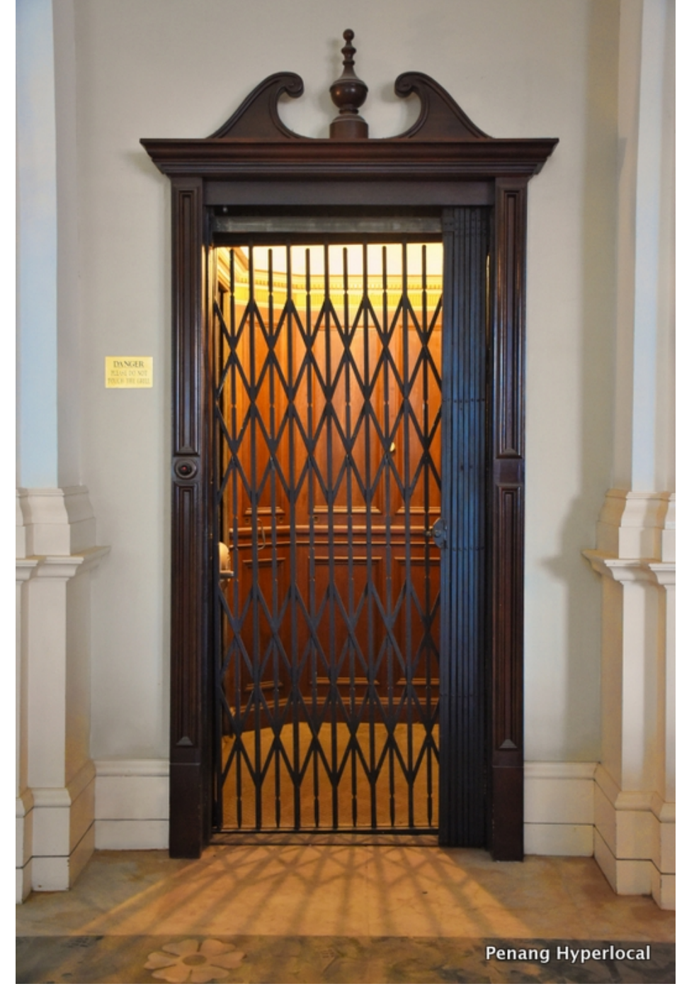
The Otis lift designed to resemble a birdcage has served generations of dignitaries, VIPs and celebrities

In addition, there is the iconic echo dome in the Heritage Wing lobby which is an original structure from the time of the Sarkies management and will remain as part of the hotel in the future.