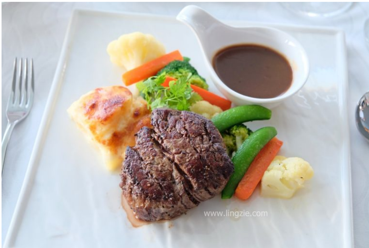
Grain fed Beef Fillet Mignon