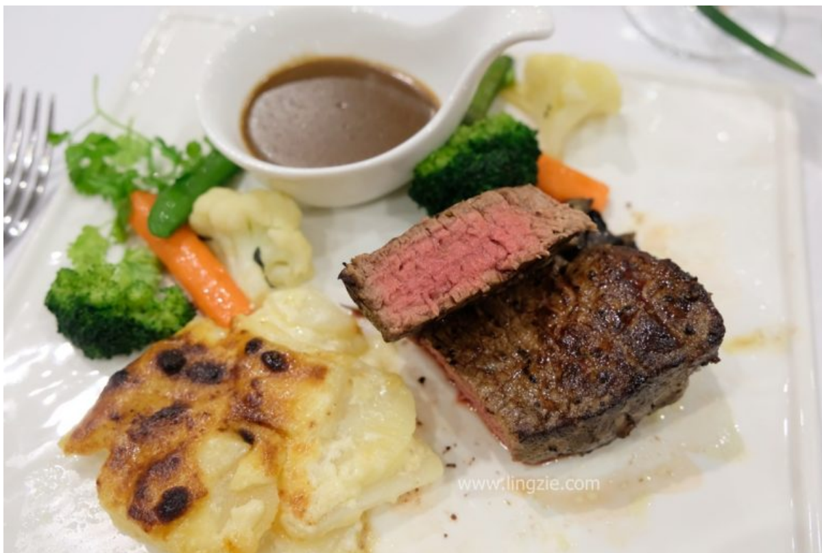
Grain fed Beef Fillet Mignon – medium doneness