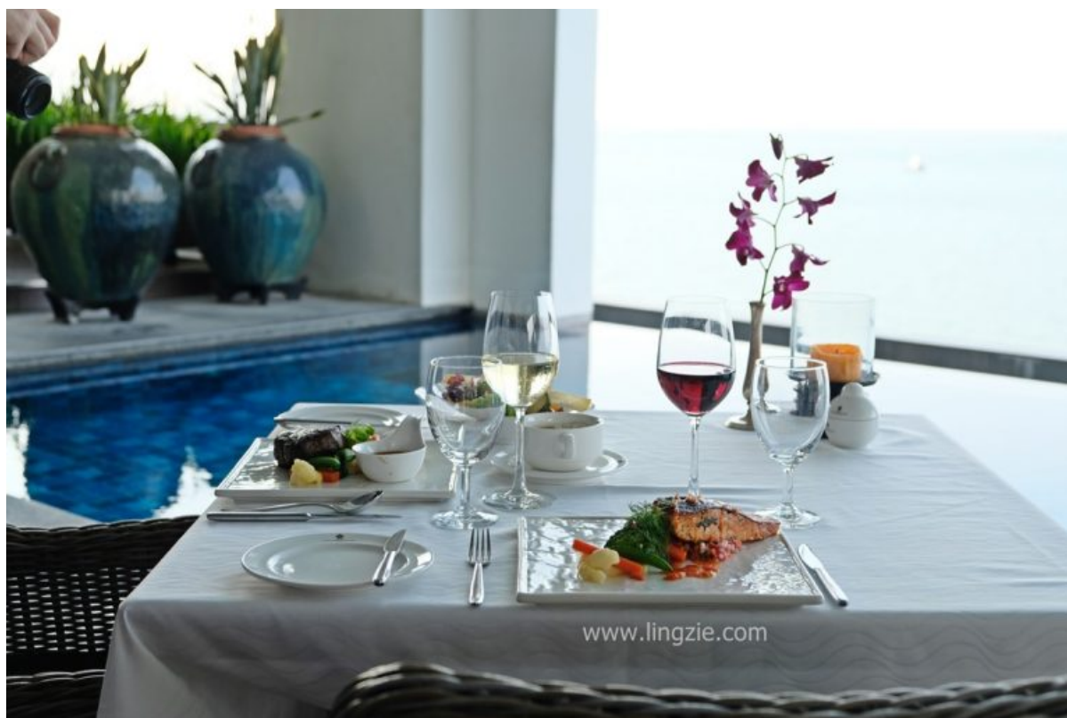
Dinner by the Pool set up at the Poolside Terrace, 6th Floor of Victory Annexe Wing