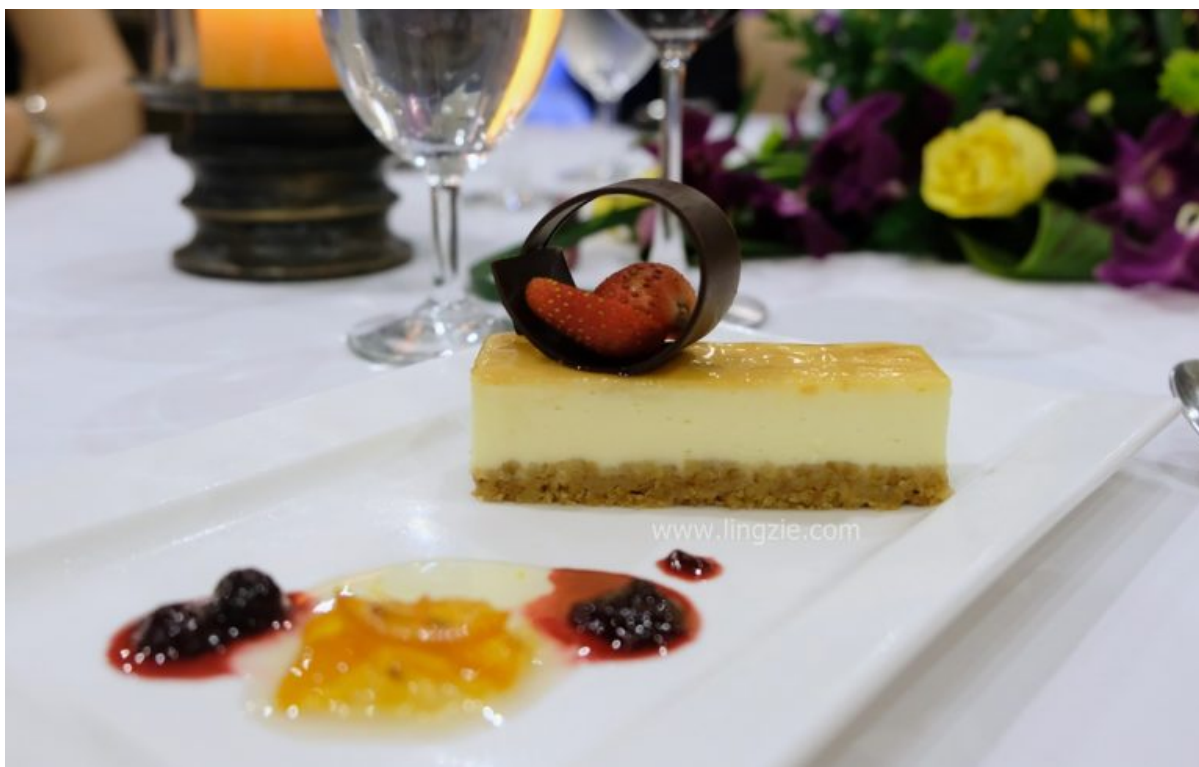
Dessert of the Day

Dessert of the day came in the form of a light and creamy cheesecake served with fruit compote. We were then offered tea or coffee to finish the meal.