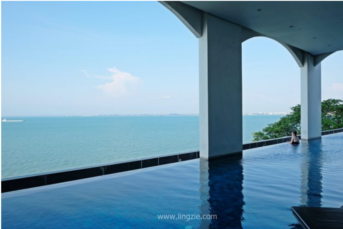
Pool at the Poolside Terrace

For an intimate and romantic meal, Eastern & Oriental Hotel offers it's exclusive Dinner by the Pool where one can dine overlooking the pool and the Andaman Sea.