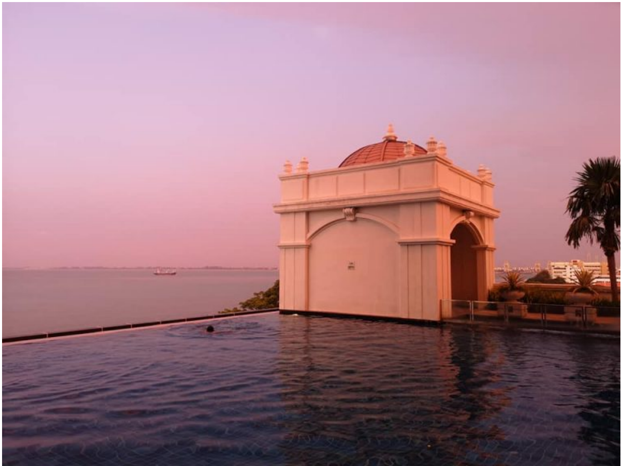
Glorious view at sunset