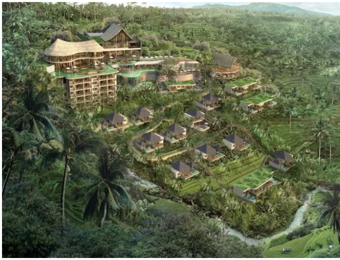
Kayon Jungle Resort Ubud.

For Best Costume Design, the façades of hotels come under scrutiny, with standout names like Singapore's Six Senses Duxton, a black and gold-tinted shop house row, and Kayon Jungle Resort Ubud in Bali, Indonesia, for its rolling hills of green and rice terrace-inspired layout.