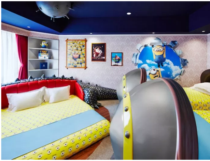
Hotel Universal Port.

Of course, you can't have a tribute to the Oscars without including Best Picture, and here they are hotels where award-winning films were shot. Flicks like The Quiet American (2002) and Indochine (1992) featured the grounds of Ho Chi Minh City's Hotel Continental Saigon, while the characters of Bill Murray and Scarlett Johansson frequently met in the 52nd floor bar at Park Hyatt Tokyo for Lost in Translation (2003).