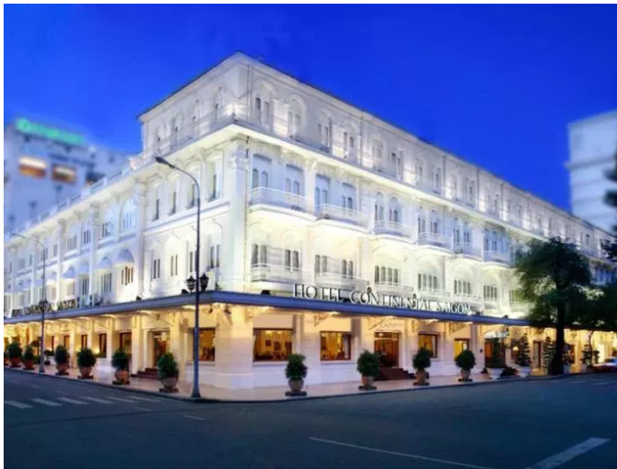
Hotel Continental Saigon.

Of course, you can't have a tribute to the Oscars without including Best Picture, and here they are hotels where award-winning films were shot. Flicks like The Quiet American (2002) and Indochine (1992) featured the grounds of Ho Chi Minh City's Hotel Continental Saigon, while the characters of Bill Murray and Scarlett Johansson frequently met in the 52nd floor bar at Park Hyatt Tokyo for Lost in Translation (2003).