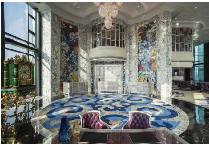
The Reverie Saigon.

For Best Costume Design, the façades of hotels come under scrutiny, with standout names like Singapore's Six Senses Duxton, a black and gold-tinted shop house row, and Kayon Jungle Resort Ubud in Bali, Indonesia, for its rolling hills of green and rice terrace-inspired layout.