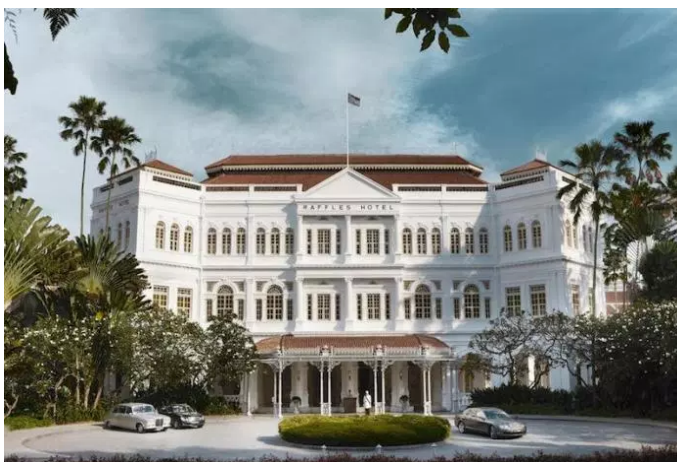
Raffles Singapore.

More recently, Crazy Rich Asians cast a spotlight on Raffles Singapore when Rachel Chu and her ridiculously rich fiancé Nick Young spent the night in the Presidential Suite. Currently closed for restoration works, the hotel is slated to reopen in mid-2019.