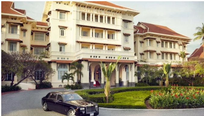
Raffles Hotel Le Royal.

If you're still reeling from all that Hollywood buzz, you're not alone. Jumping on the bandwagon, travel booking platform has come up with its own Oscar-inspired list of award-worthy "cinematic escapes" (i.e. hotel destinations in Asia), including various categories and their "nominees."