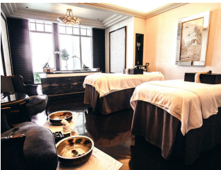
MALI MOONLIGHT SOOTHING MASSAGE AT PAÑPURI