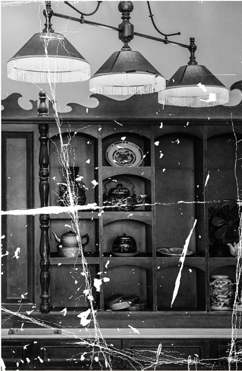
E&O hotel history