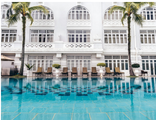
EASTERN & ORIENTAL HOTEL, PENANG : REVIEW BASED ON