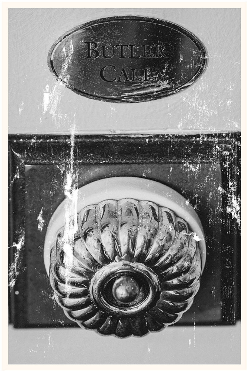
Butler Call is still there

Controversial British evacuation in the face of the Japanese, left locals alone to shift for themselves. Evacuation of the city was ordered only for 'pure' British residents. When the Japanese arrived, they found hotel empty. The authorities' instructions were to make sure that there was no liquor left around the hotel for the Japanese. The surroundings of the hotel were on fumes for a few days, due to all the buzz running down the drains and smashed bottles. Penang's civilian suffered terribly from Japanese bombing raids. During the Japanese occupation of Penang, military officers used the hotel as their own private club, now renamed The Penang Haitan Ryokan. The military HQ was right next door to the hotel. Allies started their air raids on Penang and hotel was in big danger due to the Japanese HQ on this location. Luckily there was no big harm. For Japan, everything changed when the 'A-bomb' was dropped on Hiroshima.