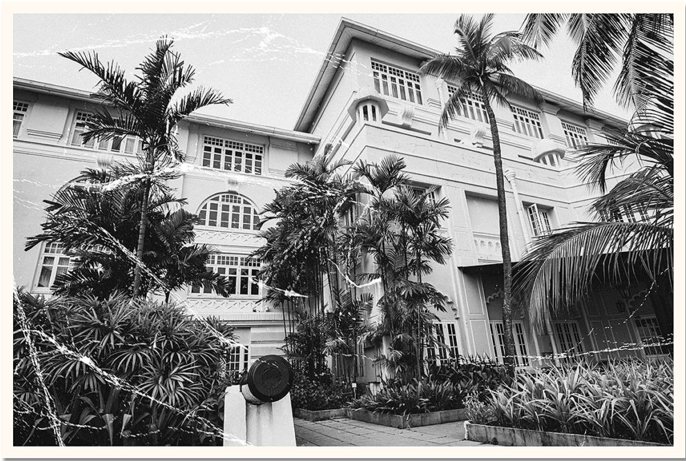
E&O hotel history

Next time the history of the hotel after WWII. The new era and blooming times were just amazing.