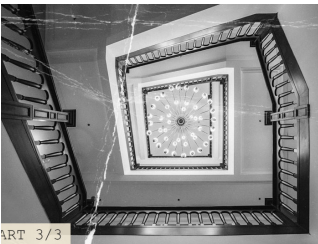
E&O HOTEL HISTORY PART 3/3 – A NEW START