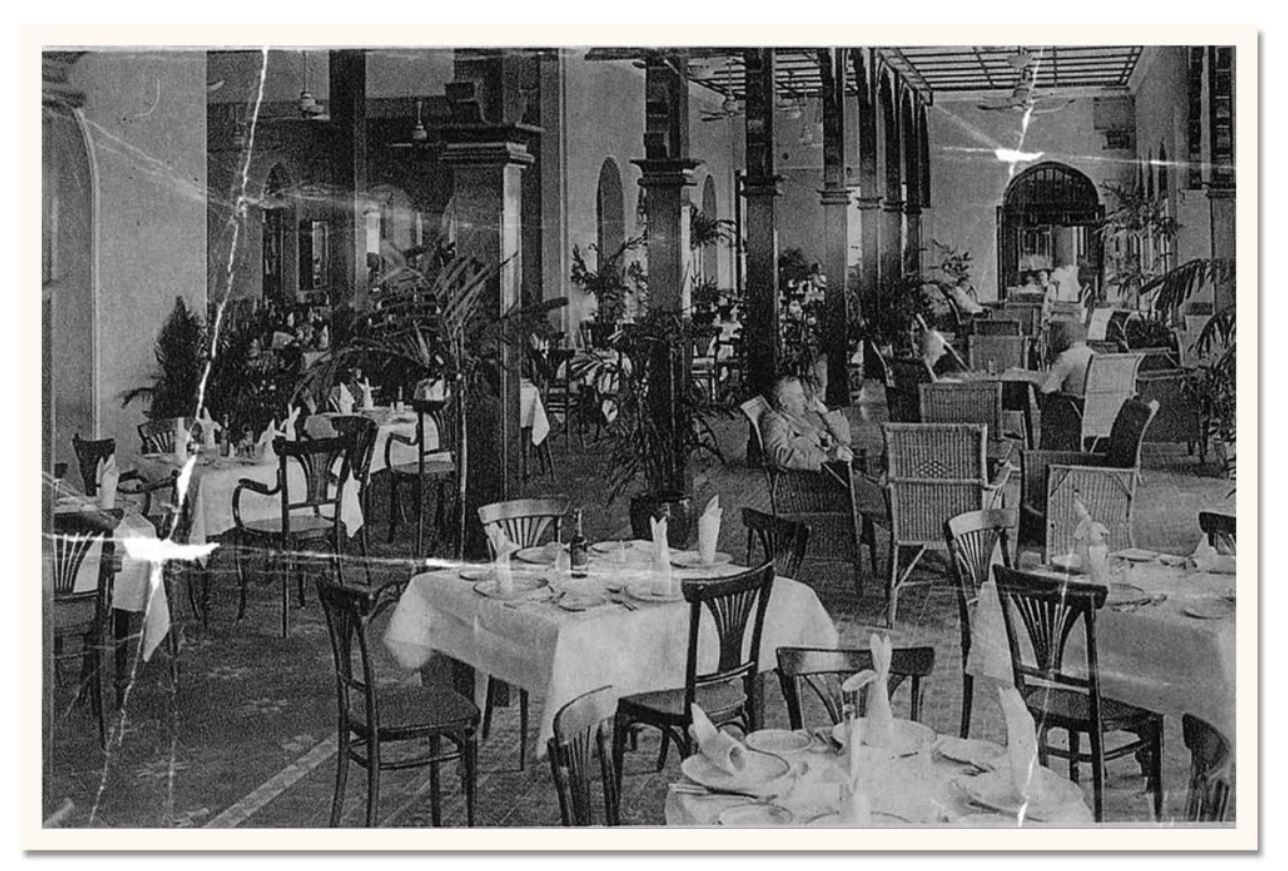
E&O restaurant.