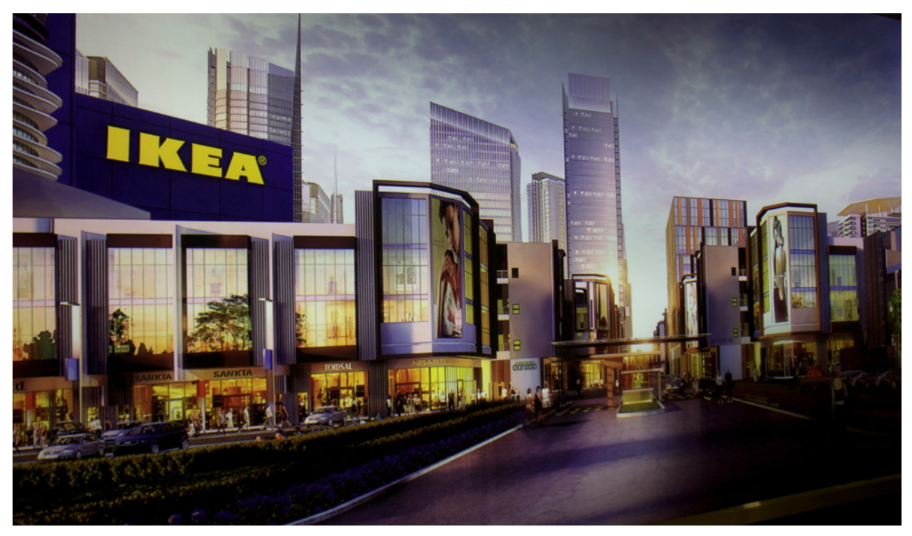
IKEA store to open in early 2019 as part of new integrated shopping centre within Aspen Vision City