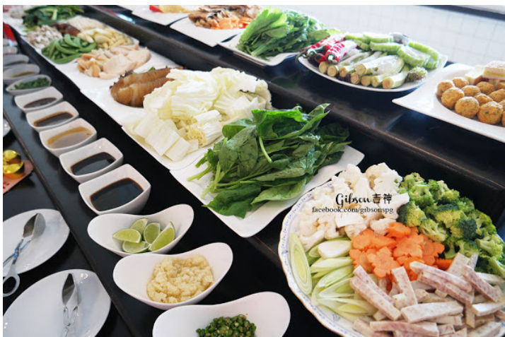
Three type of broths are available for the steamboat, namely chicken, Tom Yam and herbal soup.