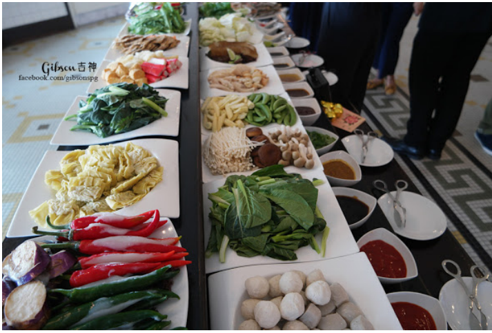
Among the seafood choices, the premium items are Crab, Prawn 16/20, Fish Maw, Red Snapper, Green Mussel and Sea Cucumber, White Pomfret and Salmon Fillet etc.