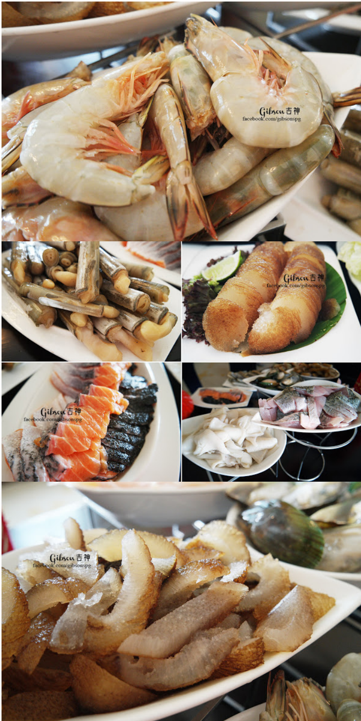
Other items for the steamboat include Teochew Fish dumpling, stuffed red chilli with fish paste, stuffed egg plant with fish paste, stuffed bitter gourd with fish paste, deep fried wonton, bean curd skin, bean curd, Sui Kaw, Sea Asparagus (Can), chicken meat, sliced beef, lamb and duck, various mushrooms and more.