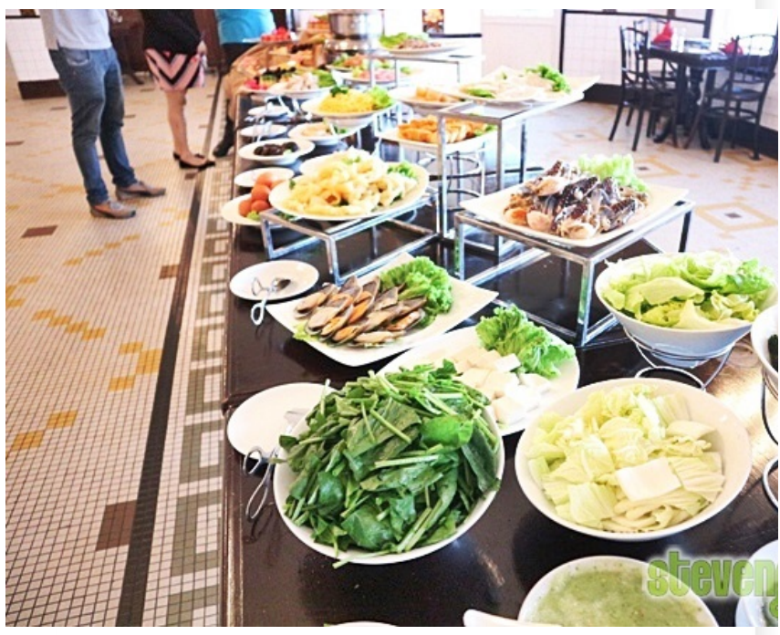
Almost every meal during or before Chinese New Year will kick off with the tossing of "Yee Sang".

Steamboat is a common meal during Chinese New Year. Until today there are still many families practising this tradition during Chinese New Year. Modern families may opt to eat out instead to avoid messing the kitchen or cleaning up after the meal. Sarkies Corner and Sarkies at E&O Hotel understand the pain of these households and hence they have come out with a specialsteamboat buffet dinner to usher the year of Rooster.