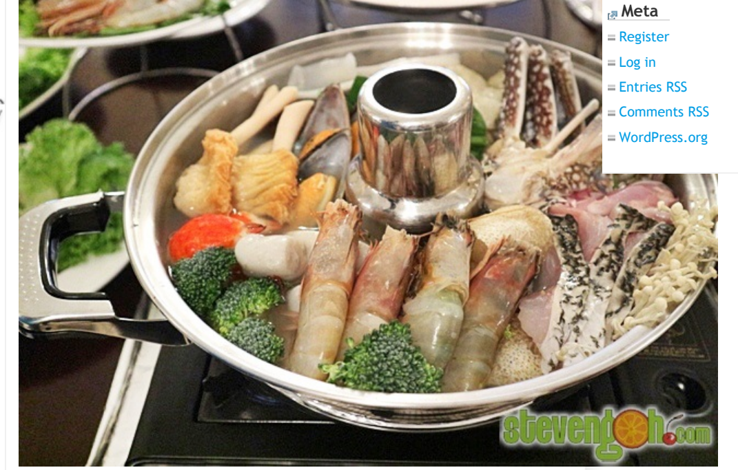
Below are the "treasures" for this exclusive steamboat: