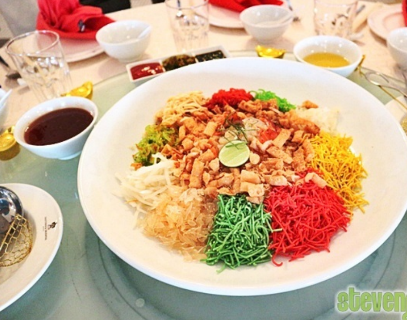
"Messing up" the dish using the chopsticks is a common scene when tossing the yee