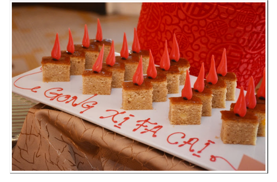
Assorted CNY cookies, a must for CNY celebration!