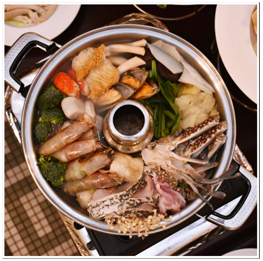
It's the time of the year again that we celebrate the prosperous season with some traditional steamboat. This year in Eastern & Oriental Hotel Penang, they are bringing sumptuous steamboat buffet at the Sarkies Corner.

Chinese New Year Steamboat Buffet @ Eastern & Oriental Hotel