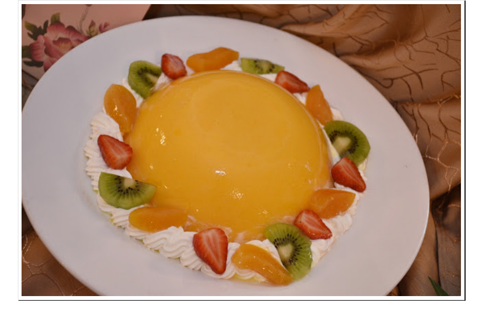
Refreshing and delicious tart.