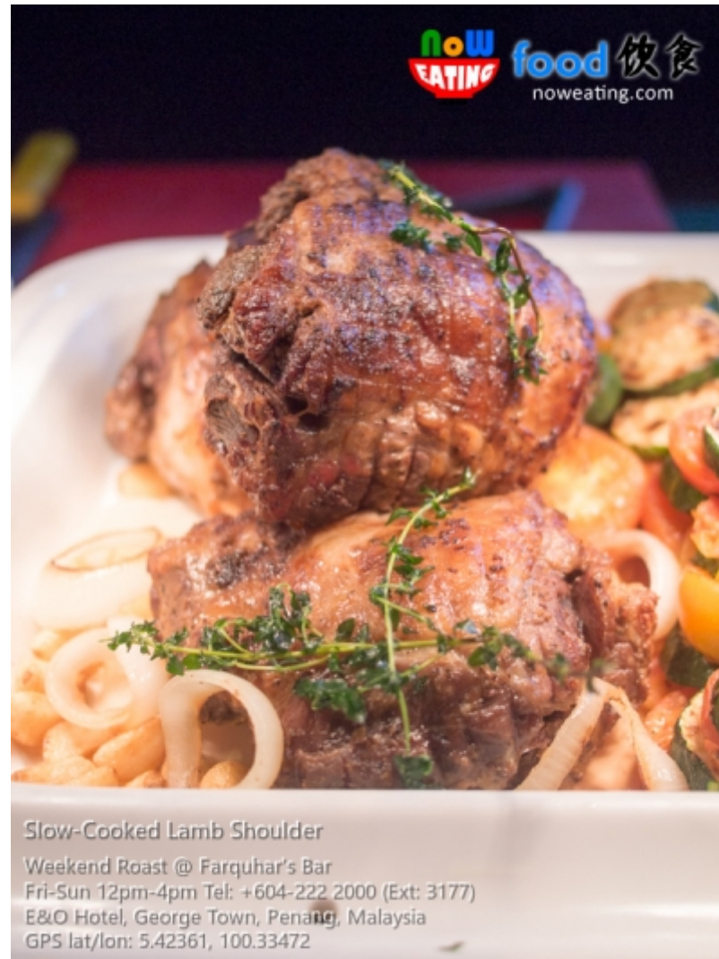
Slow-Cooked Lamb Shoulder

Weekend Roast @ Farquhar's Bar Fri-Sun 12pm-4pm Tel: +604-222 2000 (Ext: 3177) E&O Hotel, George Town, Penang, Malaysia GPS lat/lon: 5.42361, 100.33472