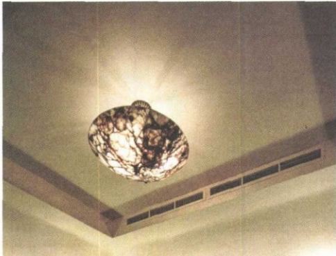
Natural essential oils and expert techniques make for a memorable session at the sumptuous spa