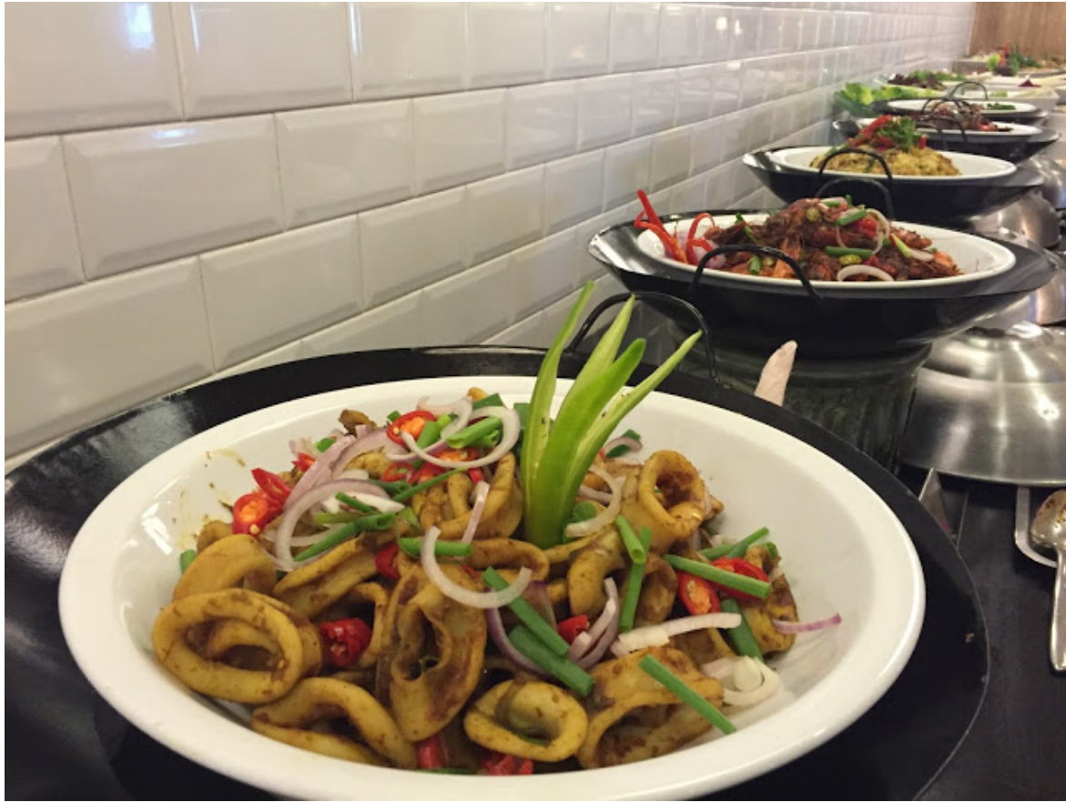
The hot dishes featured many Malay delicacies.

Sarkies Restaurant truly caters for the masses with the action stations famed roasted meats, especially the roasted duck. All of these are readily available in the Selera Kampung buffet spread. With a wonderful consistency and not-overly-done flavours, the Malay dishes was an excellent addition to the buffet, and a must-try is the roasted whole lamb, or more affectionately known as kambing panggang.