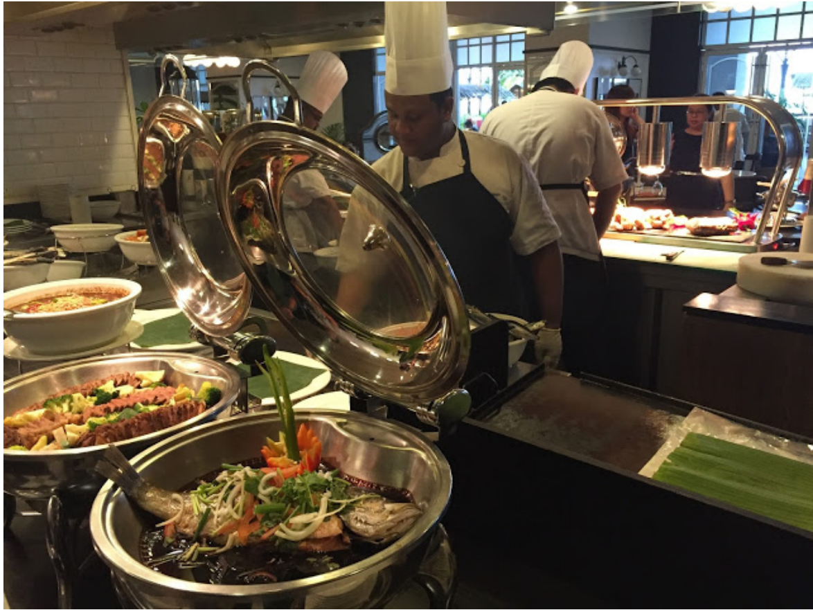
The action station to prepare the grilled seafood.

The tradition of Ramadhan Buka Puasa stretches back as long as I can remember! Different restaurants and establishments offer different packages - buffets, ala-carte, you name it ... but the very core of the dinner never changes over time. It's a meal of many sauces, curries, grilled and roasted meats, multitude of rice and breads; but most importantly, its a celebration of Umrah and a great time with friends and family.