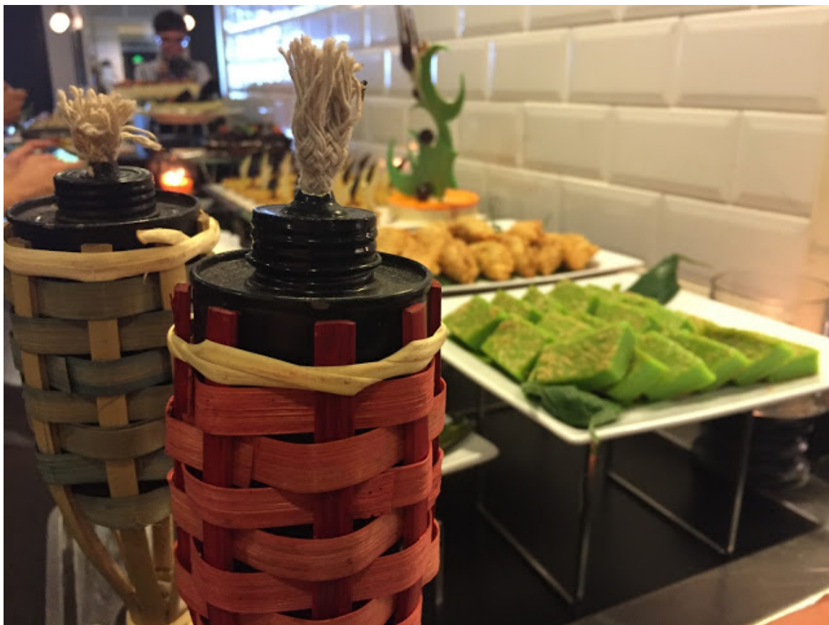
Hari Raya Aidilfitri decorations around Sarkies Restaurant.