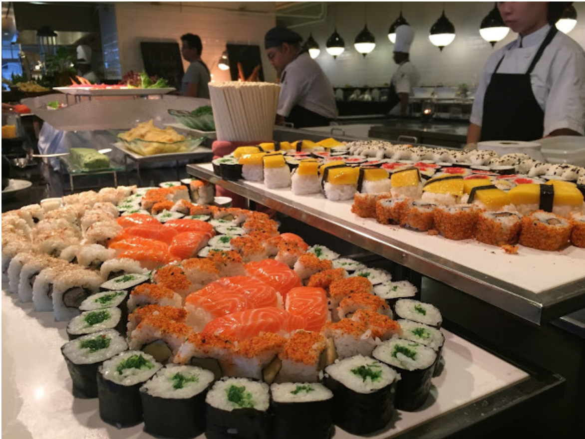
Appetizers include the sushi and sashimi spread.

a lavish buffet spread to break fast during the holy month, do consider the Selera Kampung Ramadan Buffet at Sarkies Restaurant. Upon stepping into Sarkies in the Victory Annexe of E&O Hotel, you'll be greeted by a larger-than-life spread of buffet, nicely spaced out and placed in a rustically calming setting.