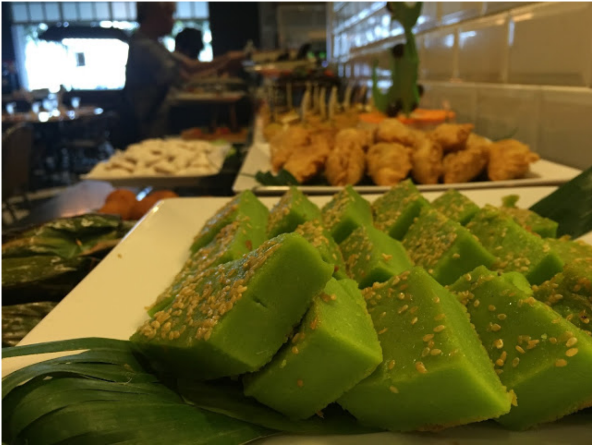
Various types of kueh raya at the buffet spread.

Penang365.com would like to record its appreciation to the management of Eastern & Oriental Hotel Penang for the invitation to review the Selera Kampung Ramadan Buffet at Sarkies Restaurant. Verdict? It is definitely a great place to buka puasa in style, and is definitely ideal for families or corporate functions.