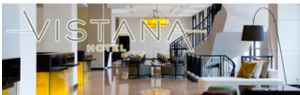
Barista Coffee Bar