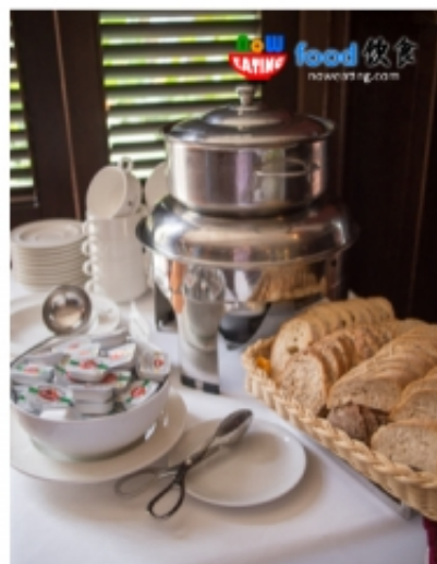
Potato and Leek Soup