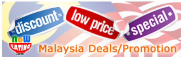
Exclusive! Malaysia Online Deals/Promotion (Groupon/Zalora/etc)