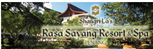
Rooted in Nature The Opening of FIP Lounge