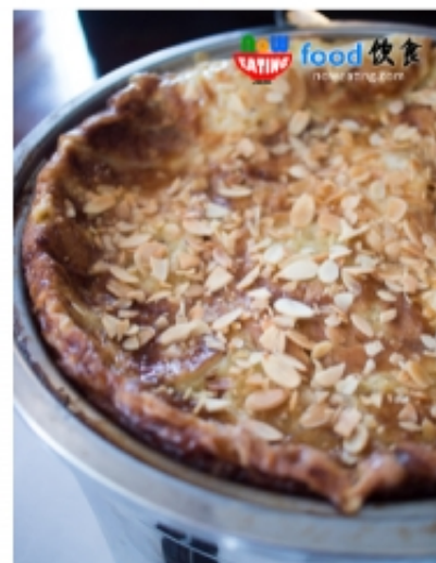
Spiced Bread and Butter Pudding

Salad, fruits, potato and leek soup, and spiced bread and butter pudding are also available as part of the Eat-All-You-Can buffet. As a whole, if you are a meat lover, you should give this premium yet affordable Sunday Roast a try.