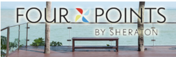
New Sunday Brunch