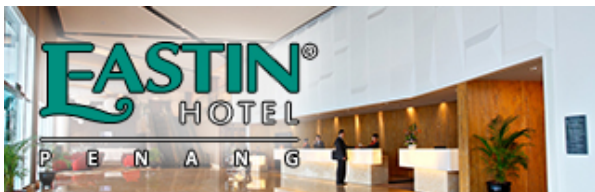
Christmas/New Year Buffet Dinner

guests, Sunday Roast is specially designed for roasted meat lover.