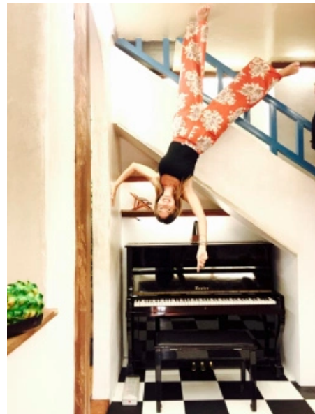
Change your reality at the Upside Down Museum, then head to Weld Quay, a living heritage and home to five Chinese clans – Lim, Chew, Tan, Lee and Yeoh.