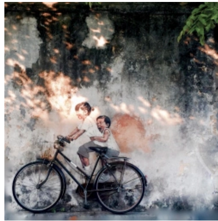
Kek Lok Si Temple, Snake Temple and Kapitan Keling Mosque and be blown away by Penang's architectural wealth