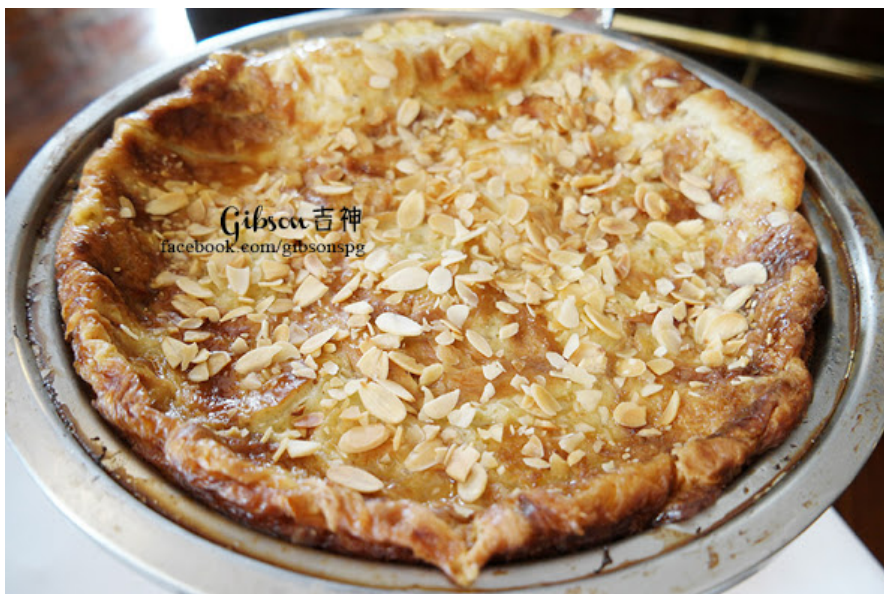
Bread Butter Pudding Vanilla Custard Sauce