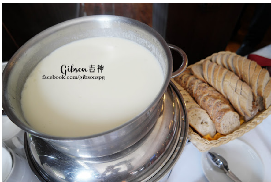
Potato & Leek Soup