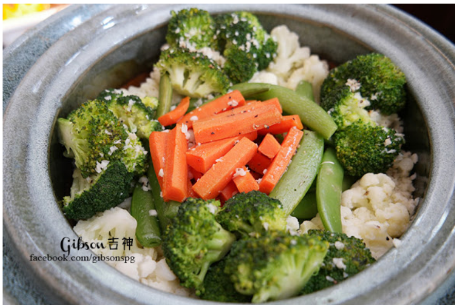
Side dish - Mix Vegetables