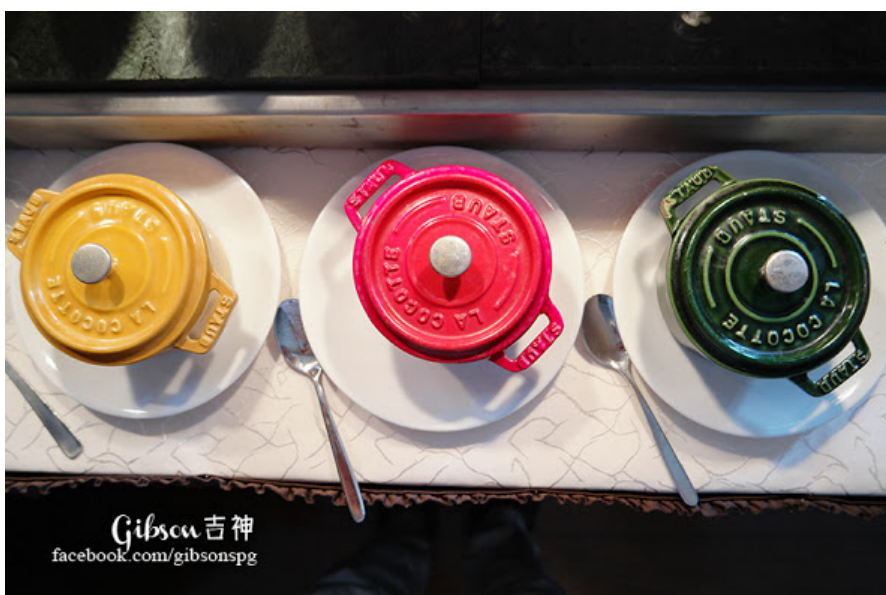
The sauces for the meat are prepare in the cute little pot.