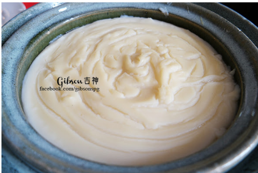
Side dish – Mashed potatoes