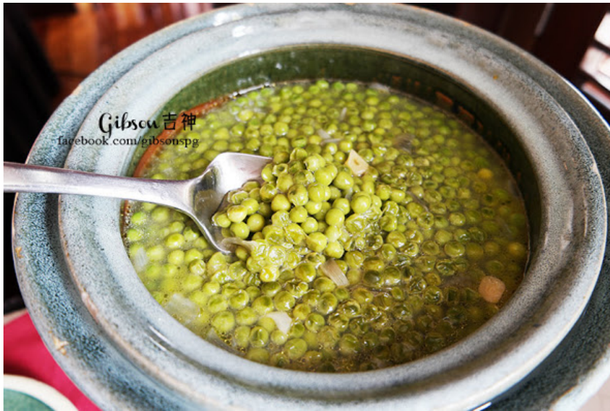
Side dish - Green Peas