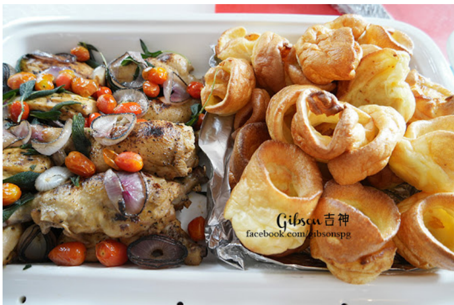
From Left: Roasted chicken breast and Yorkshire pudding