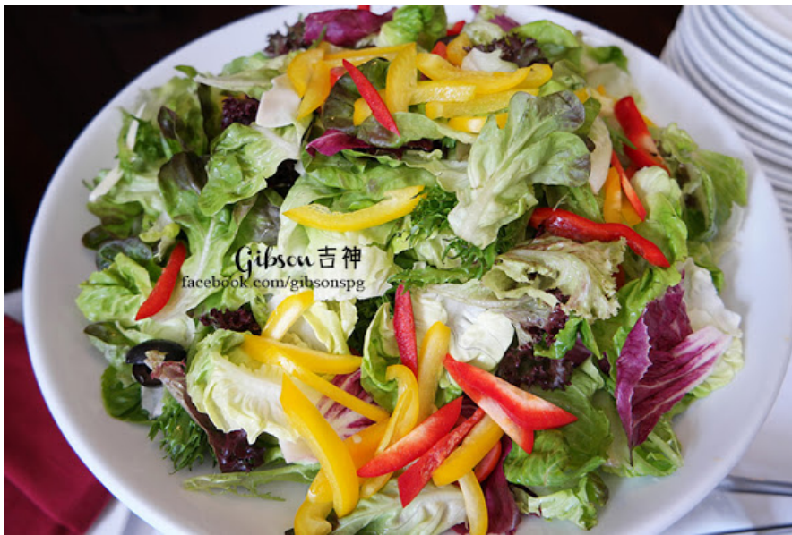
Salad of the day.