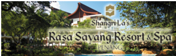
NEW! Rooted in Nature