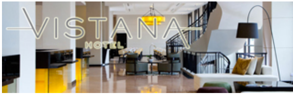
Barista Coffee Bar