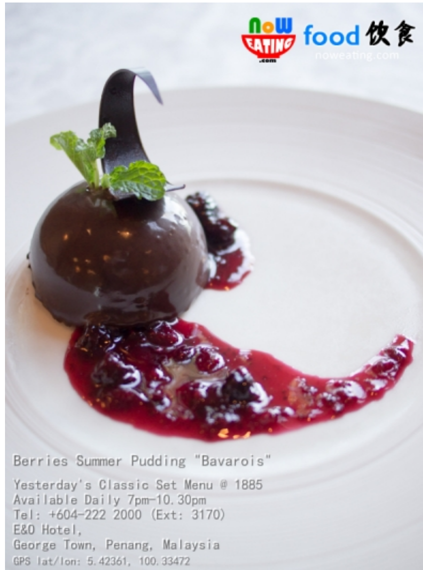
Berries Summer Pudding "Bavarois"

with spring vegetables and shellfish butter. Red Snapper generally goes well with any gravy, from mild to spicy. We enjoyed the de-boned whole side of fish fillet with 1885's unique shellfish butter sauce.