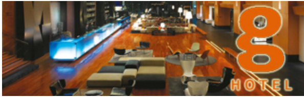
Gravity Rooftop Bar