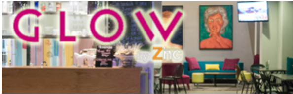
2015 New Set Lunch