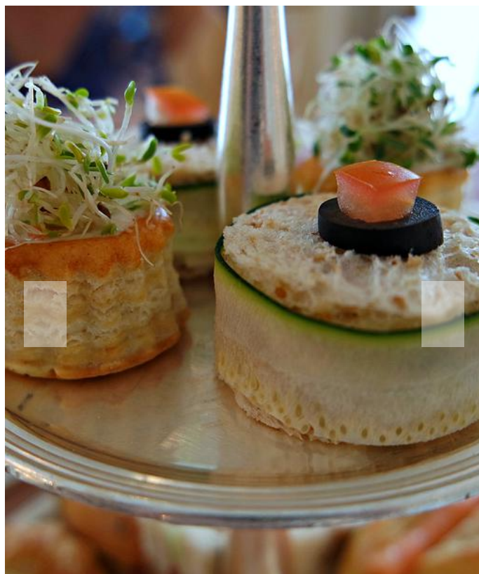
Finger Sandwiches And Pastries