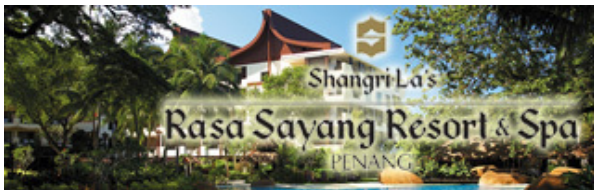
NEW! Rooted in Nature